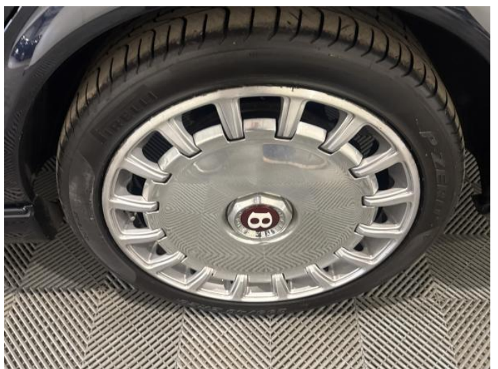
7: Door nsr Scratched Over 25mm Not Thru Paint