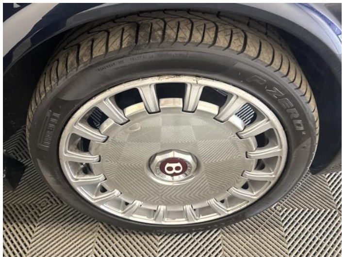
18: Wheel osf Scratched Over 50mm