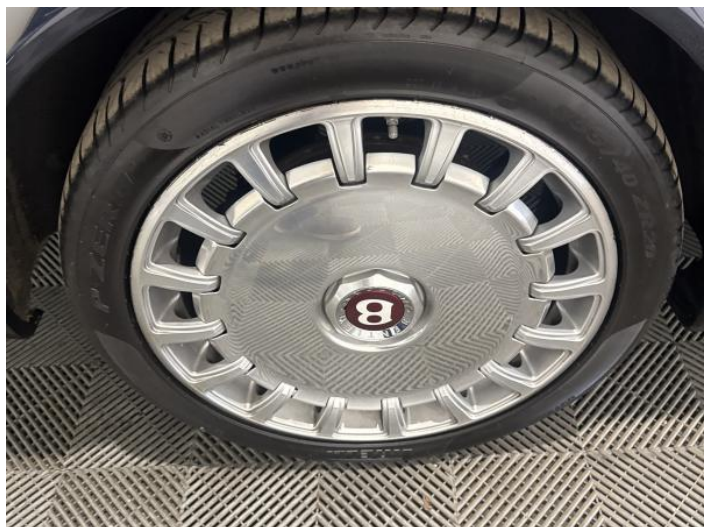
13: Qtr Panel osr Scratched Over 25mm Not Thru Paint