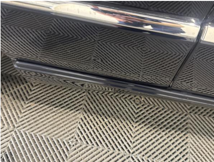
5: Wing nsf Dented Between 10mm + 30mm