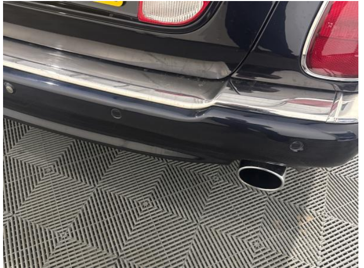
9: Qtr Panel nsr Scratched Over 25mm Not Thru Paint