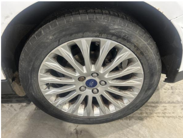
15: Wheel nsr Scratched Over 50mm