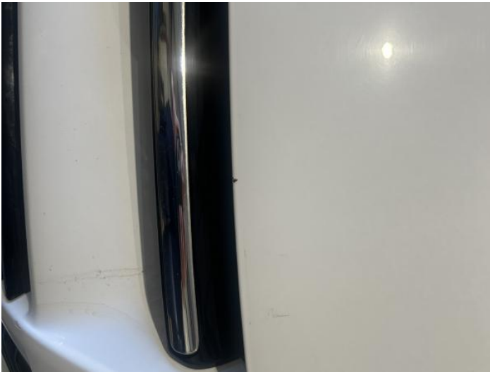
11: Bonnet Chipped 1 To 5