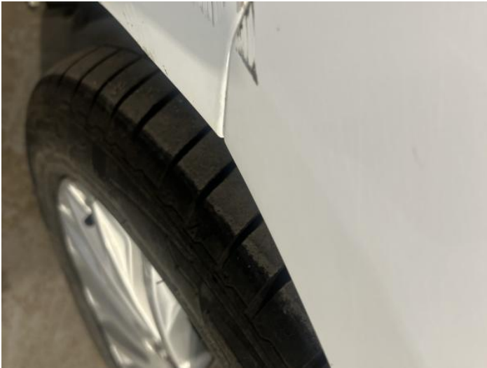
9: Wing nsf Scratched UpTo 25mm Thru Paint