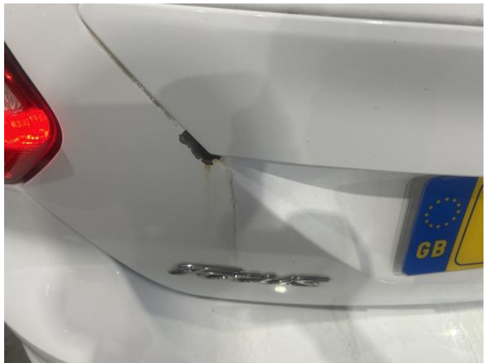
4: Tailgate Chipped Over 5mm