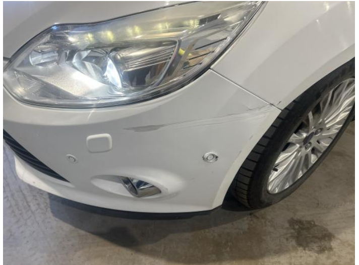
10: Bumper Front Scratched Over 100mm Thru Paint