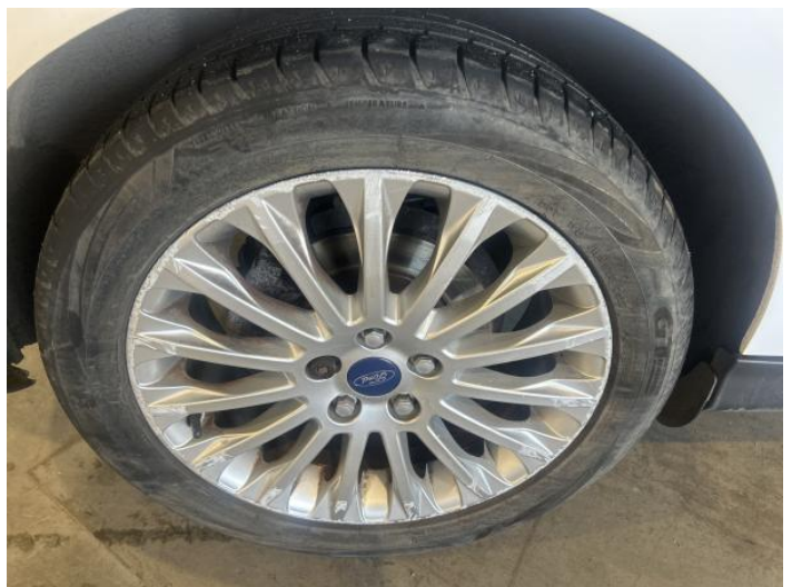
14: Wheel osr Scratched Over 50mm