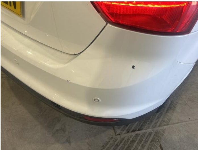
3: Bumper Rear Scratched Over 100mm Thru Paint