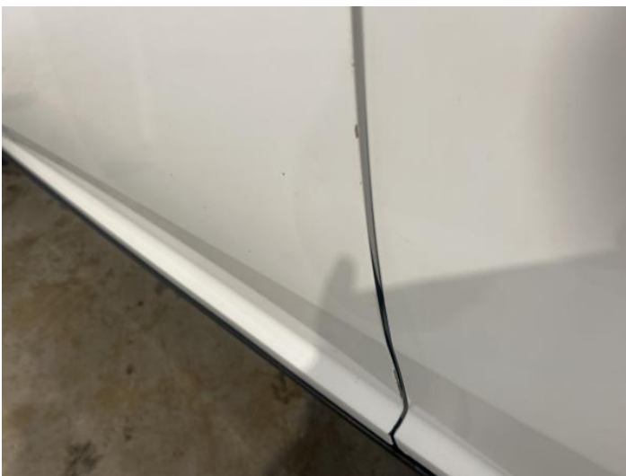
7: Door nsf Dented Between 10mm + 30mm