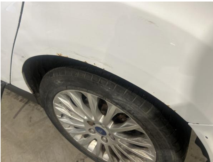
5: Qtr Panel nsr Dented With Paint Damage