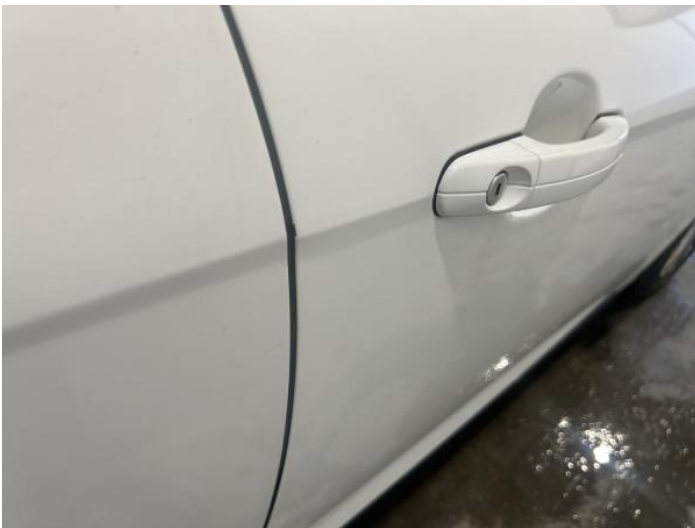
1: Door osf Chipped Edge Chip