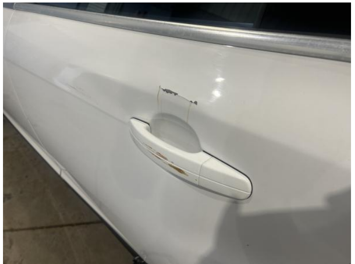
6: Door nsr Dented With Paint Damage