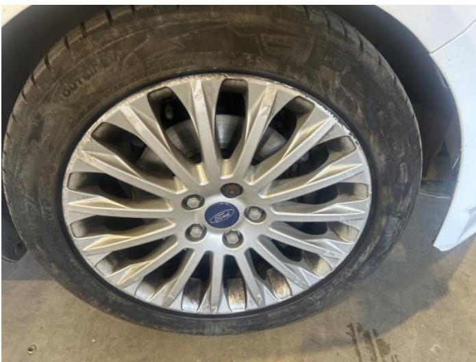
13: Wheel osf Scratched Over 50mm