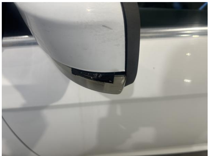
8: Door Mirror Assy nsf Broken Replace