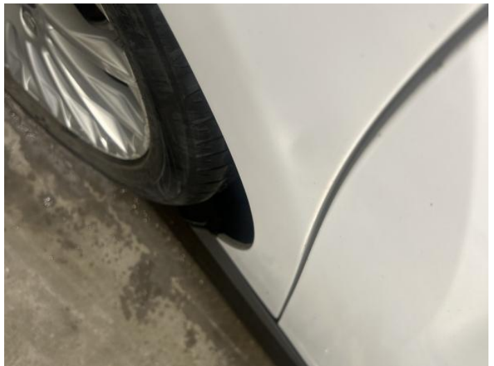
2: Qtr Panel osr Dented Between 10mm + 30mm