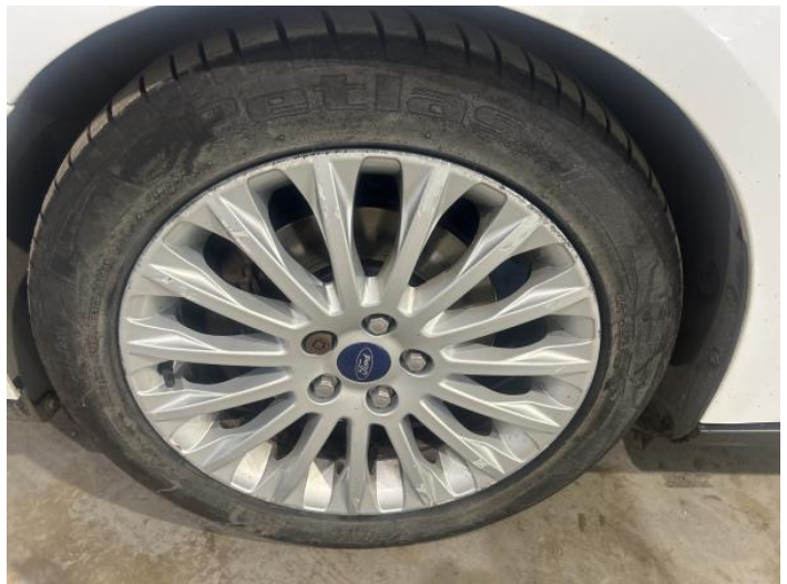
16: Wheel nsf Scratched Over 50mm