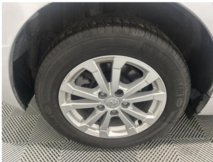
2: Wheel osr Scratched Over 50mm