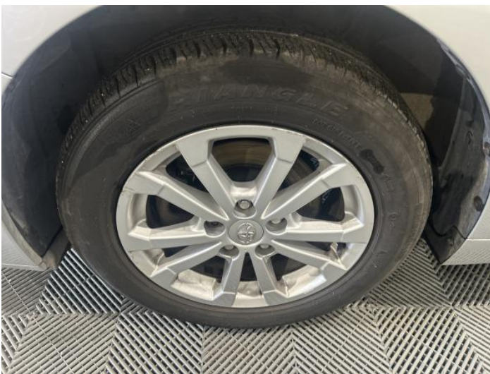
7: Wheel nsf Scratched Over 50mm