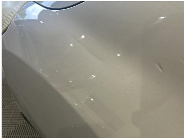
6: Wing nsf Dented With Paint Damage