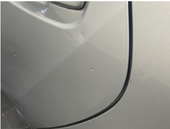
5: Door nsr Dented 2 Or Less UpTo 10mm