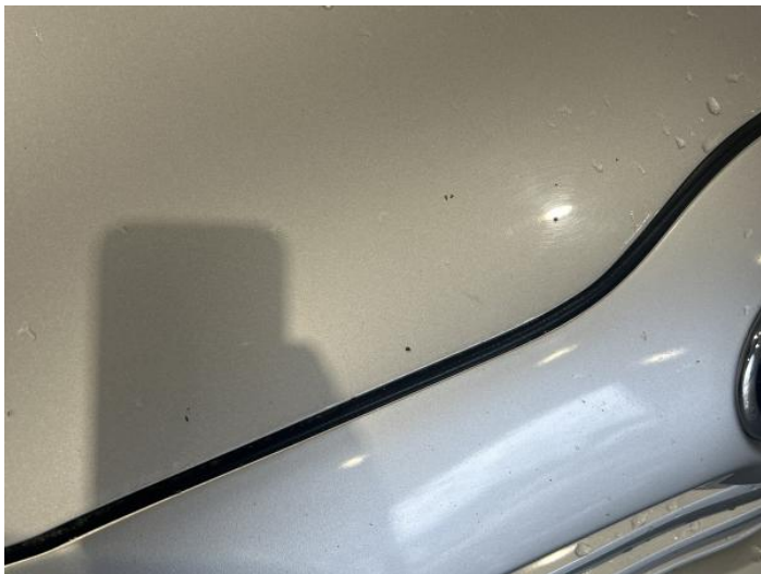
9: Bonnet Chipped Multiple Chips