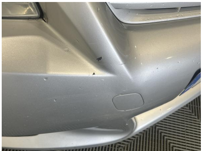
8: Bumper Front Poor Previous Repair Paint Flake