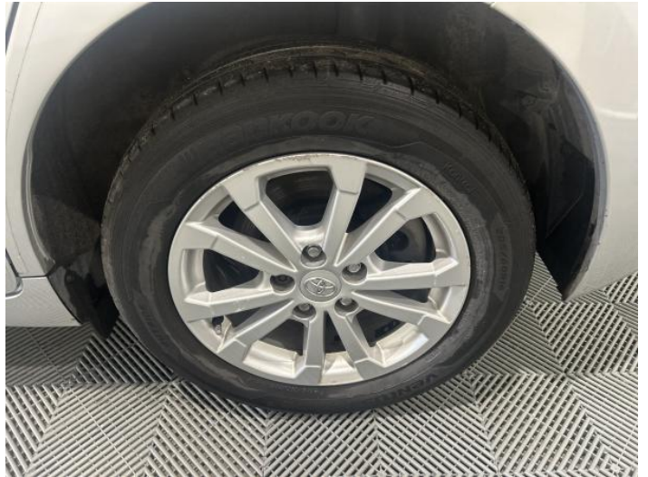
4: Wheel nsr Scratched Over 50mm