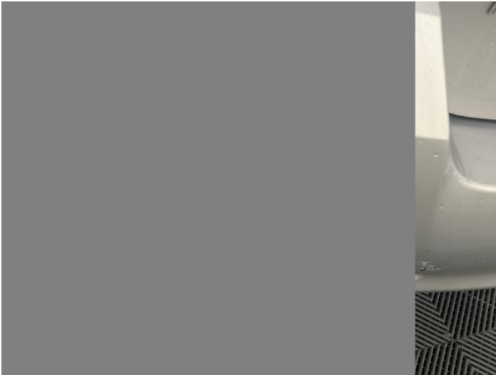
3: Bumper Rear Scratched 25 to 100mm Thru Paint