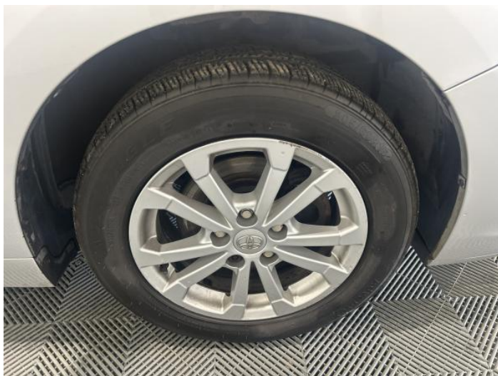
1: Wheel osf Scratched Over 50mm