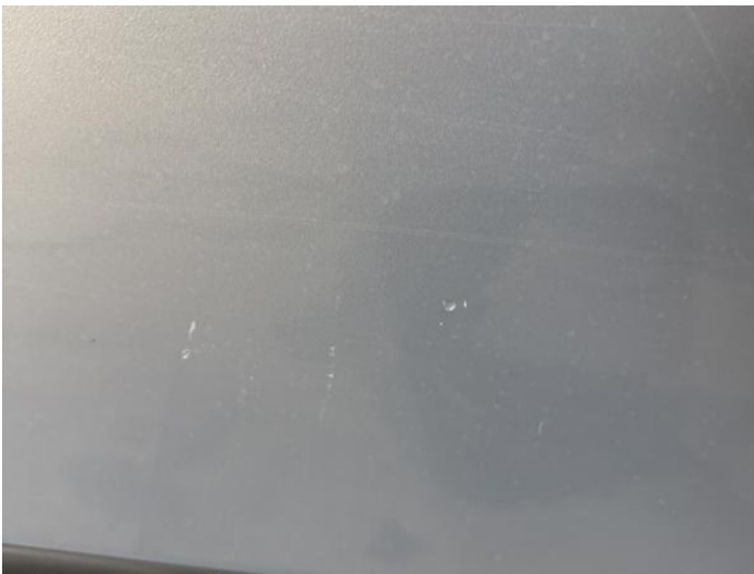
5: Door nsf Chipped 1 To 5