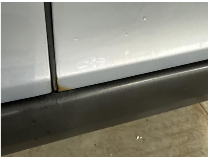
13: Door osf Rusted UpTo 5mm