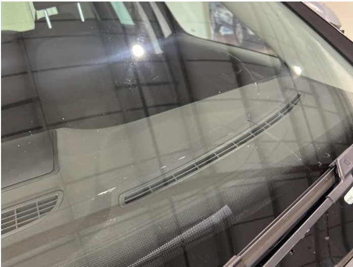
17: Screen Front Cracked Replace