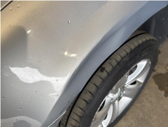
3: Wing nsf Dented Over 30mm