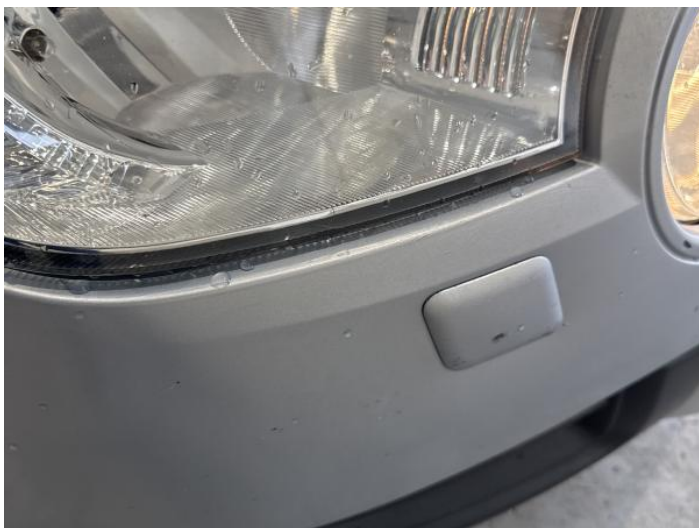
1: Bumper Front Poor Previous Repair Poor Paint