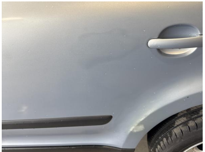
6: Door nsr Poor Previous Repair Poor Colour