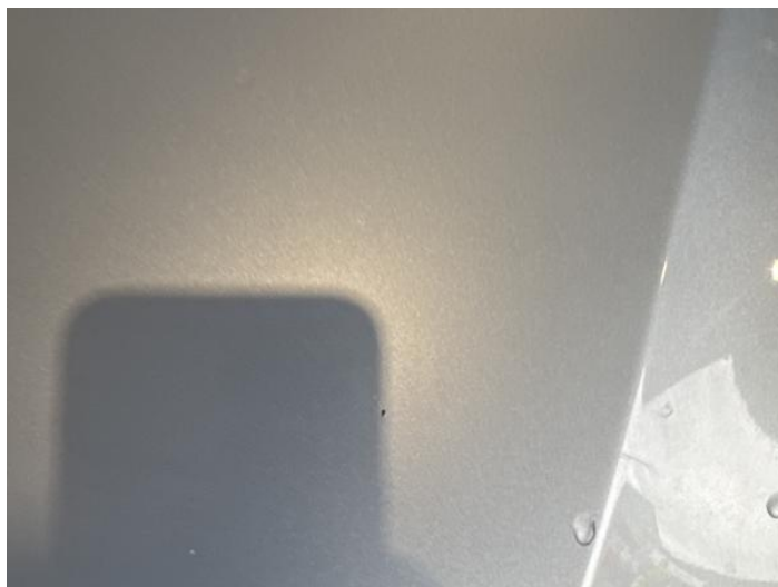
2: Bonnet Chipped 1 To 5