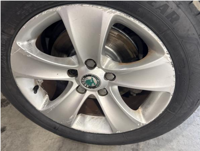
15: Wheel osf Scratched Over 50mm