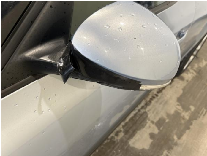
16: Door Mirror Assy nsf Broken Replace