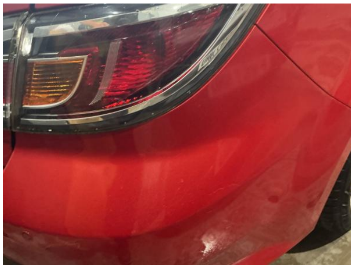
2: Bumper Rear Scratched Over 100mm Thru Paint