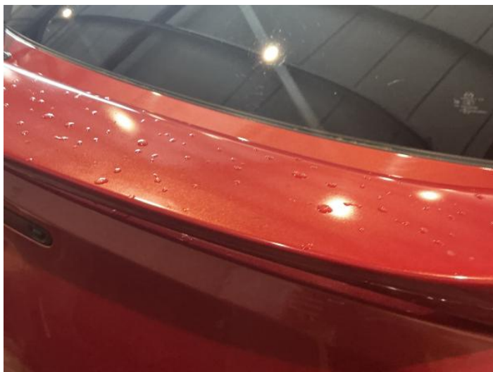
1: Boot Lid Scratched Over 25mm Not Thru Paint