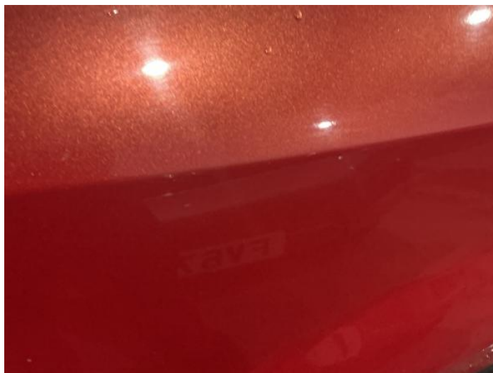
4: Qtr Panel osr Chipped 1 To 5