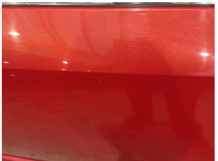
14: Door nsr Chipped 1 To 5