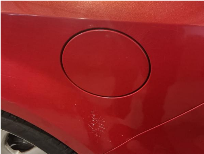
15: Qtr Panel nsr Poor Previous Repair Poor Paint