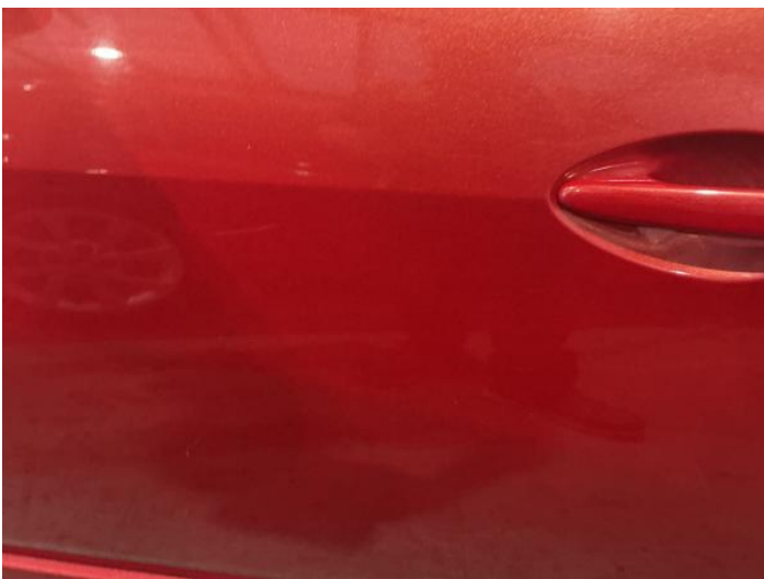
13: Door nsf Dented Over 2 UpTo 10mm