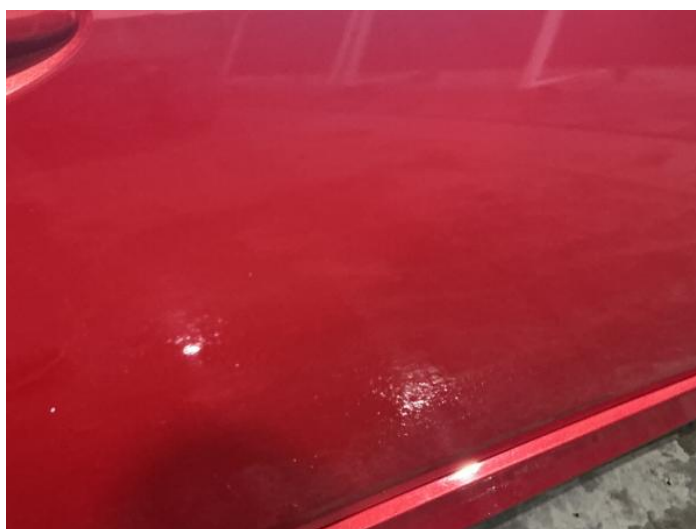
6: Door osf Chipped 1 To 5