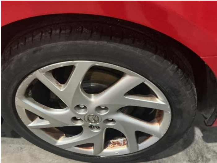
16: Wheel nsr Scratched Over 50mm