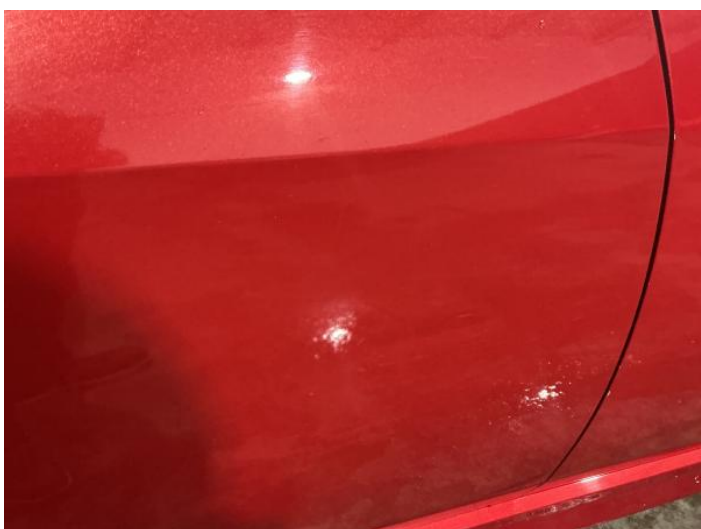
5: Door osr Dented Over 30mm