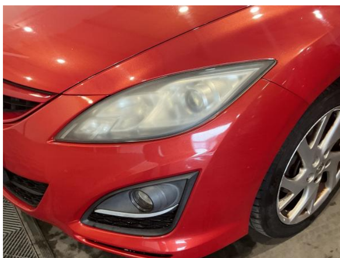
8: Bumper Front Scratched 25 to 100mm Thru Paint