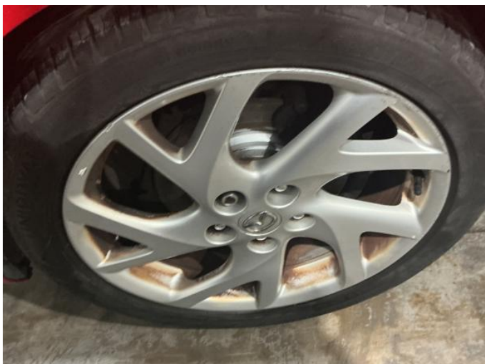
3: Wheel osr Scratched Over 50mm