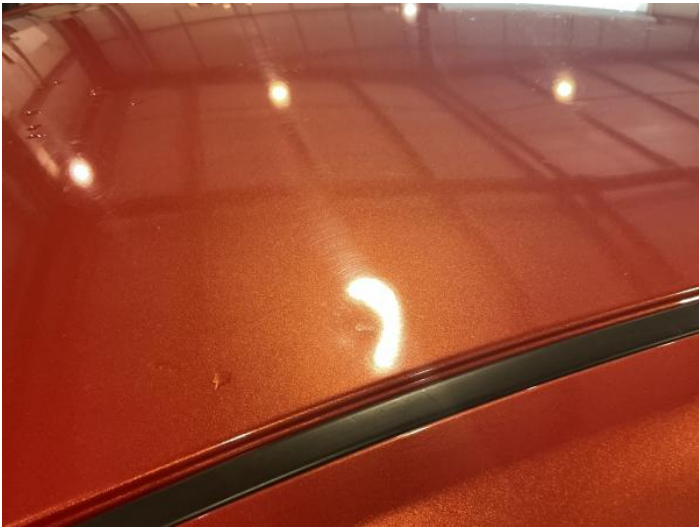
17: Roof Dented Between 10mm + 30mm