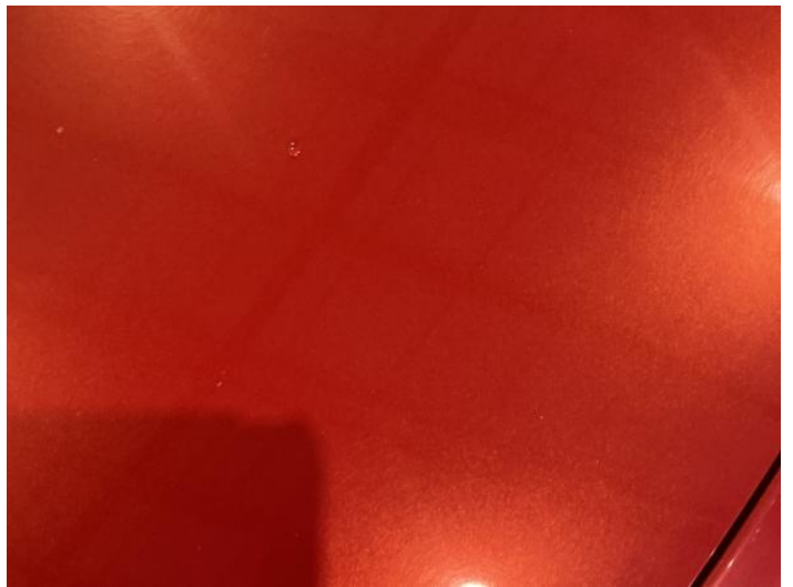
10: Bonnet Chipped 1 To 5