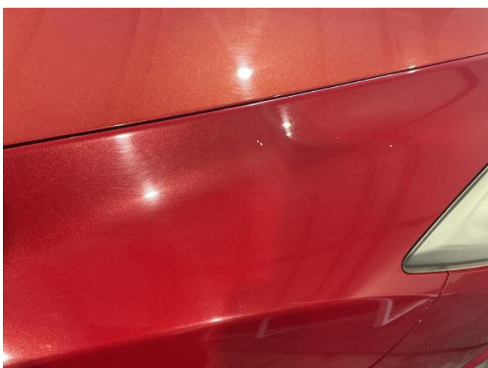
7: Wing osf Chipped Multiple Chips