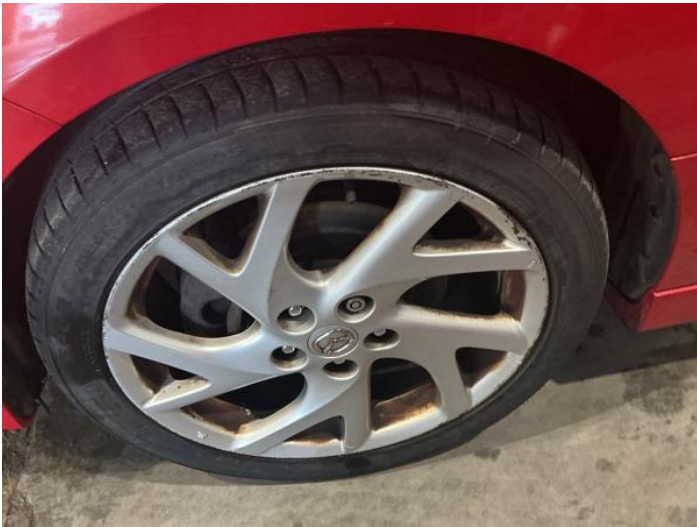
11: Wheel nsf Scratched Over 50mm