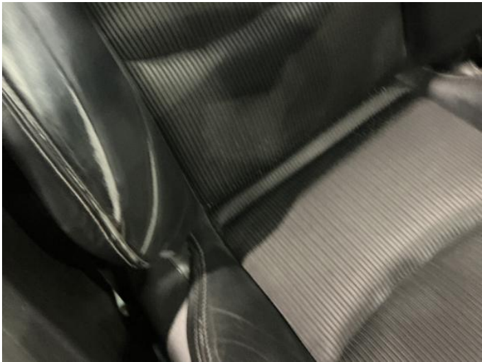
18: Seat Back Cover osf Torn Over 3mm

Carpet Condition Average Seat Condition Poor