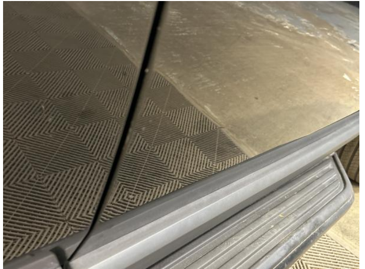
4: Door osf Chipped Edge Chip