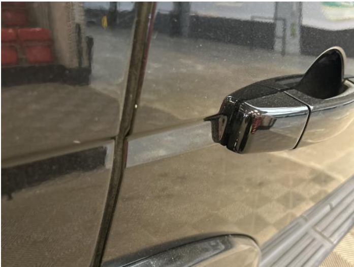
5: Door osr Chipped Edge Chip