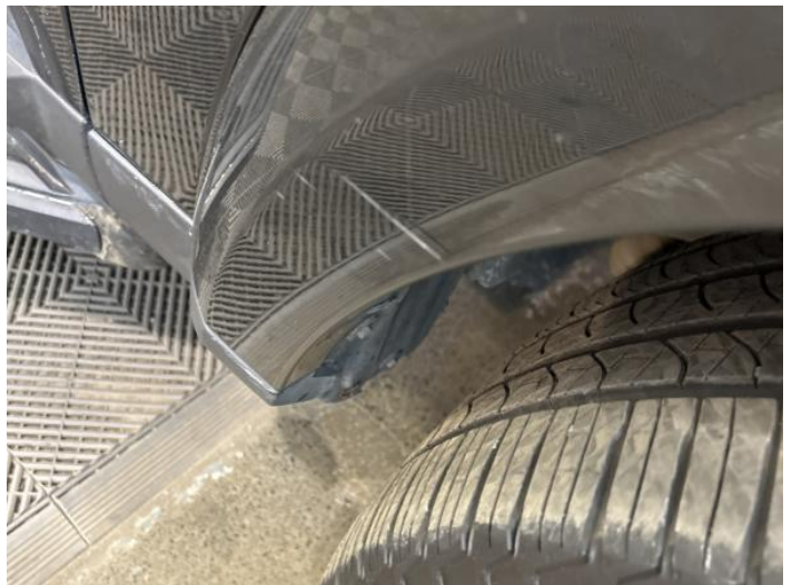
2: Wing Front Arch Extension os Scratched (Painted) Over 25mm Thru Paint