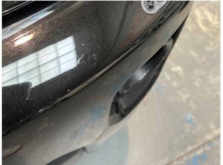
10: Bumper Front Chipped 1 To 5