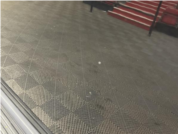
3: Door osf Chipped 1 To 5