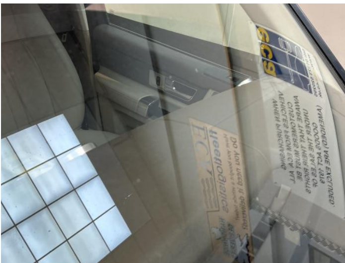
13: Screen Front Chipped Up To 10mm