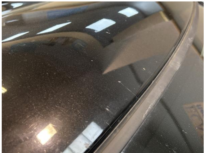
12: Roof Chipped 1 To 5