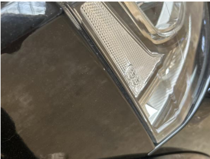
1: Wing osf Chipped 1 To 5