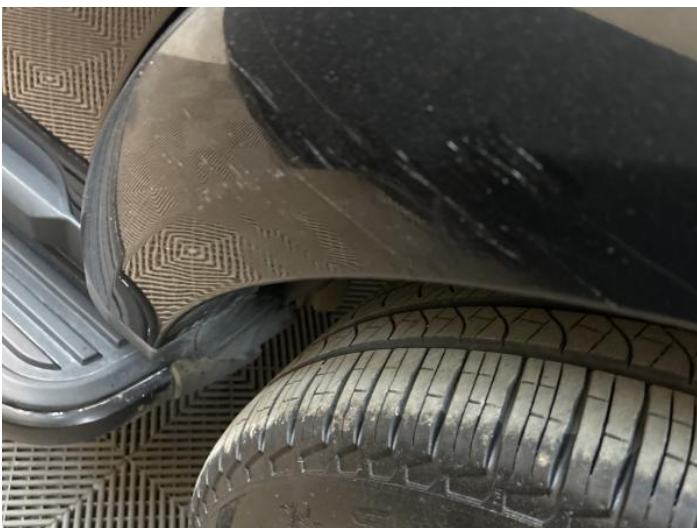
7: Door Moulding nsr Scratched (Painted) Over 25mm Thru Paint