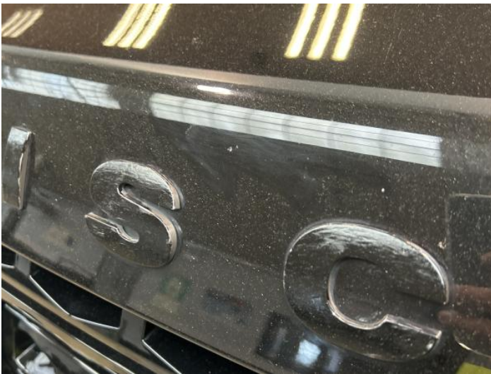
11: Bonnet Chipped 1 To 5