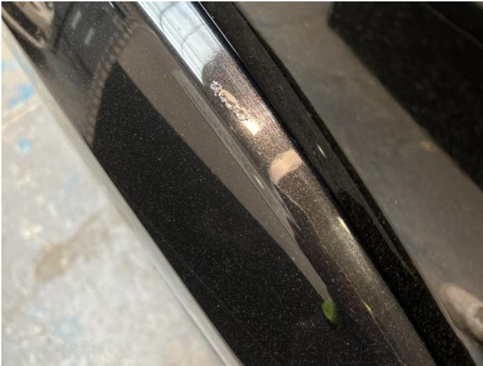
9: Wing Front Arch Extension ns Scratched (Painted) Over 25mm Thru Paint