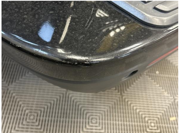
6: Bumper Rear Scratched 25 to 100mm Thru Paint