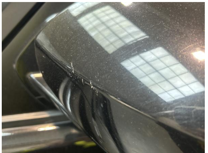
8: Door Mirror Assy nsf Scratched (Painted) UpTo 25mm Thru Paint