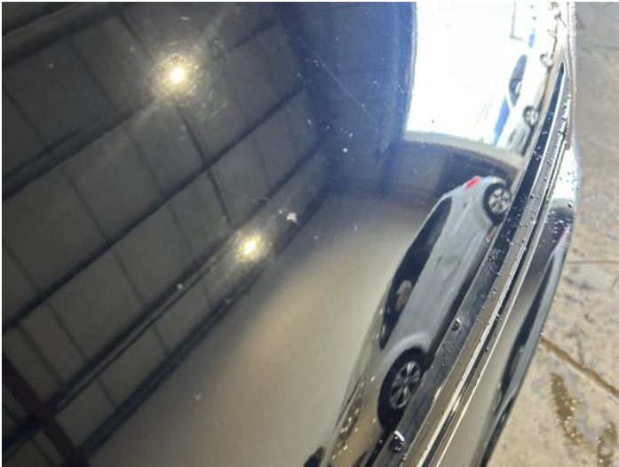
9: Bonnet Chipped 1 To 5