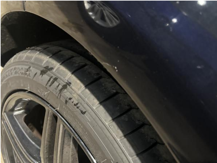
3: Qtr Panel osr Chipped 1 To 5