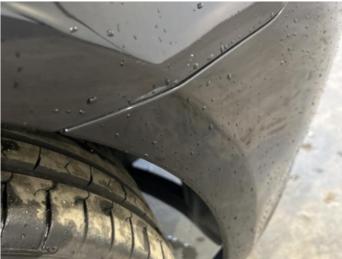
1: Wing osf Scratched UpTo 25mm Thru Paint