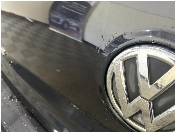
11: Tailgate Scratched Up To 25mm Thru Paint