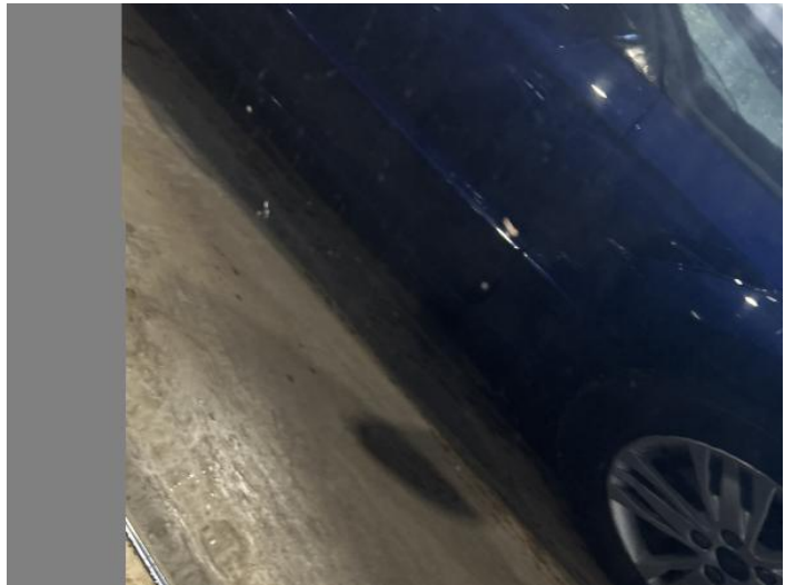
2: Door osf Chipped 1 To 5