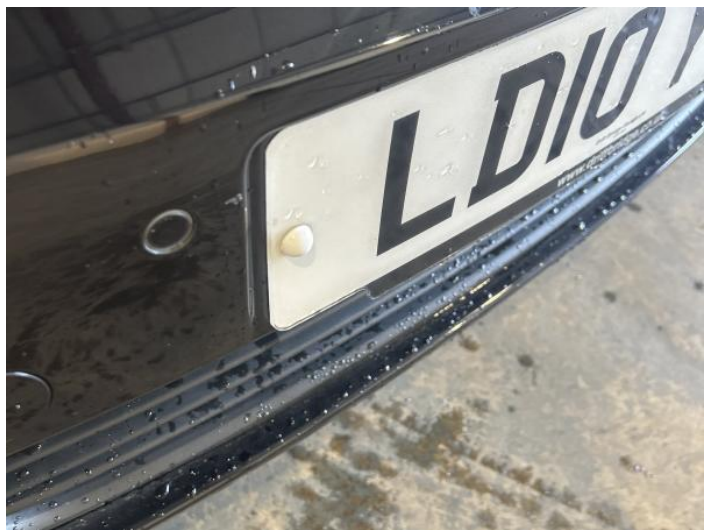
8: Bumper Front Chipped Multiple Chips