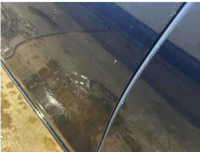
7: Door nsf Chipped 1 To 5