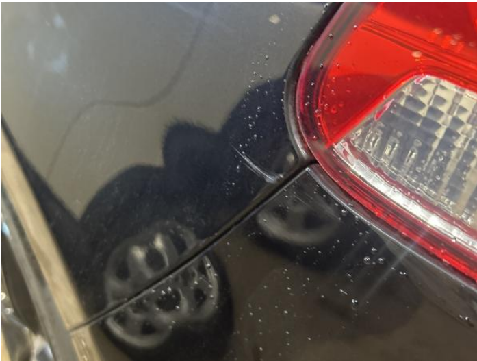
5: Qtr Panel nsr Scratched UpTo 25mm Thru Paint