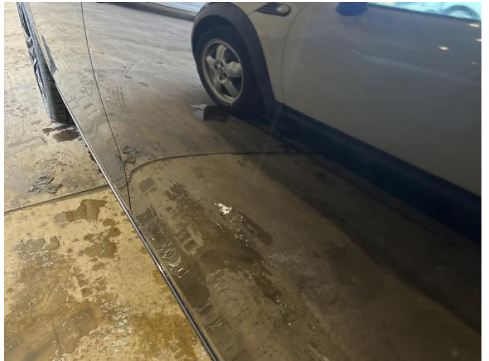
6: Door nsr Dented 2 Or Less UpTo 10mm