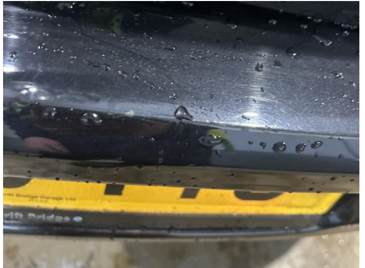
4: Bumper Rear Chipped 1 To 5