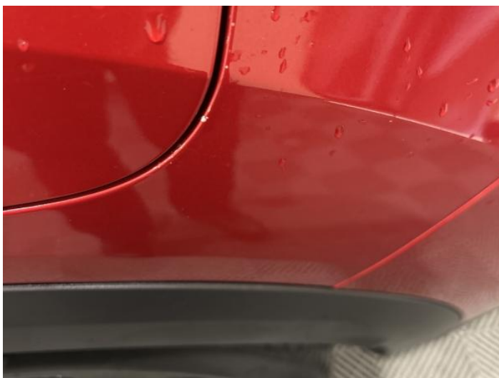
5: Qtr Panel nsr Chipped 1 To 5