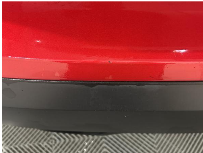
4: Bumper Rear Chipped 1 To 5