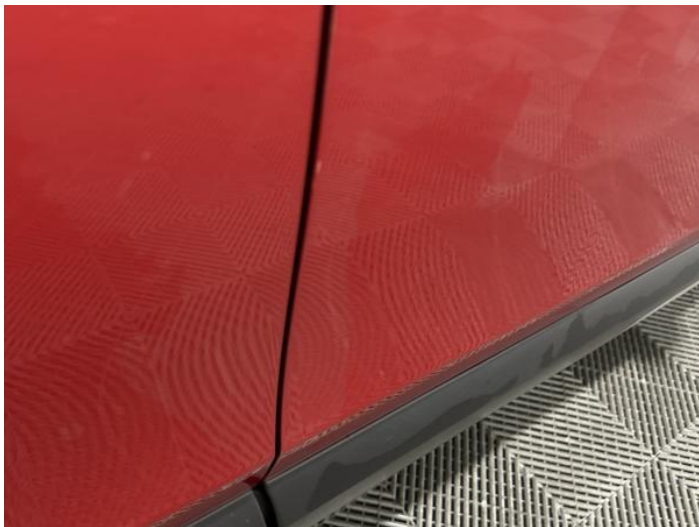
3: Door osf Chipped Edge Chip