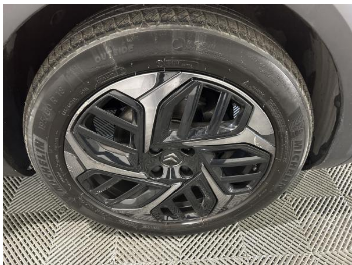
1: Wheel osf Scratched Over 50mm