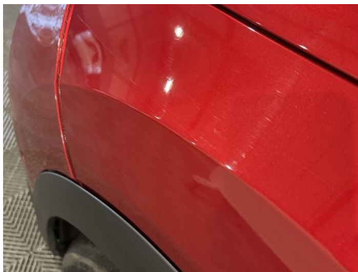
6: Wing nsf Scratched Over 25mm Not Thru Paint