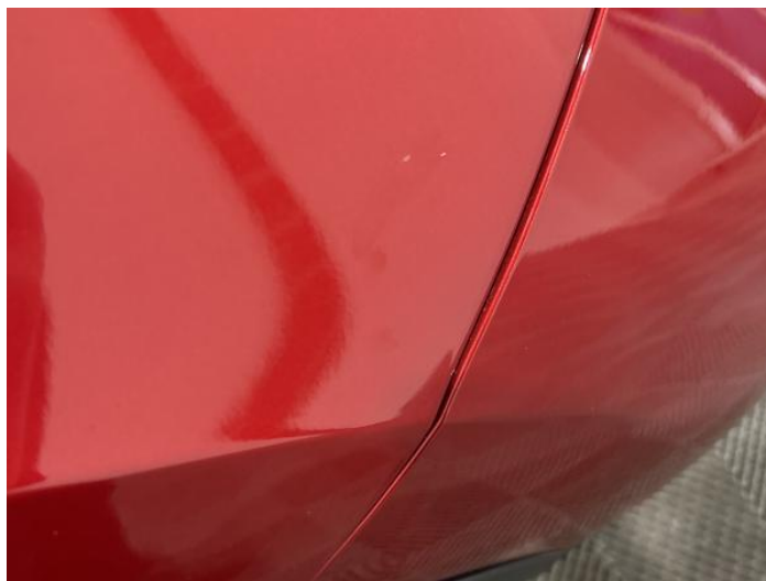
2: Wing osf Chipped 1 To 5