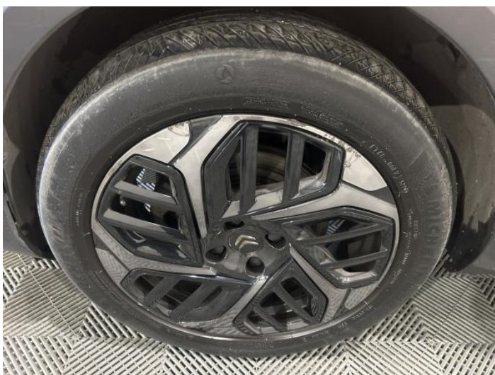
7: Wheel nsf Scratched Over 50mm