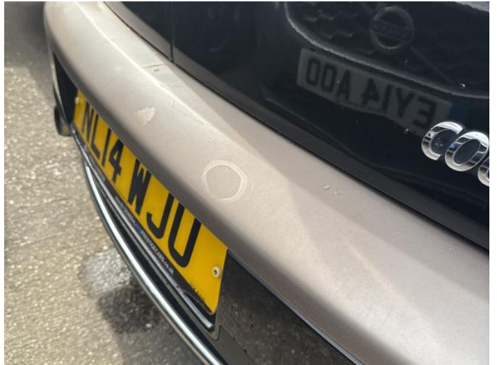
10: Bumper Rear Moulding Scratched (Painted) Over 25mm Thru Paint