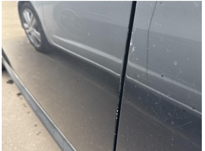
6: Door nsf Scratched Over 25mm Thru Paint