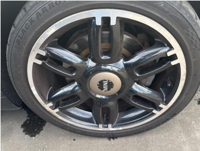
15: Wheel osf Scratched Over 50mm