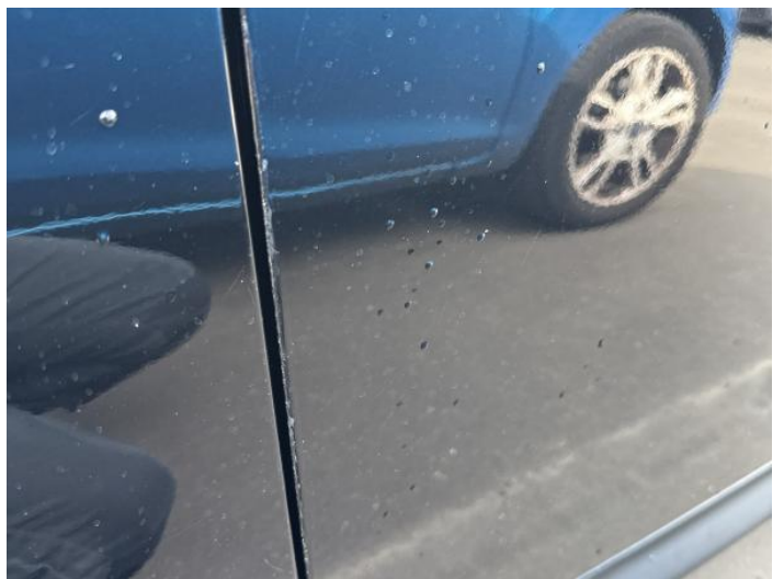
14: Door osf Chipped Edge Chip