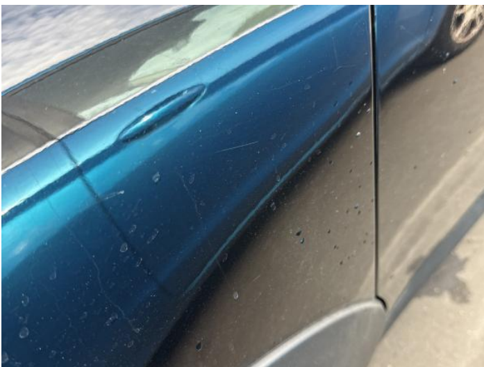
13: Qtr Panel osr Scratched Over 25mm Thru Paint