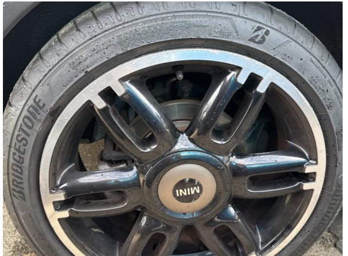
12: Wheel osr Scratched Over 50mm