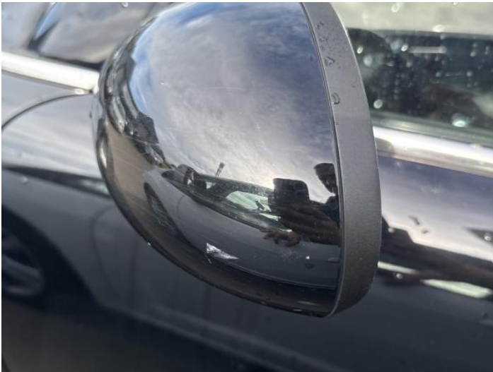
5: Door Mirror Assy nsf Scratched (Painted) UpTo 25mm Thru Paint