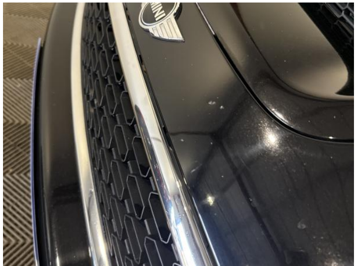
18: Bumper Front Grill Broken Replace