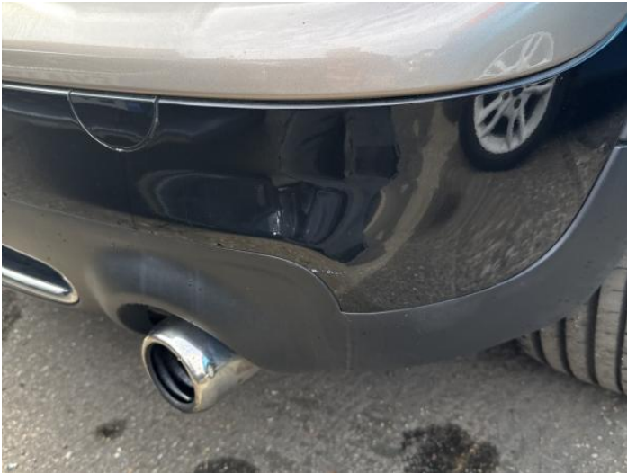
9: Bumper Rear Scratched 25 to 100mm Thru Paint