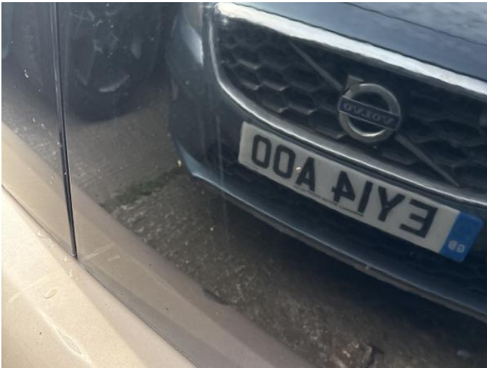
11: Tailgate Scratched Over 25mm Thru Paint