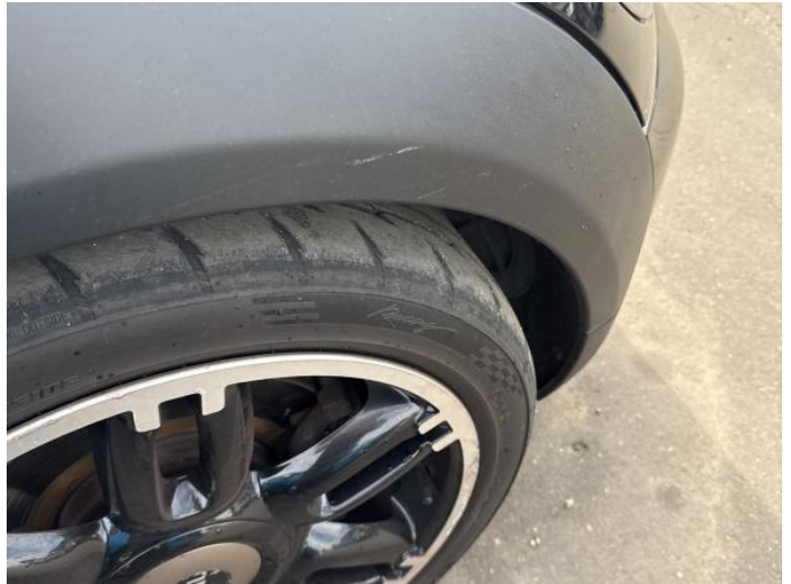
16: Wing Front Arch Extension os Scuffed (Unpainted) Over 100mm