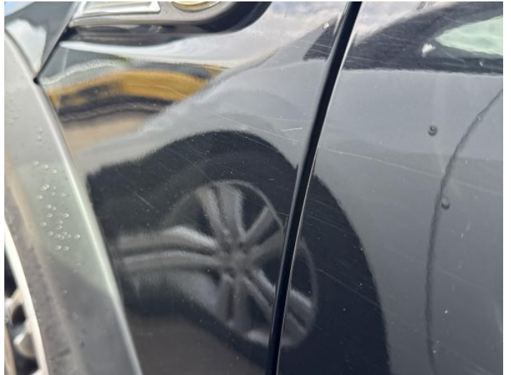
4: Wing nsf Scratched UpTo 25mm Thru Paint