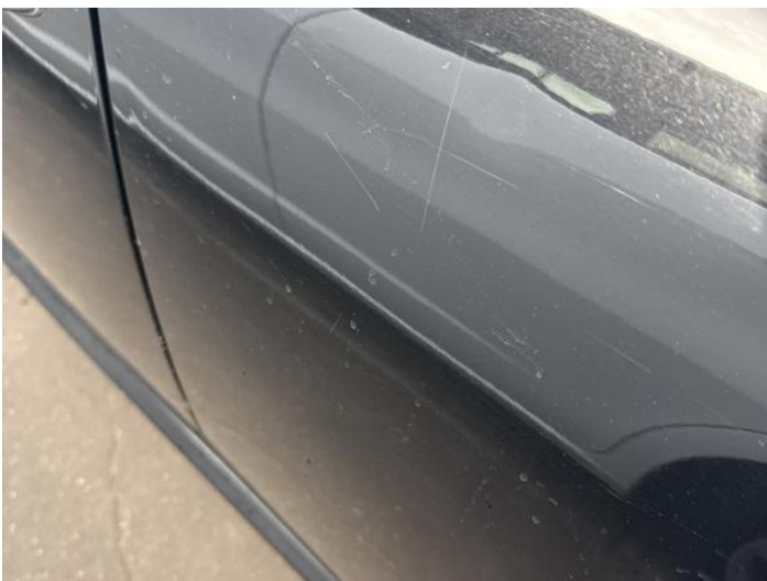
7: Qtr Panel nsr Dented With Paint Damage