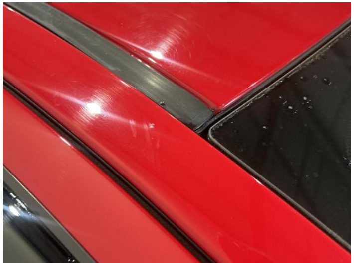
12: A Post os Chipped 1 To 5