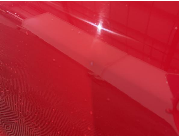
5: Door nsf Chipped 1 To 5