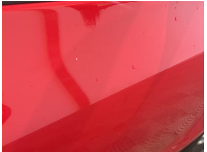
2: Door osf Chipped 1 To 5