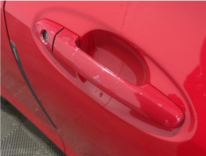
3: Other N/A N/A