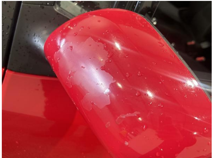
6: Door Mirror Assy nsf Scratched (Painted) Over 25mm Thru Paint