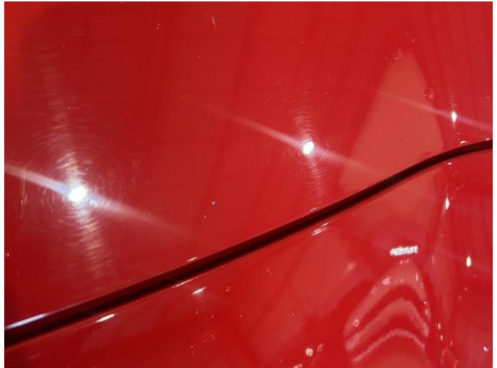
10: Bonnet Chipped 1 To 5