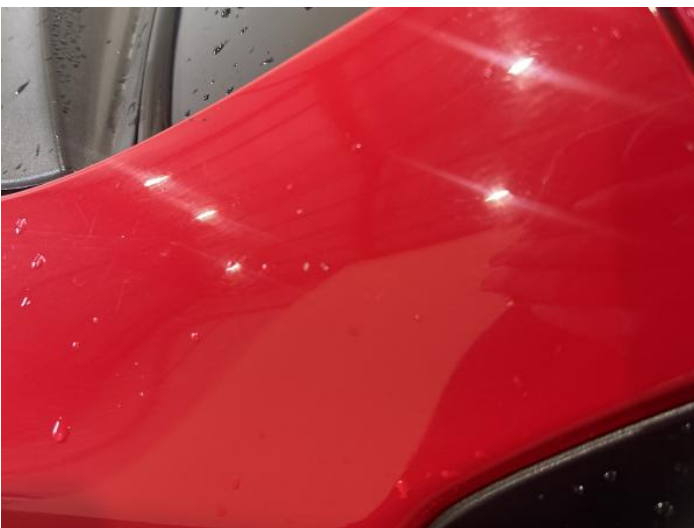
7: Wing nsf Chipped 1 To 5