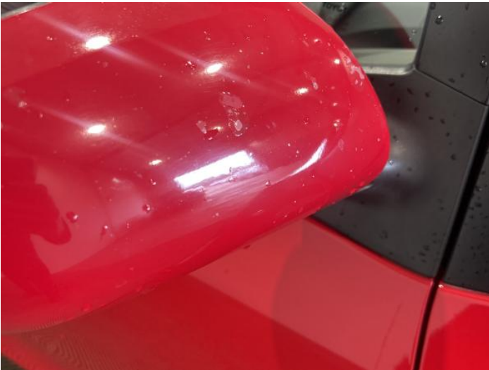
1: Door Mirror Assy osf Scratched (Painted) Over 25mm Thru Paint