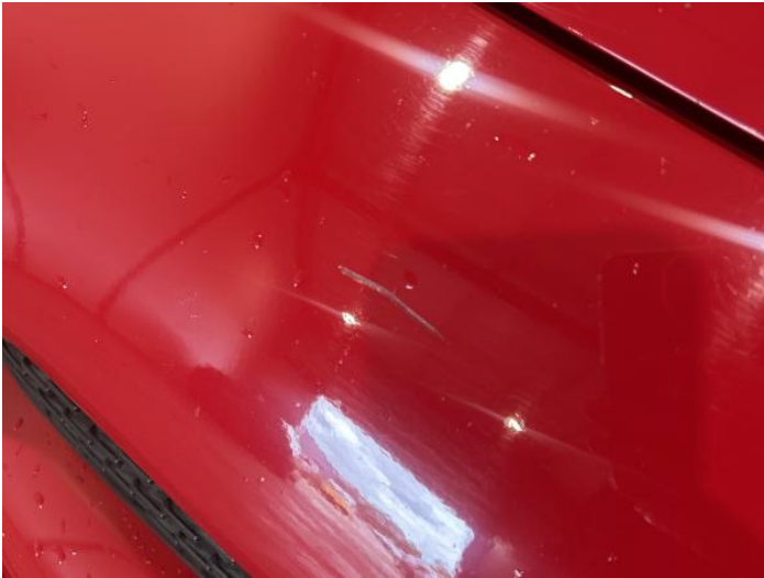
9: Bumper Front Scratched 25 to 100mm Thru Paint