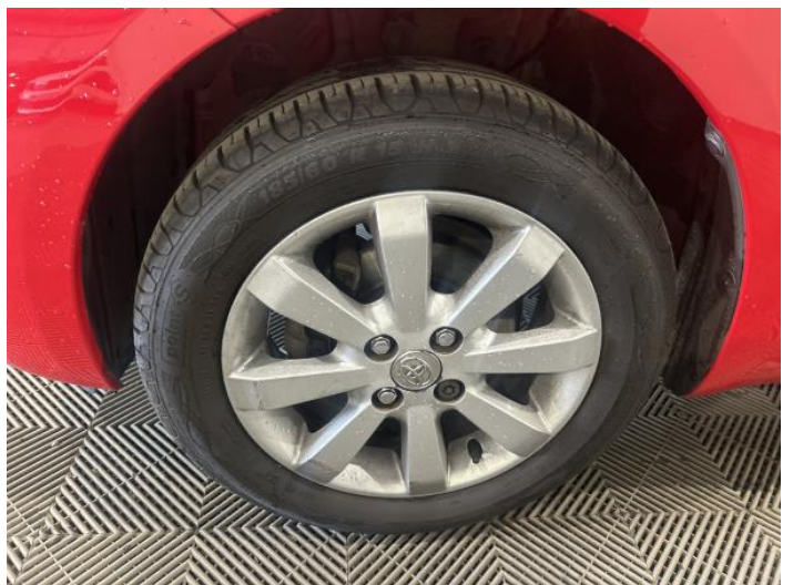
8: Wheel nsf Scratched Over 50mm