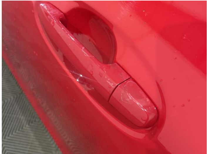
4: Other N/A N/A