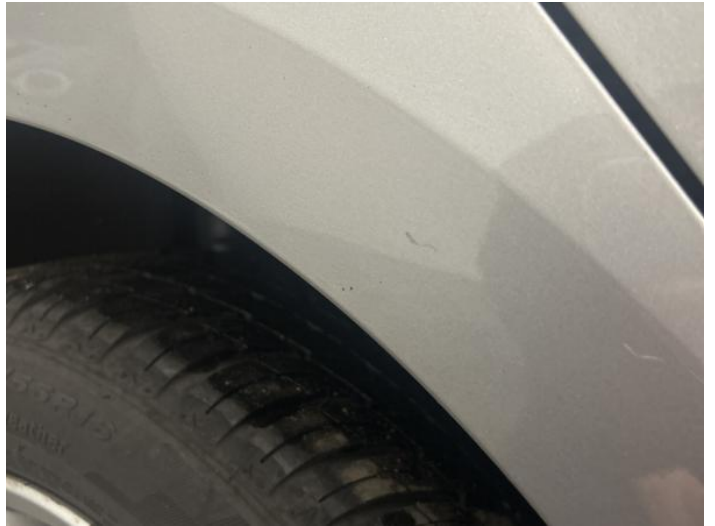
4: Qtr Panel osr Chipped 1 To 5