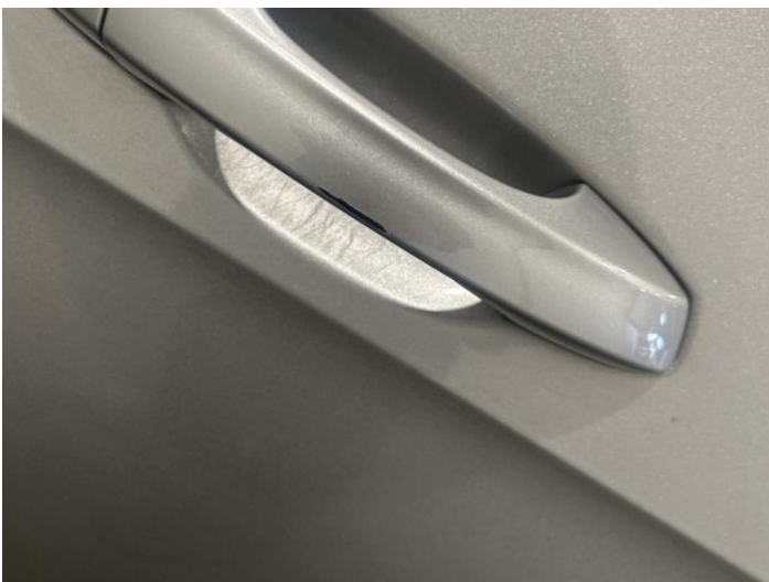
13: Other N/A N/A