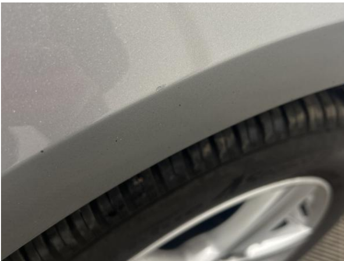
1: Wing osf Chipped 1 To 5