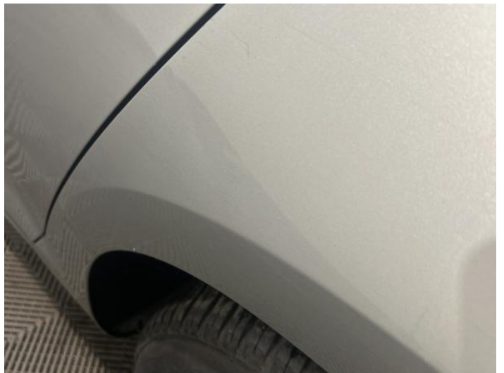
6: Qtr Panel nsr Dented Over 30mm