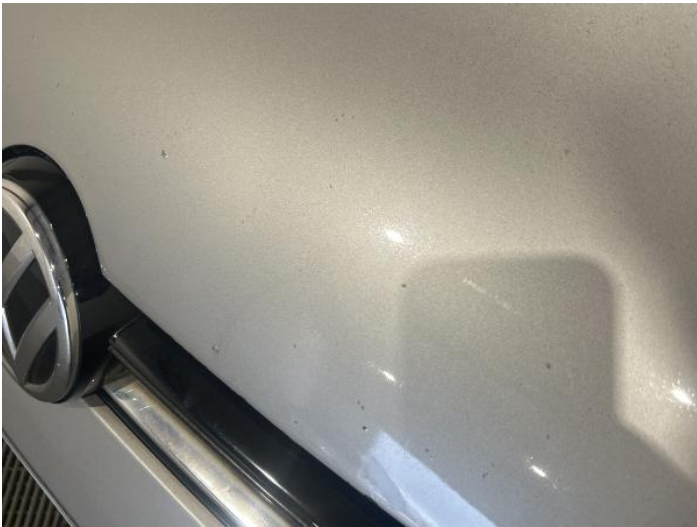
11: Bonnet Chipped Multiple Chips