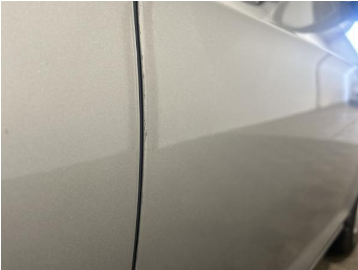
3: Door osf Chipped Edge Chip