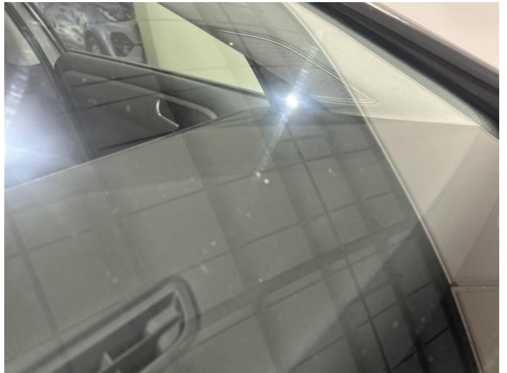
12: Screen Front Chipped UpTo 10mm