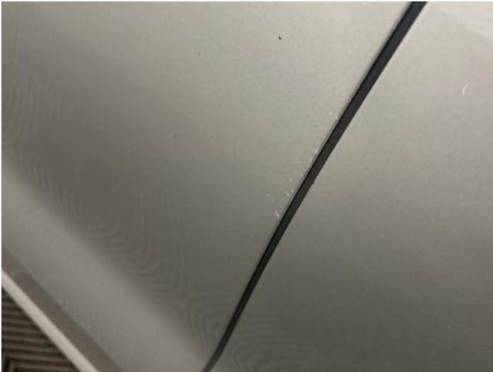
9: Door nsf Chipped 1 To 5