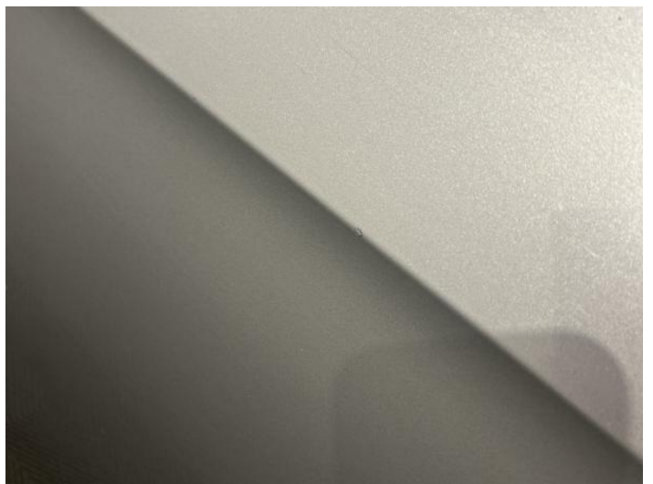
8: Door nsr Chipped 1 To 5