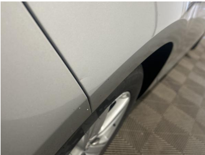
5: Qtr Panel osr Dented 2 Or Less UpTo 10mm