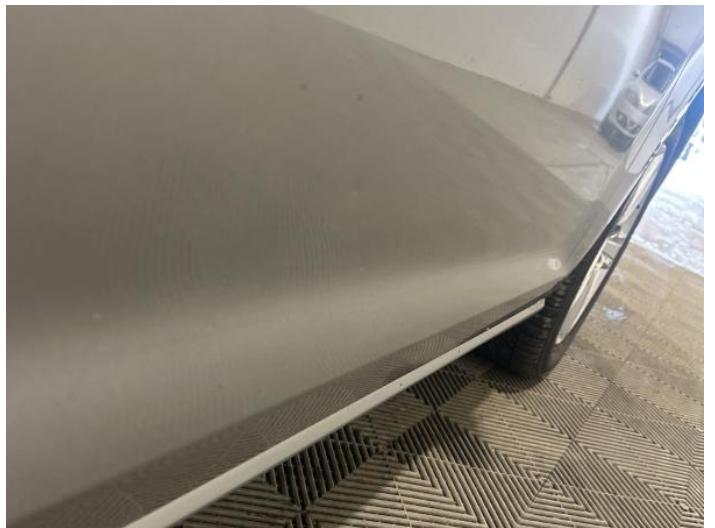
2: Door osf Dented Between 10mm + 30mm