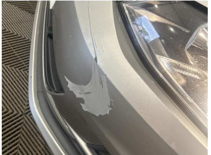
10: Bumper Front Poor Previous Repair Paint Flake