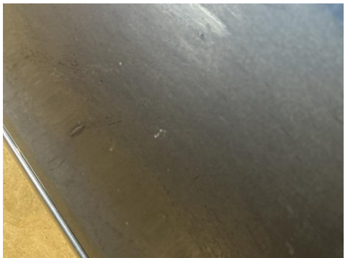
8: Door nsf Chipped 1 To 5