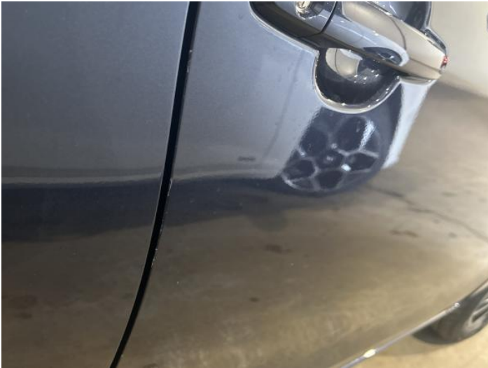
3: Door osf Chipped Edge Chip