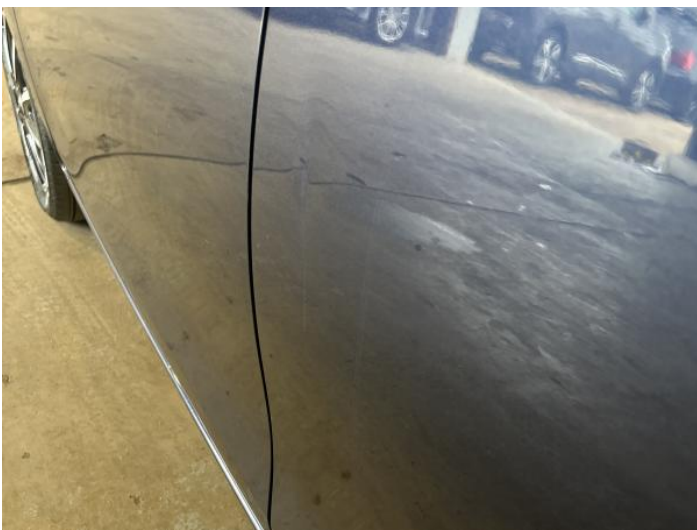
7: Door nsr Dented Over 30mm