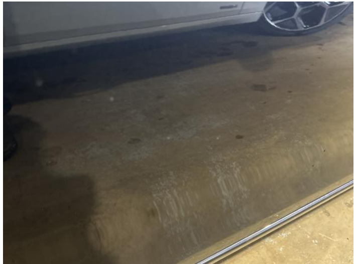
2: Door osf Chipped 1 To 5