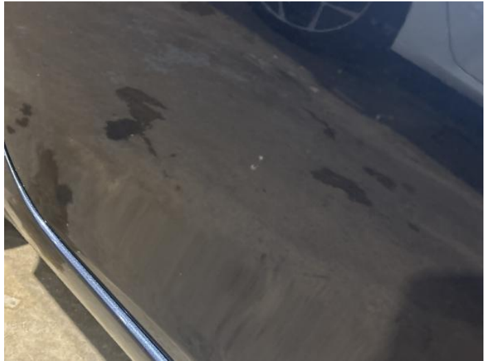
4: Door osr Chipped 1 To 5