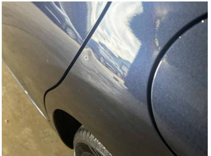
6: Qtr Panel nsr Dented Between 10mm + 30mm