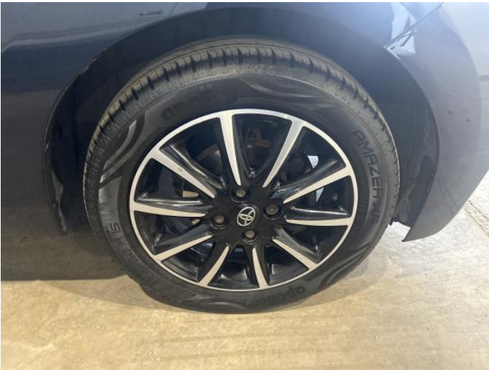
1: Wheel osf Scratched Up To 50mm