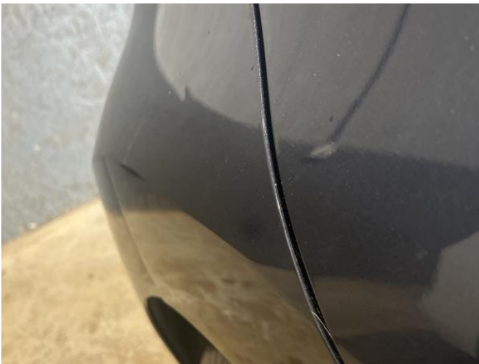
5: Qtr Panel osr Dented 2 Or Less UpTo 10mm