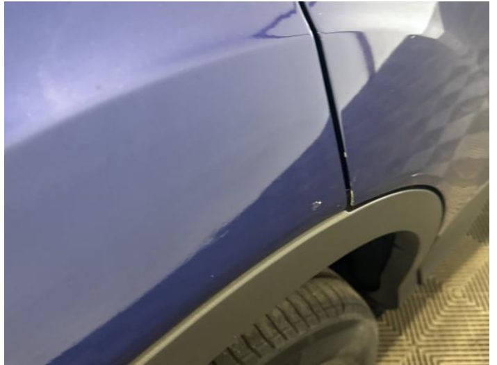
10: Qtr Panel osr Chipped 1 To 5