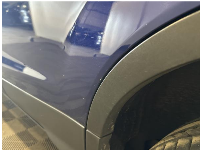
6: Door nsr Chipped 1 To 5