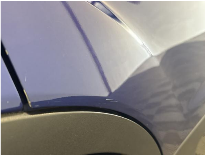
11: Door osr Scratched Over 25mm Thru Paint