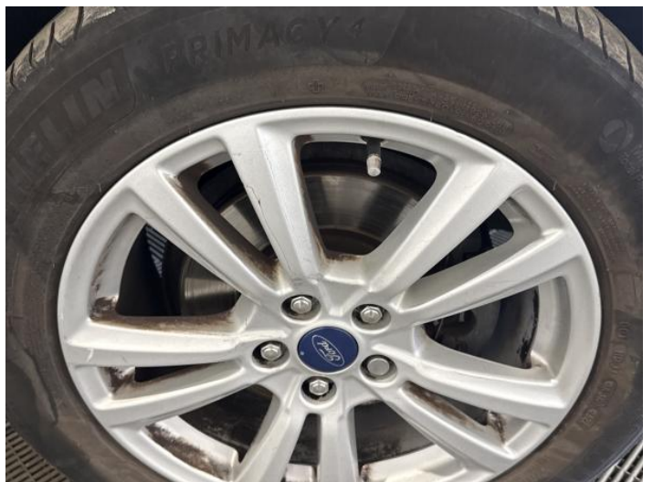
14: Wheel osf Scratched Over 50mm