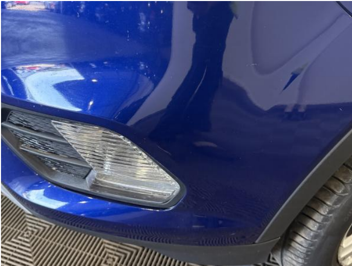
3: Bumper Front Scratched 25 to 100mm Thru Paint