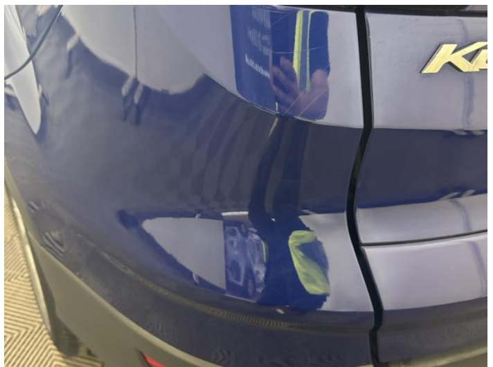
8: Bumper Rear Moulding Scratched (Painted) Over 25mm Thru Paint