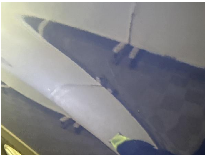
7: Qtr Panel nsr Scratched UpTo 25mm Thru Paint