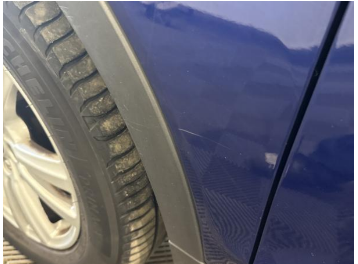
4: Wing nsf Scratched Over 25mm Thru Paint