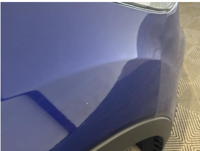
13: Wing osf Chipped 1 To 5