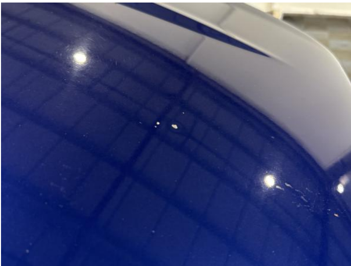
1: Bonnet Dented 2 Or Less Up To 10mm