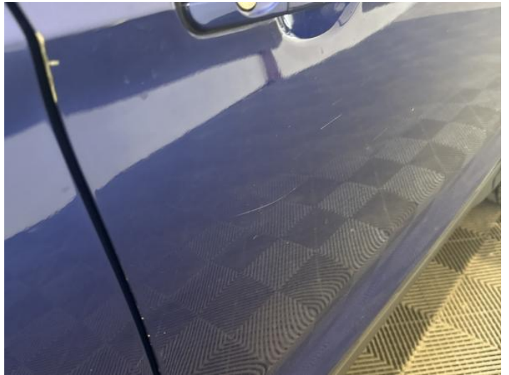
12: Door osf Scratched Over 25mm Thru Paint