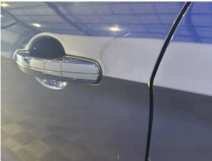
5: Door nsf Dented With Paint Damage