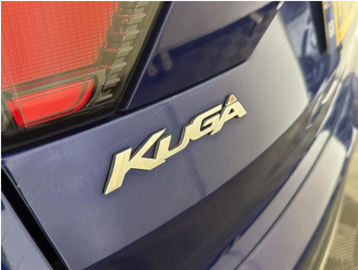
9: Tailgate Scratched Over 25mm Thru Paint