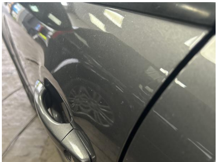
8: Door nsf Dented Over 2 UpTo 10mm