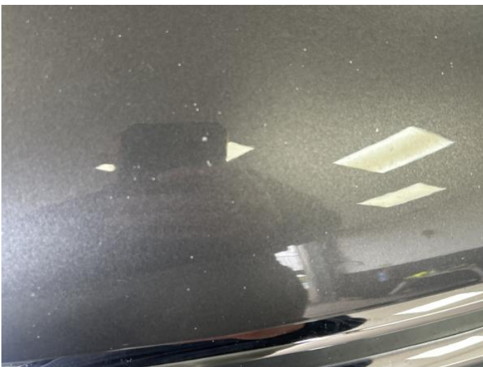
7: Bonnet Chipped Multiple Chips