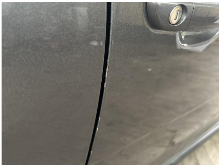
1: Door osf Chipped Edge Chip