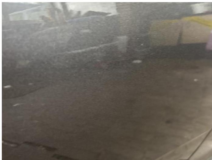
2: Door osr Scratched Over 25mm Not Thru Paint