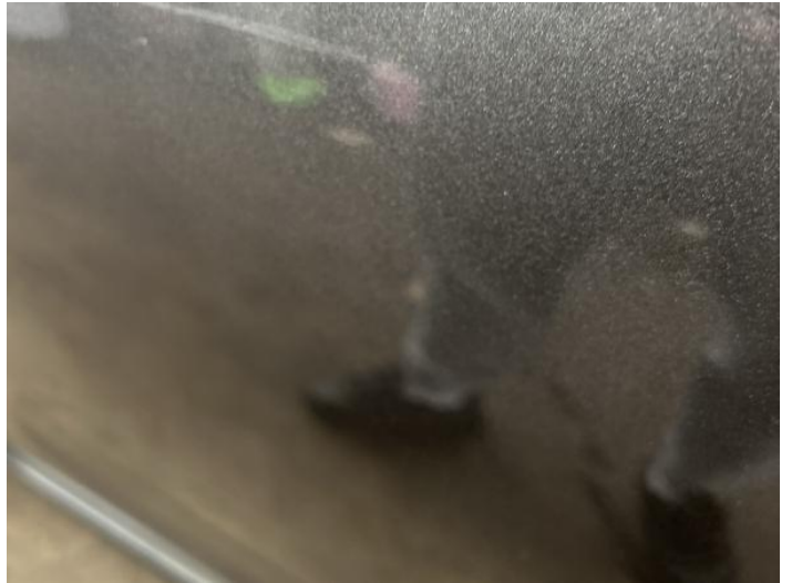
4: Door osr Dented 2 Or Less UpTo 10mm