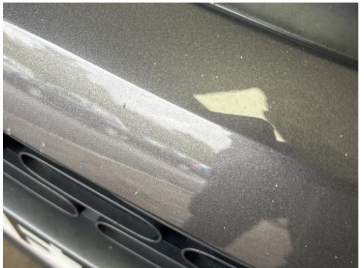
6: Bumper Front Chipped Multiple Chips