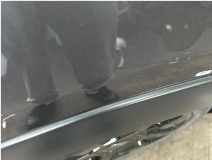
3: Qtr Panel osr Dented Between 10mm + 30mm