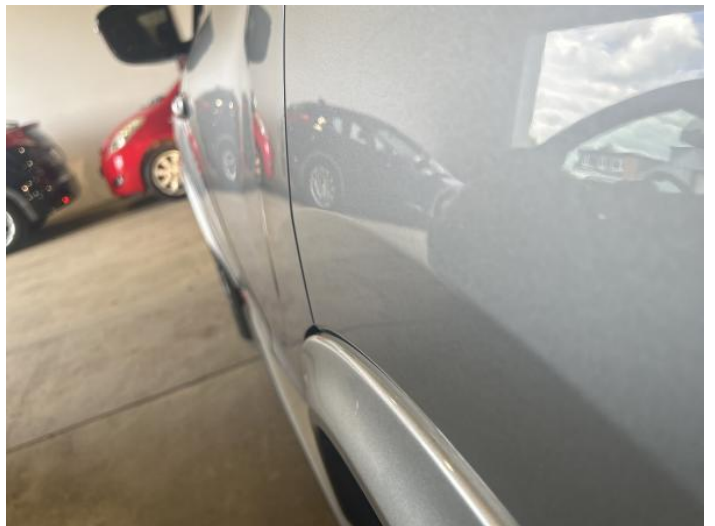
2: Qtr Panel nsr Dented 2 Or Less UpTo 10mm