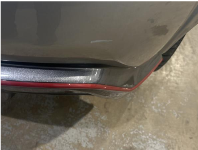
1: Bumper Rear Scratched Up To 25mm Thru Paint