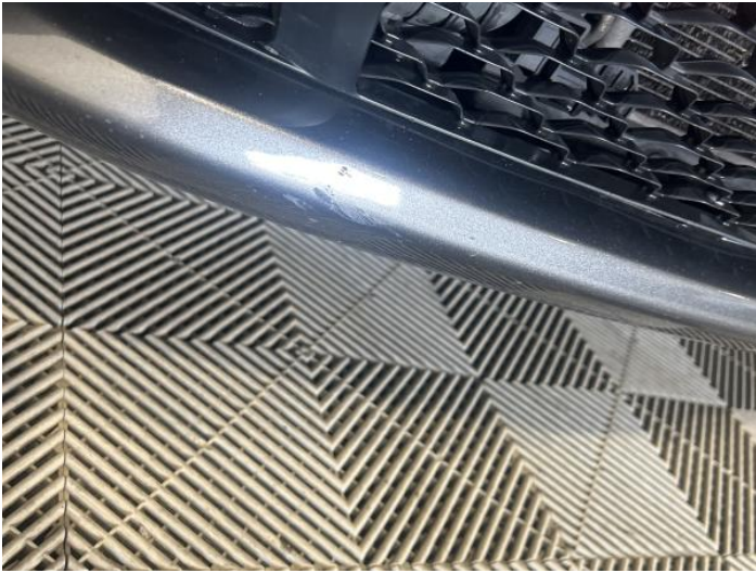
9: Bumper Front Moulding Scratched (Painted) UpTo 25mm Thru Paint