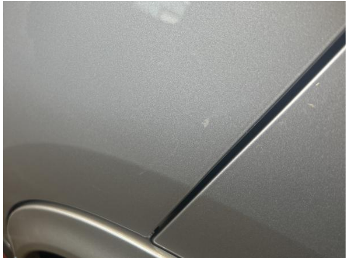
4: Door nsr Chipped 1 To 5