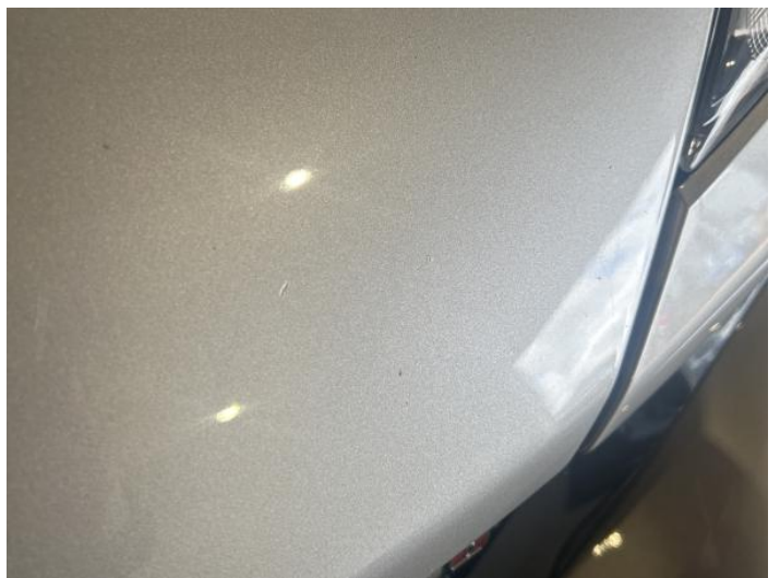
8: Bonnet Chipped 1 To 5