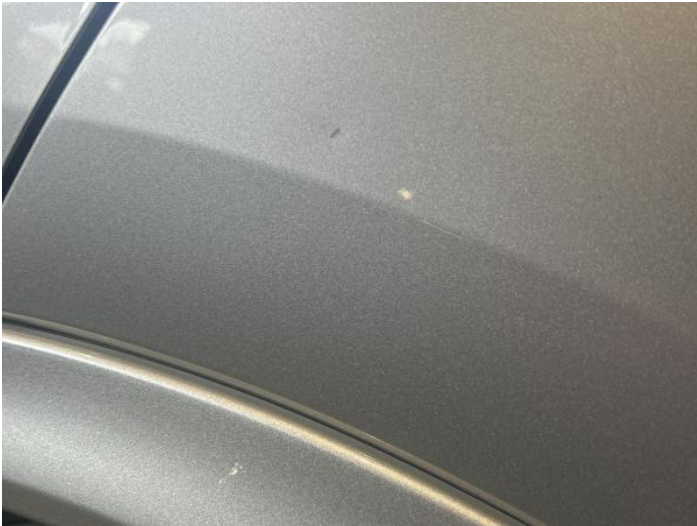
3: Qtr Panel nsr Chipped 1 To 5