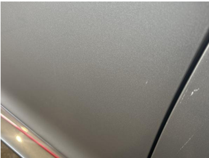
5: Door nsf Chipped 1 To 5