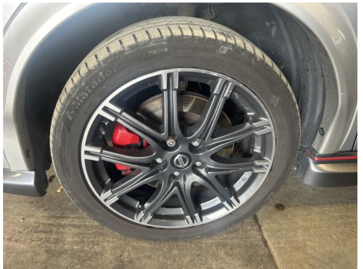
6: Wheel nsf Corroded Light