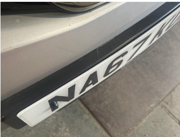
7: Bumper Front Chipped 1 To 5