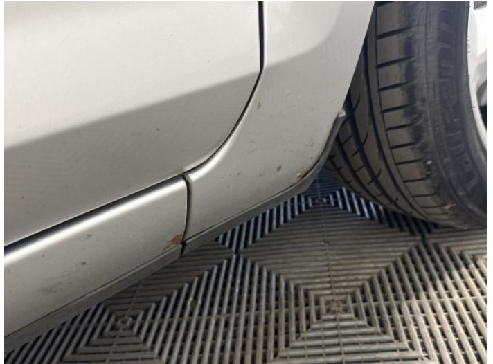
16: Sill os Rusted Over 5mm