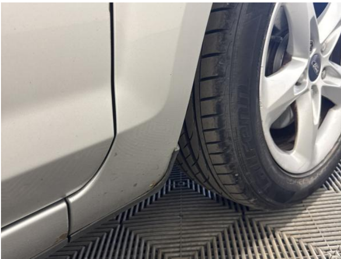
17: Wing osf Rusted Over 5mm