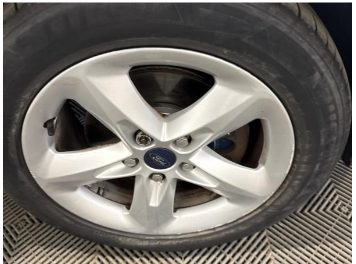
18: Wheel osf Scratched Over 50mm