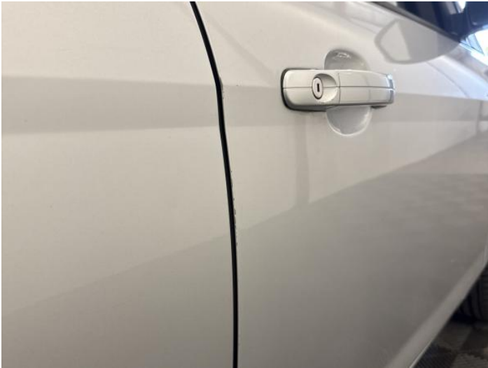
15: Door osf Chipped Edge Chip