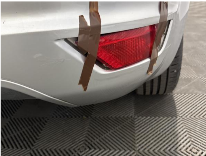
11: Bumper Reflector osr Broken Replace