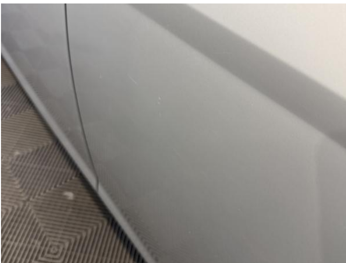
7: Door nsr Scratched Over 25mm Thru Paint