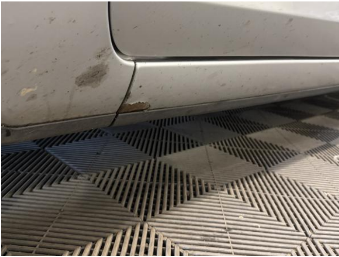
5: Sill ns Rusted Over 5mm