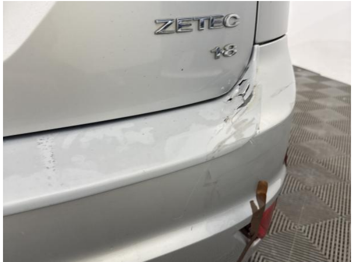
10: Bumper Rear Cracked Over 25mm