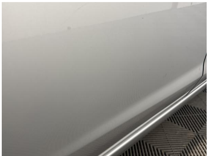
14: Door osr Scratched UpTo 25mm Thru Paint