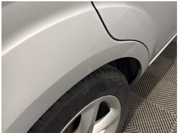
12: Qtr Panel osr Dented With Paint Damage