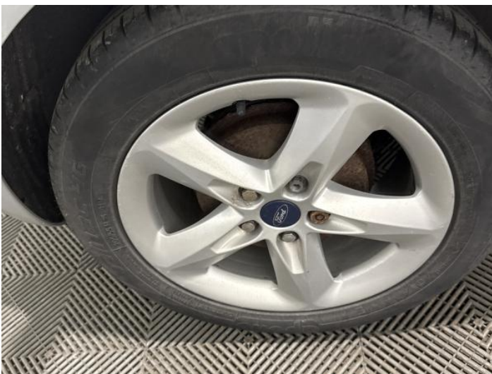
13: Wheel osr Scratched Over 50mm