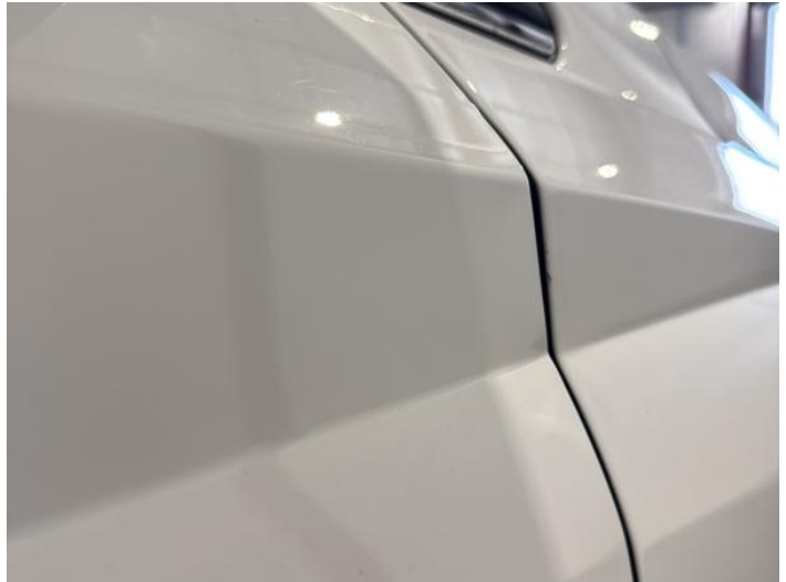
3: Bumper Rear Chipped 1 To 5