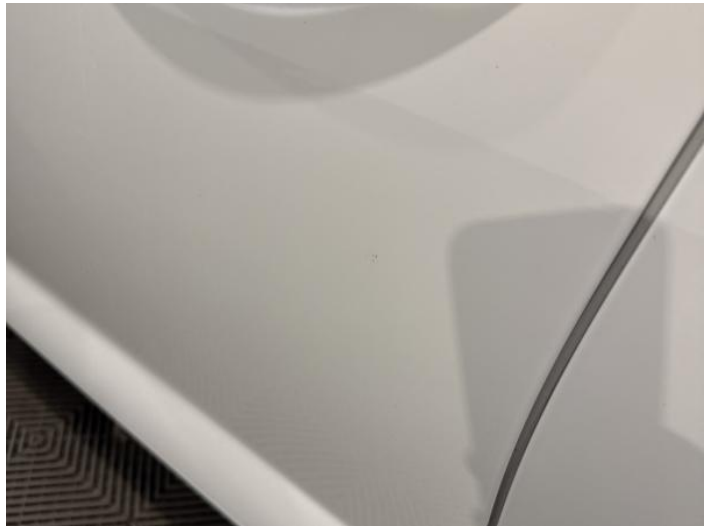
2: Door nsf Chipped 1 To 5