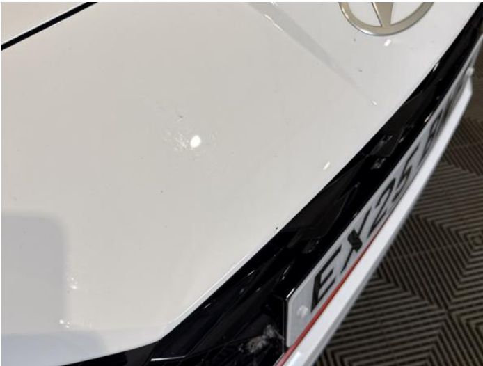
1: Bumper Front Chipped 1 To 5