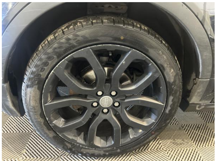
14: Wheel nsf Scratched Over 50mm