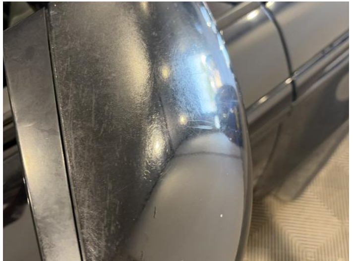
18: Door Moulding of Scratched (Painted) Over 25mm Thru Paint