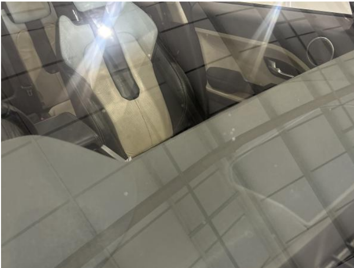
17: Screen Front Chipped Up To 10mm