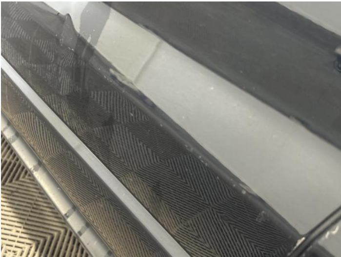
11: Door nsf Chipped Multiple Chips