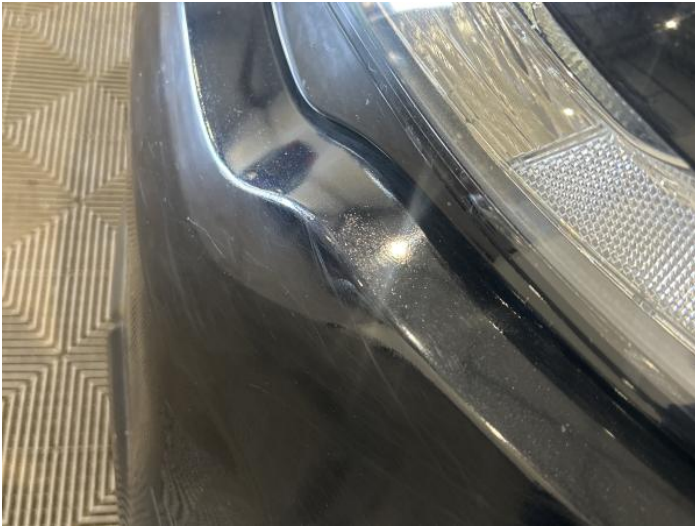
15: Bumper Front Poor Previous Repair Poor Paint