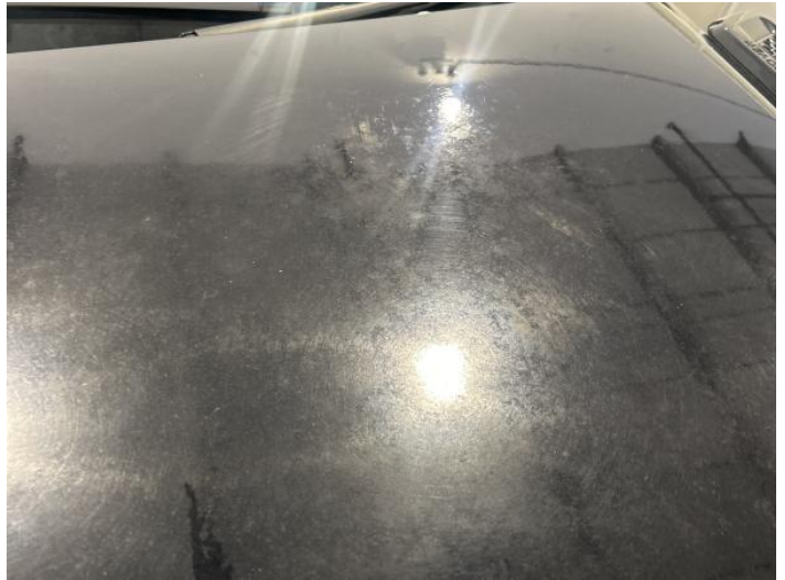
16: Bonnet Poor Previous Repair Poor Paint