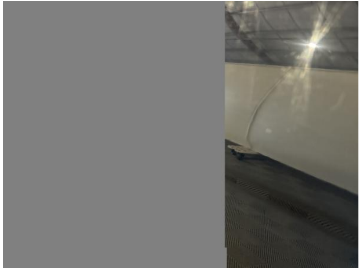
10: Door nsr Dented Over 30mm