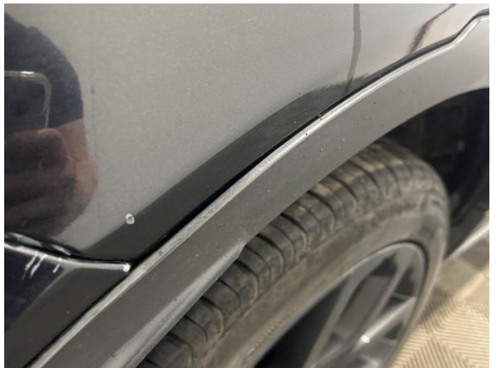
6: Qtr Panel osr Chipped 1 To 5