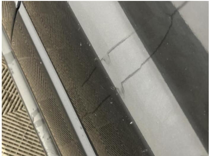
2: Door osf Chipped Multiple Chips