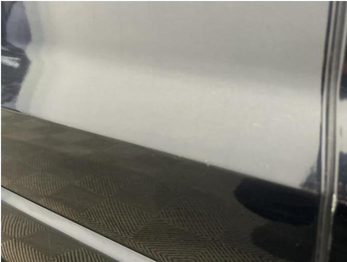
3: Door osr Chipped 1 To 5