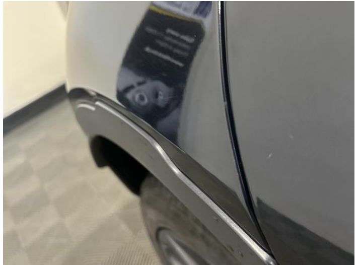
4: Qtr Panel osr Dented 2 Or Less UpTo 10mm