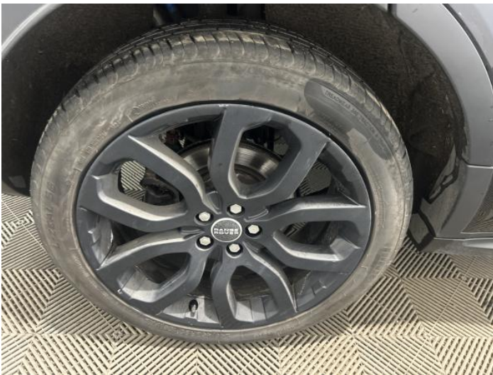
5: Wheel osr Scratched Up To 50mm