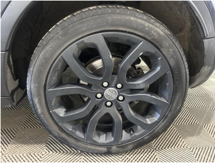
9: Wheel nsr Scratched Up To 50mm