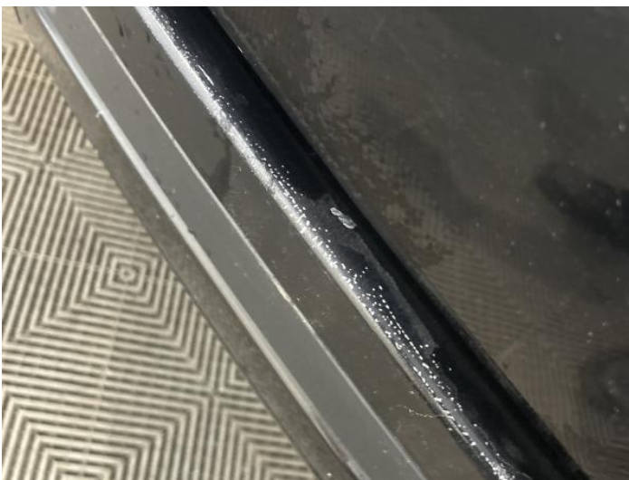
7: Bumper Rear Poor Previous Repair Paint Flake