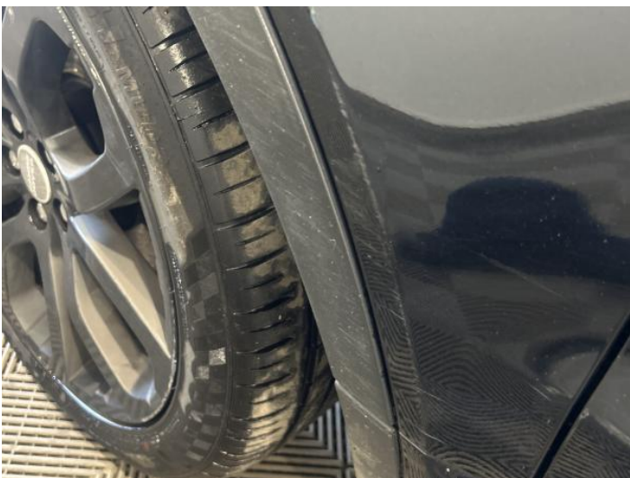
13: Wing nsf Scratched Over 25mm Thru Paint