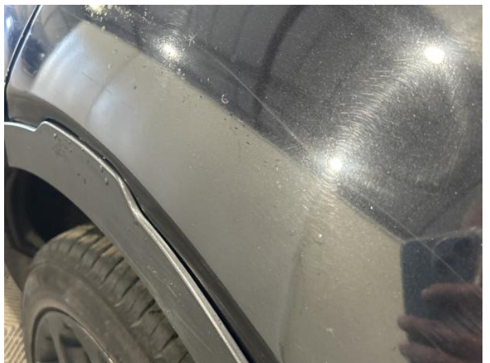
8: Qtr Panel nsr Poor Previous Repair Poor Paint