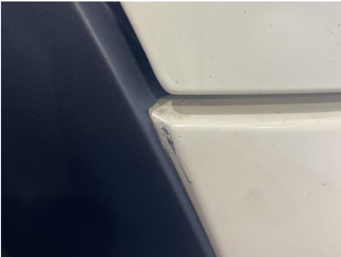
5: Bumper Front Scratched 25 to 100mm Thru Paint