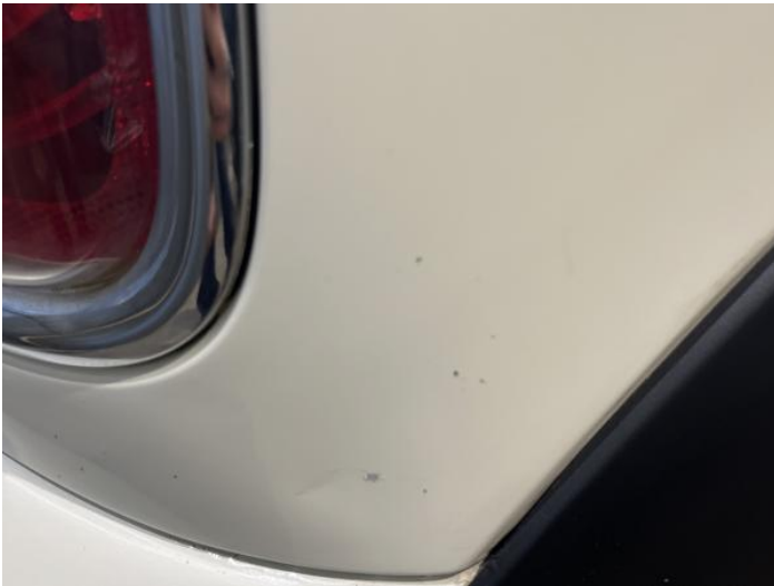
1: Qtr Panel osr Dented With Paint Damage