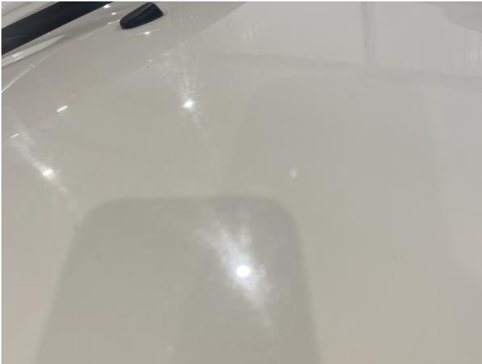
3: Bonnet Dented 2 Or Less UpTo 10mm