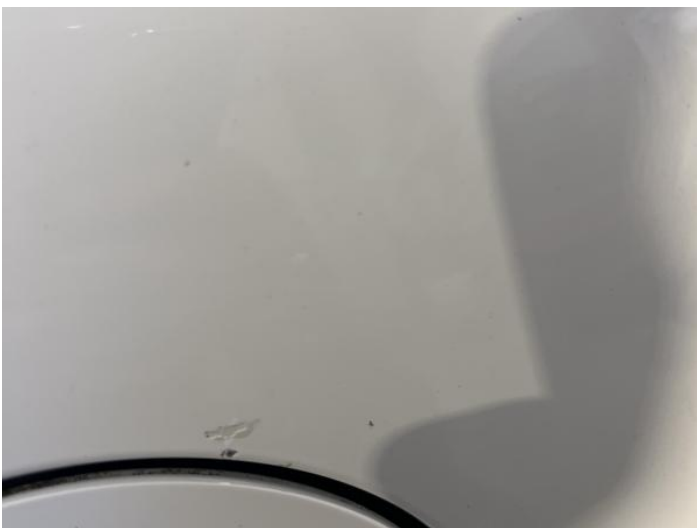
7: Qtr Panel nsr Scratched UpTo 25mm Thru Paint