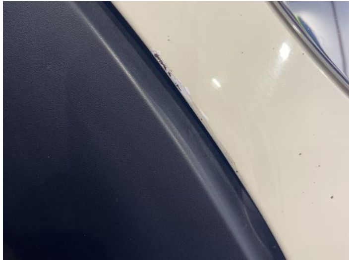
4: Bonnet Scratched Over 25mm Thru Paint