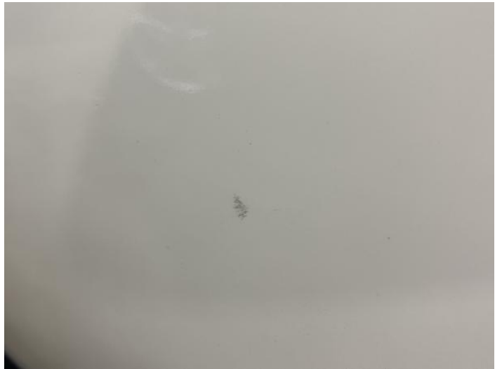
2: Door osf Scratched UpTo 25mm Not Thru Paint