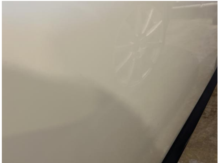
6: Door nsf Dented Between 10mm + 30mm