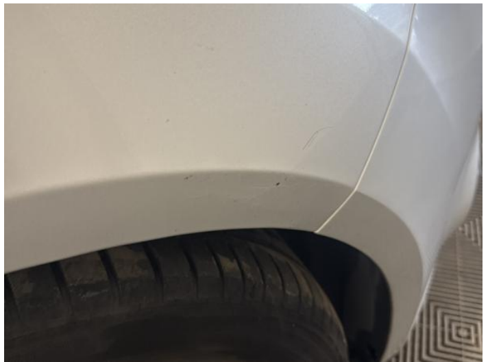
18: Wing osf Scratched Over 25mm Thru Paint