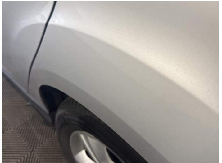
12: Qtr Panel osr Scratched UpTo 25mm Thru Paint