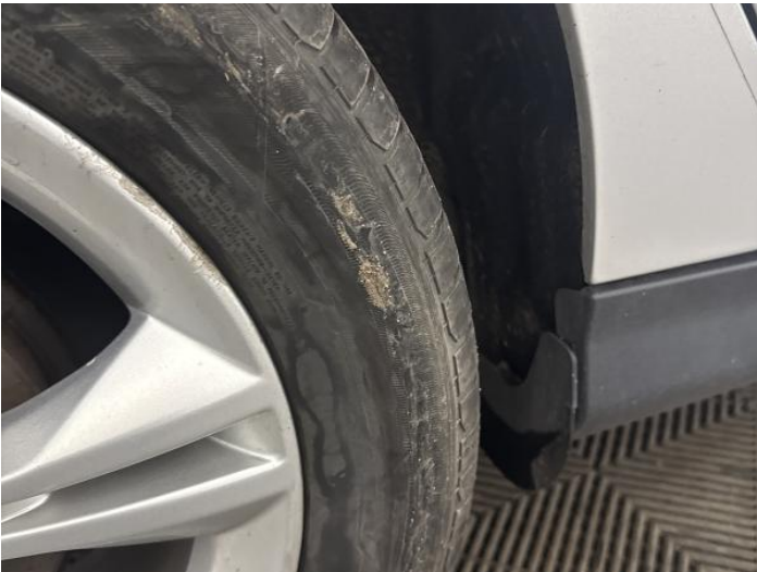
1: Tyre osr Damaged Replace