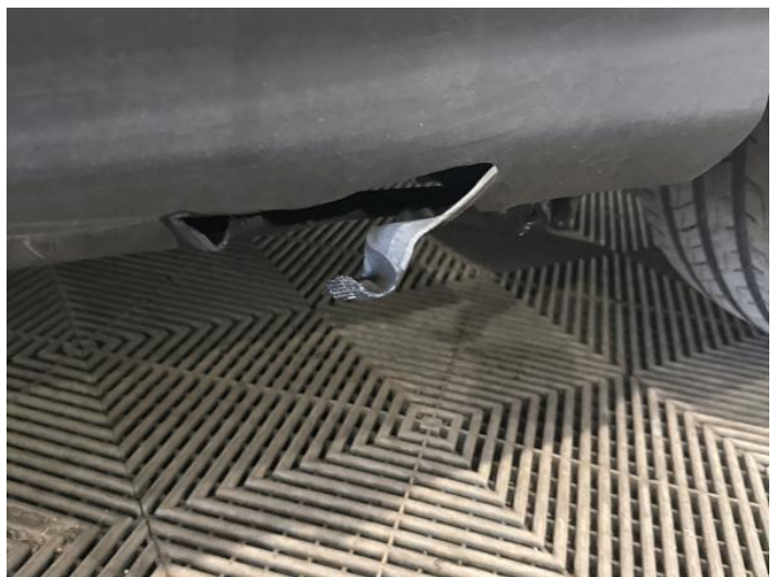
8: Sill Panel Trim ns Broken Replace