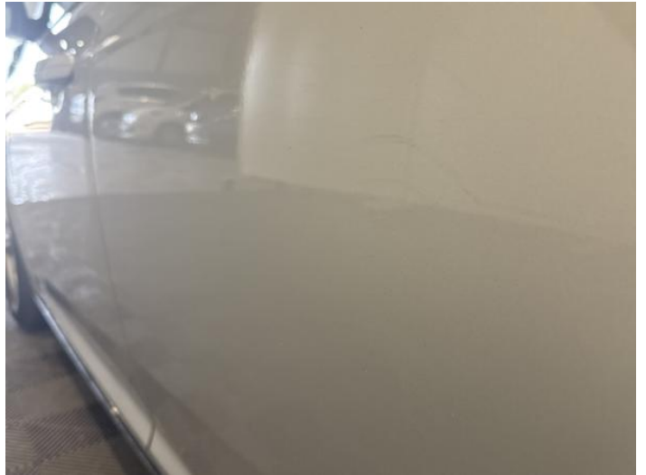
10: Door nsr Dented Between 10mm + 30mm