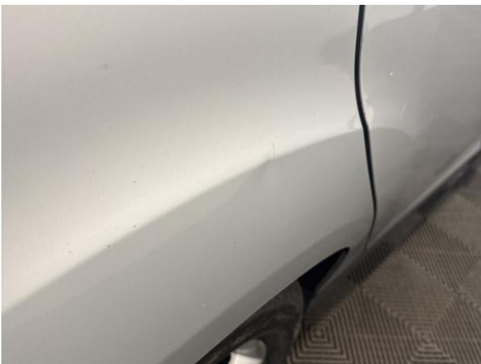
13: Qtr Panel osr Dented Between 10mm + 30mm