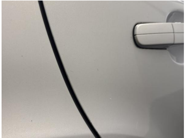
16: Door osr Scratched Over 25mm Thru Paint