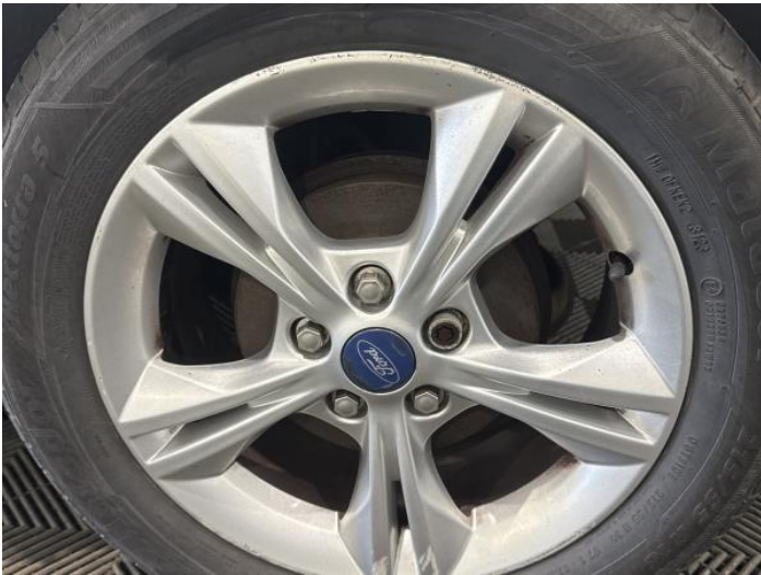
11: Wheel osr Scratched Over 50mm