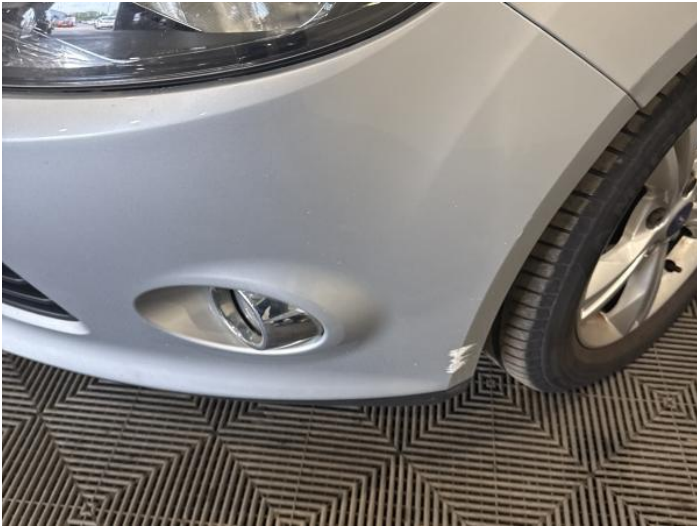
3: Bumper Front Scratched 25 to 100mm Thru Paint