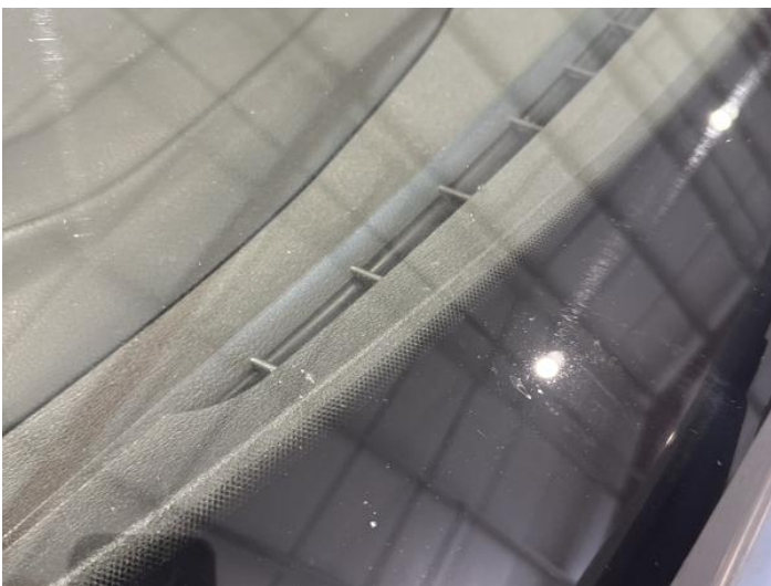
19: Screen Front Chipped UpTo 10mm