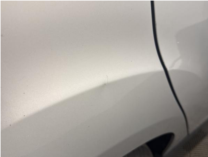
15: Qtr Panel osr Scratched Over 25mm Thru Paint