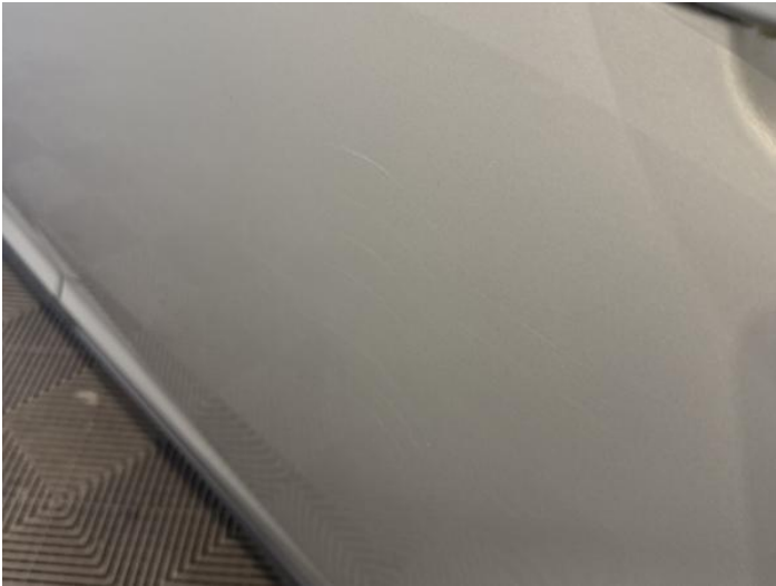
9: Door nsr Scratched Over 25mm Thru Paint