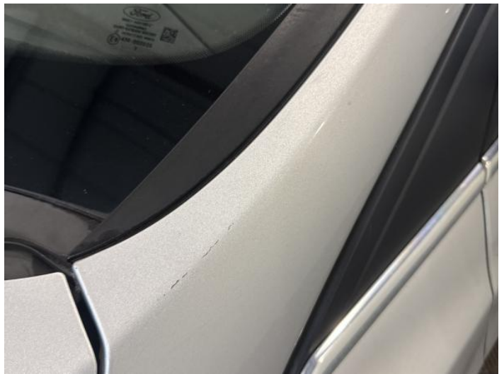
6: A Post ns Scratched UpTo 25mm Thru Paint