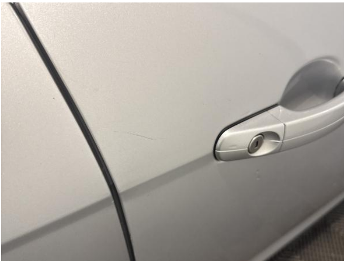
17: Door osf Scratched UpTo 25mm Thru Paint