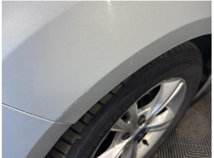
4: Wing nsf Scratched Over 25mm Thru Paint