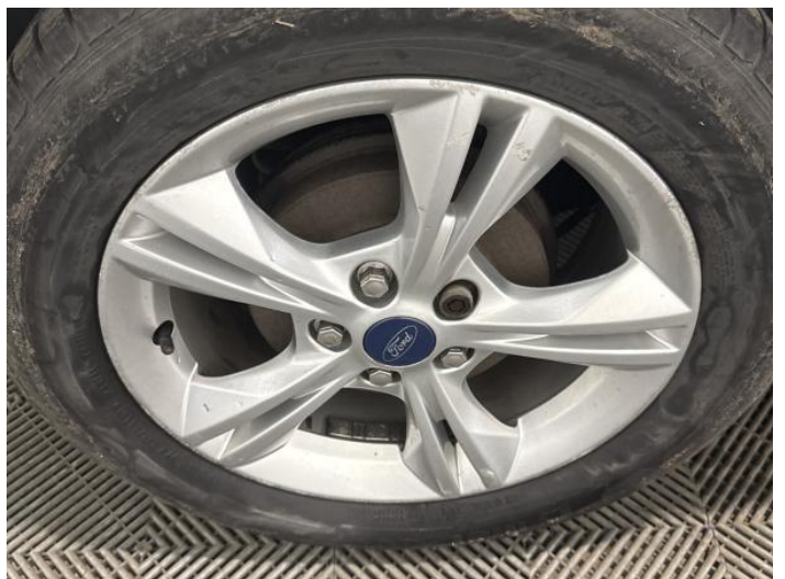
14: Wheel osr Scratched Over 50mm