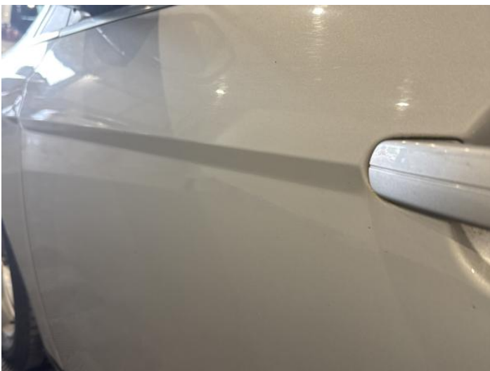
7: Door nsf Dented Between 10mm + 30mm