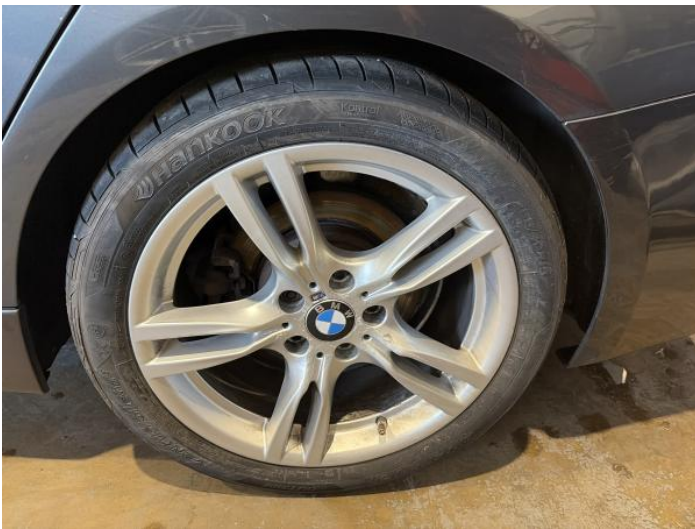
5: Wheel nsr Corroded Light