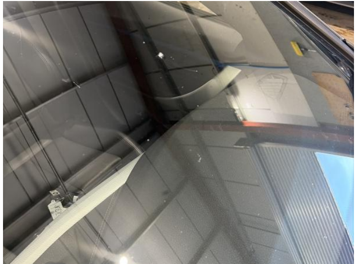
10: Screen Front Chipped UpTo 10mm