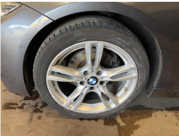
7: Wheel nsf Corroded Light