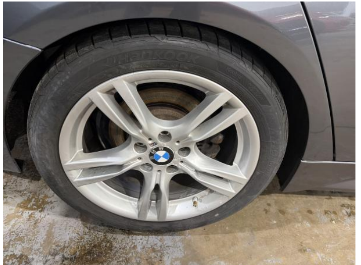
2: Wheel osr Corroded Light