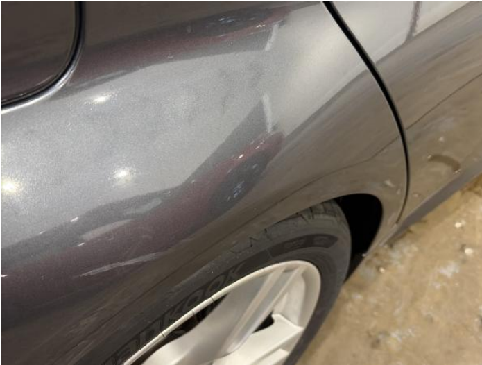
3: Qtr Panel osr Poor Previous Repair Poor Paint