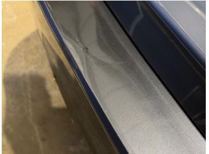
4: Bumper Rear Dented With Paint Damage