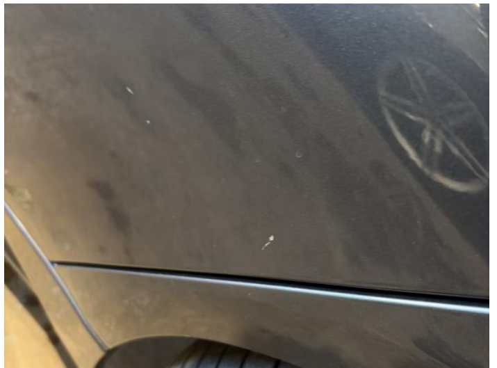
6: Door nsr Chipped 1 To 5