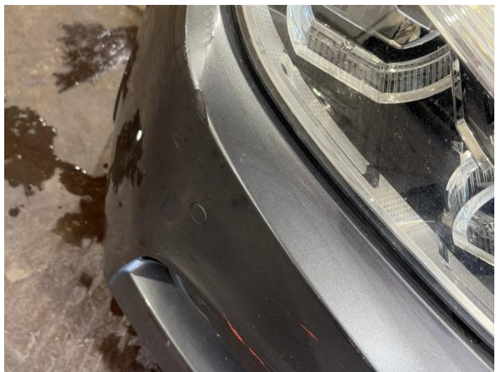
8: Bumper Front Scratched 25 to 100mm Thru Paint