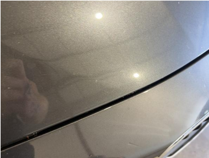
9: Bonnet Chipped 1 To 5