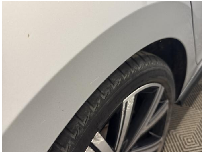
12: Qtr Panel osf Scratched UpTo 25mm Thru Paint