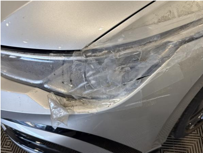
3: Headlamp nsf Broken Replace