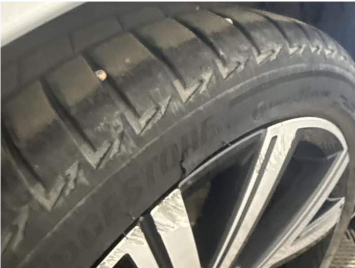
1: Tyre osr Damaged Replace