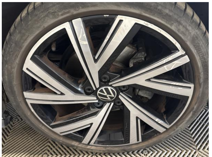
14: Wheel osf Scratched Over 50mm