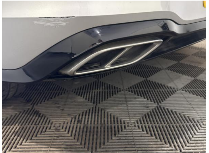
10: Bumper Rear Moulding Scratched (Painted) Over 25mm Thru Paint