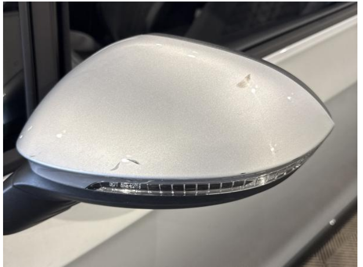
6: Door Mirror Assy nsf Scratched (Painted) Over 25mm Thru Paint