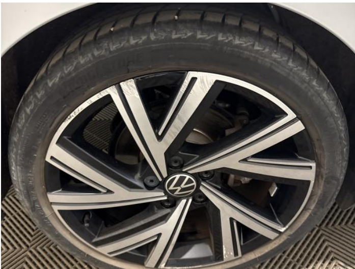
11: Wheel osf Scratched Over 50mm