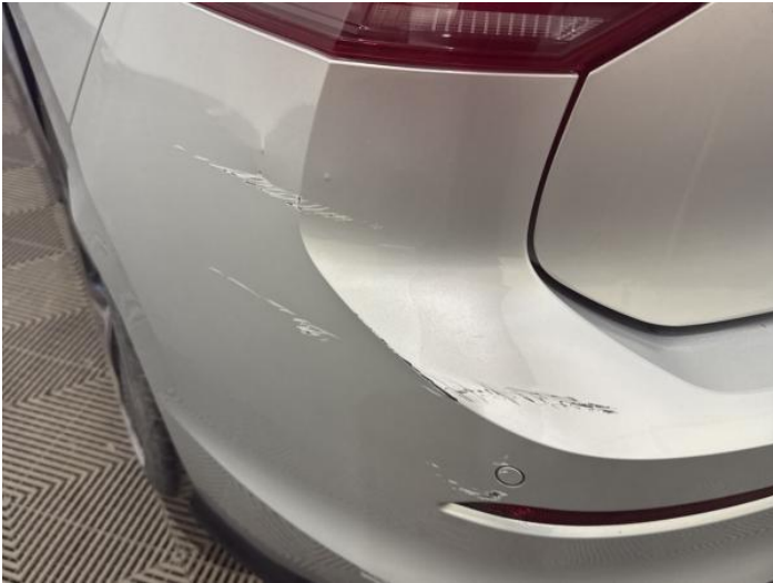
9: Bumper Rear Scratched 25 to 100mm Thru Paint