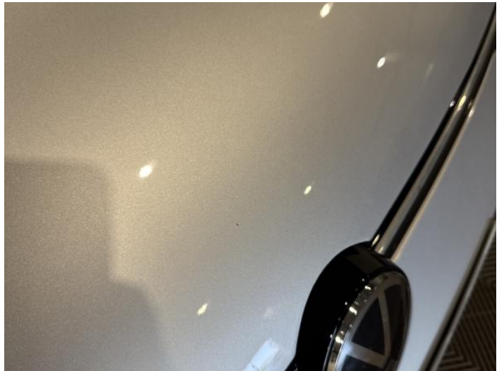
2: Bonnet Chipped 1 To 5