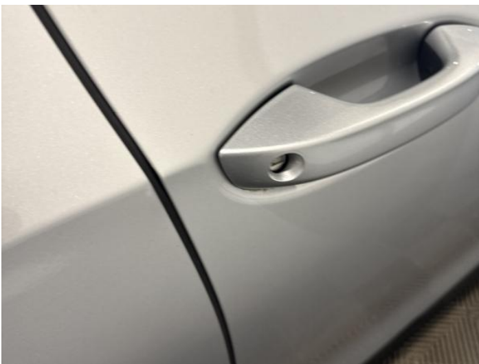
13: Door osf Chipped Edge Chip