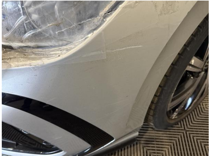
4: Bumper Front Scratched 25 to 100mm Thru Paint