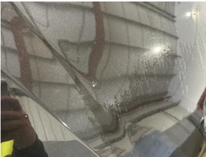
17: Bonnet Chipped 1 To 5