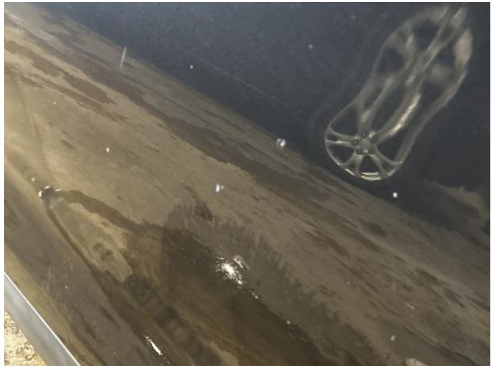
2: Door osf Chipped 1 To 5