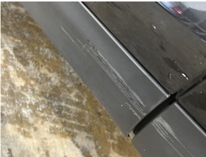
11: Door Moulding nsf Scuffed (Unpainted) Over 100mm