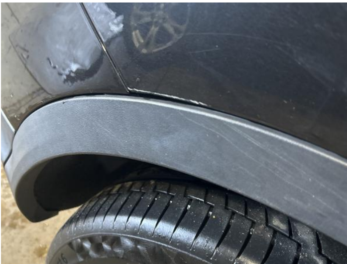
5: Qtr Panel osr Scratched Over 25mm Thru Paint