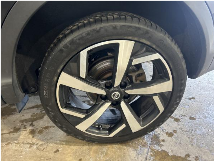
9: Wheel nsf Corroded Light