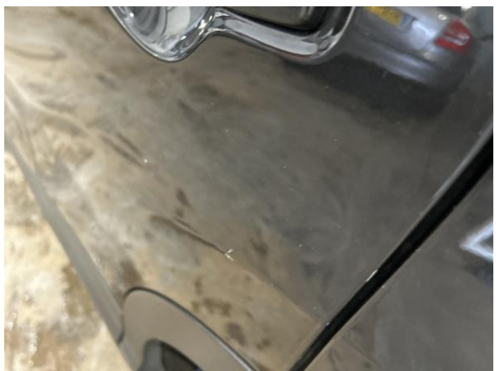
8: Door nsr Dented Over 30mm