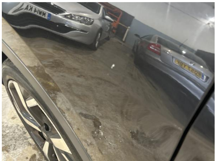
14: Wing nsf Chipped 1 To 5