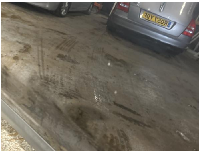
13: Door nsf Chipped 1 To 5