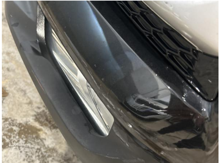
16: Bumper Front Scratched 25 to 100mm Thru Paint