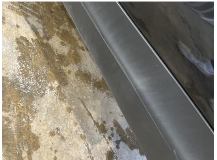
12: Door Moulding nsf Scuffed (Unpainted) Over 100mm