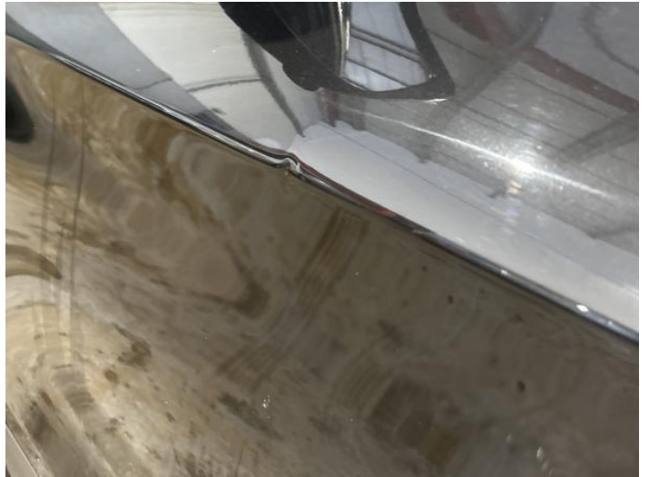
10: Door nsf Dented Between 10mm + 30mm