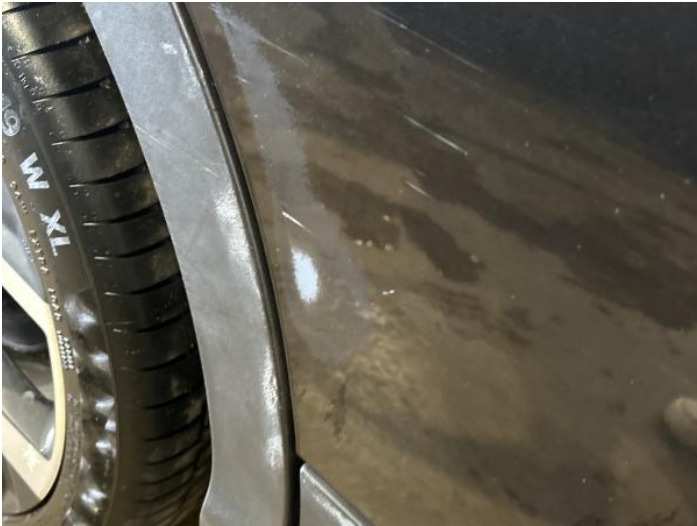
3: Door osr Poor Previous Repair Poor Paint