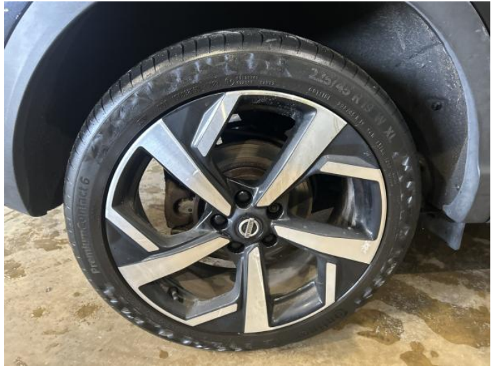
4: Wheel osr Corroded Light