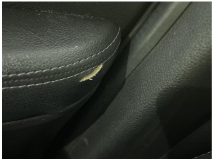
18: Door Pad osf Torn Between 3mm + 10mm