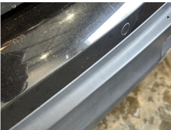
7: Bumper Rear Chipped Multiple Chips