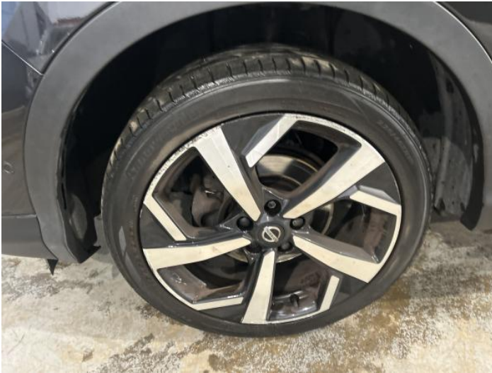
15: Wheel nsf Scratched Over 50mm