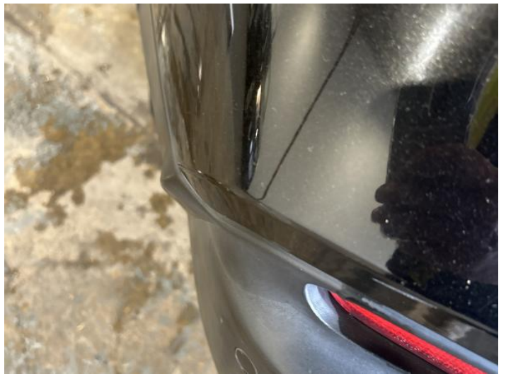
6: Bumper Rear Scratched 25 to 100mm Thru Paint