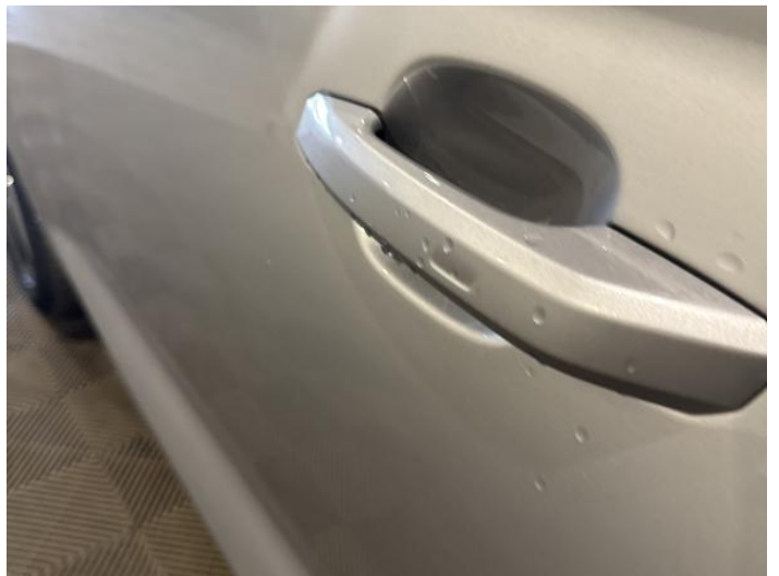
6: Door nsf Dented Between 10mm + 30mm