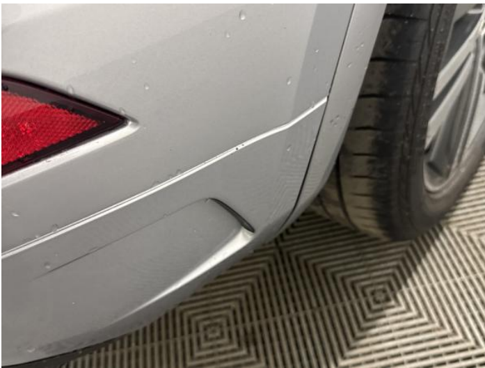
11: Bumper Rear Chipped 1 To 5