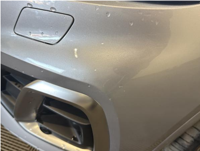
3: Bumper Front Chipped 1 To 5