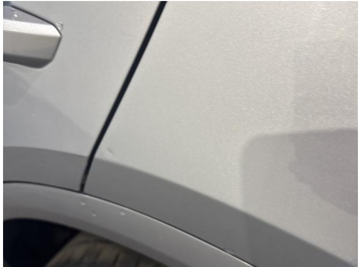
10: Qtr Panel nsr Scratched UpTo 25mm Thru Paint