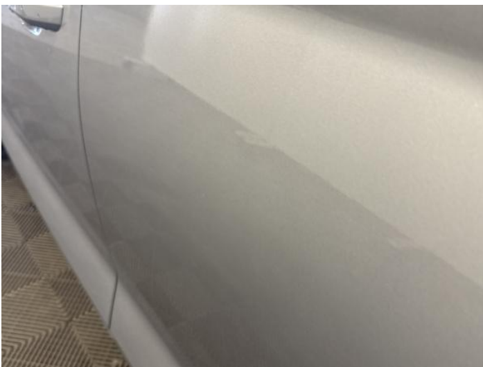
7: Door nsr Dented Between 10mm + 30mm