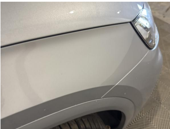
13: Wing osf Chipped 1 To 5