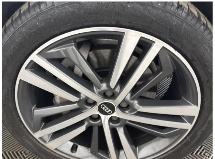
12: Wheel osf Scratched Up To 50mm