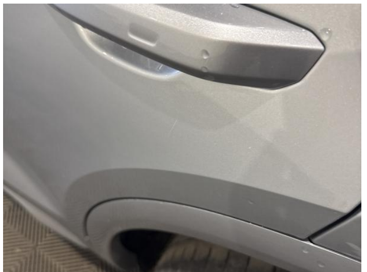
8: Door nsr Scratched Up To 25mm Thru Paint