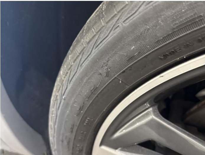
1: Tyre nsr Damaged Replace