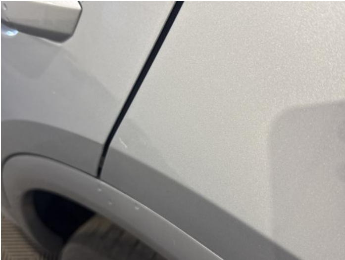
9: Qtr Panel nsr Dented Between 10mm + 30mm