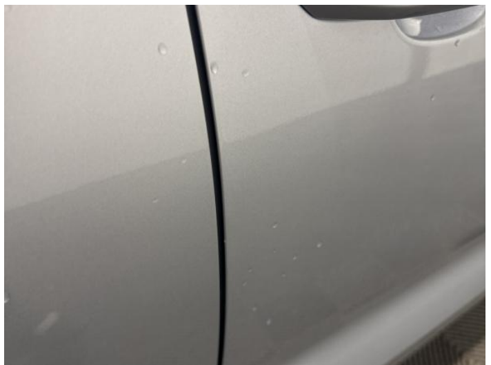
14: Door osf Chipped Edge Chip