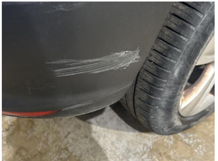
6: Bumper Rear Moulding Scuffed (Unpainted) UpTo 100mm