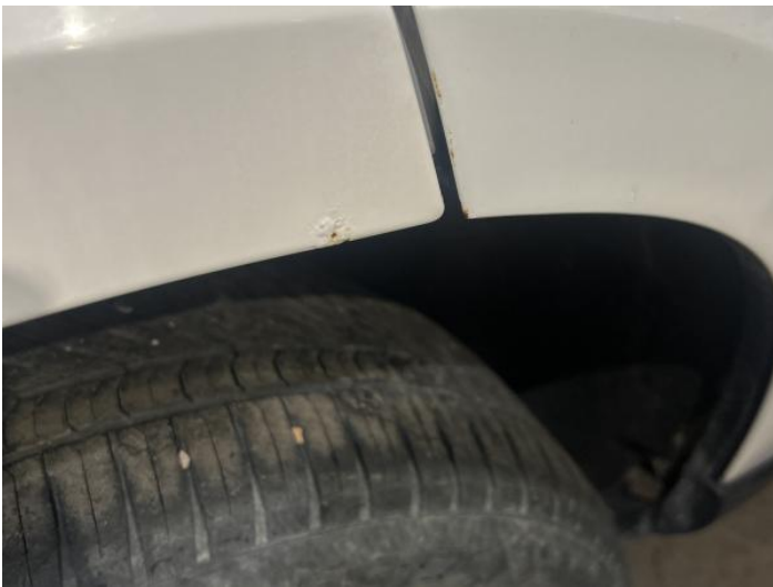
5: Qtr Panel osr Rusted UpTo 5mm