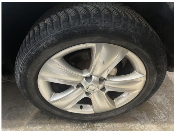
8: Wheel nsr Scratched Up To 50mm