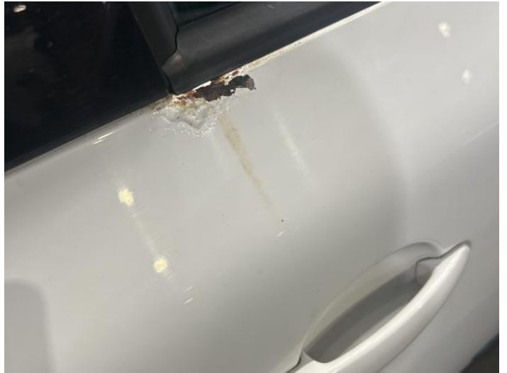
4: Door osr Rusted Over 5mm