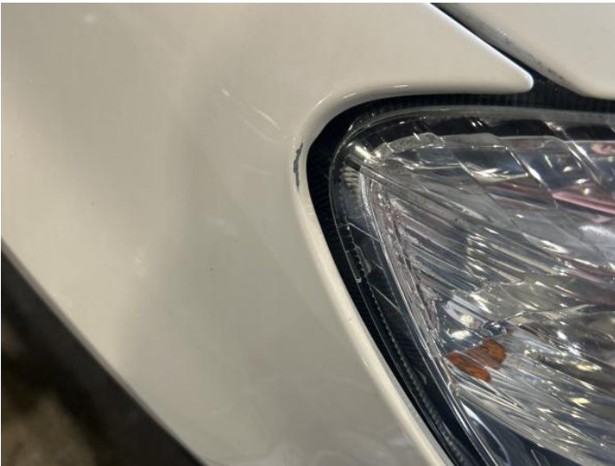
1: Wing of Scratched Up To 25mm Thru Paint