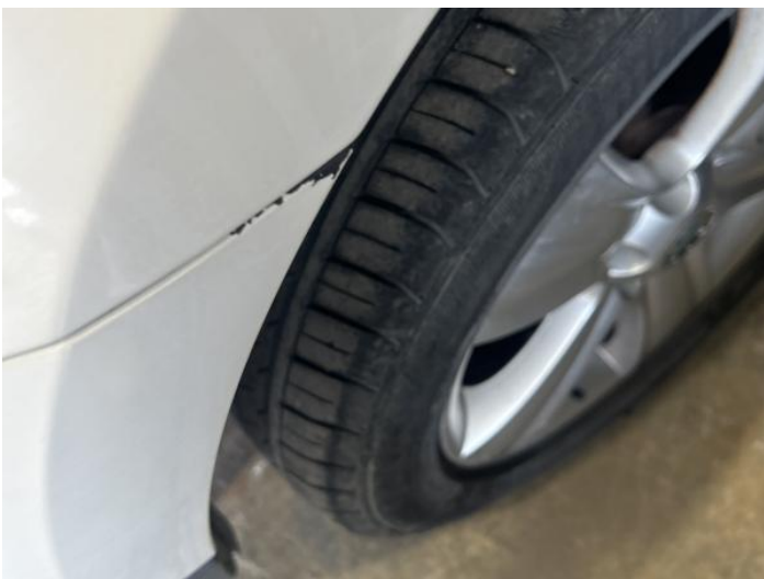
13: Bumper Front Scratched Up To 25mm Thru Paint