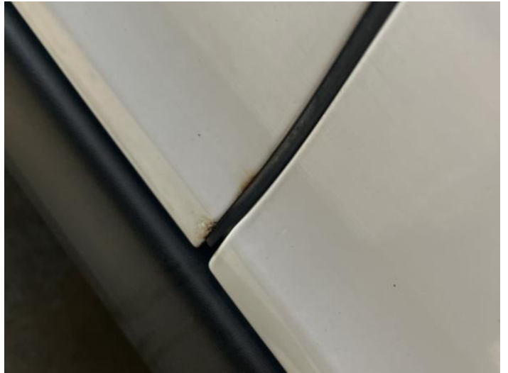
10: Door nsf Rusted Up To 5mm