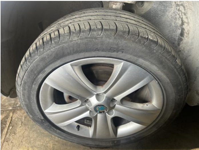
11: Wheel nsf Scratched Up To 50mm