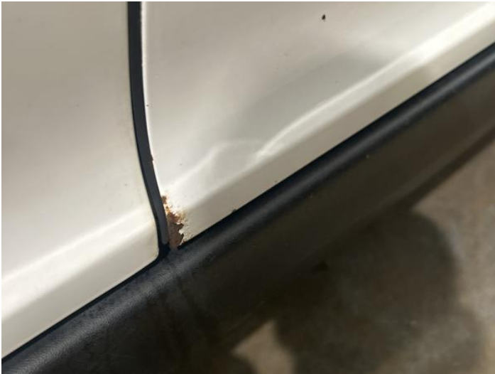
3: Door osf Rusted UpTo 5mm