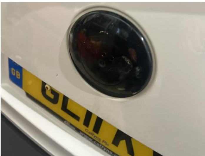
7: Badgedecal Rear Missing Replace