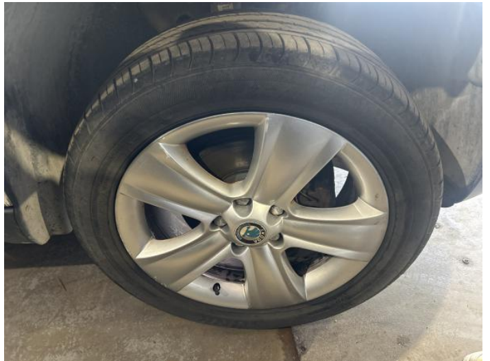
2: Wheel of Scratched Over 50mm