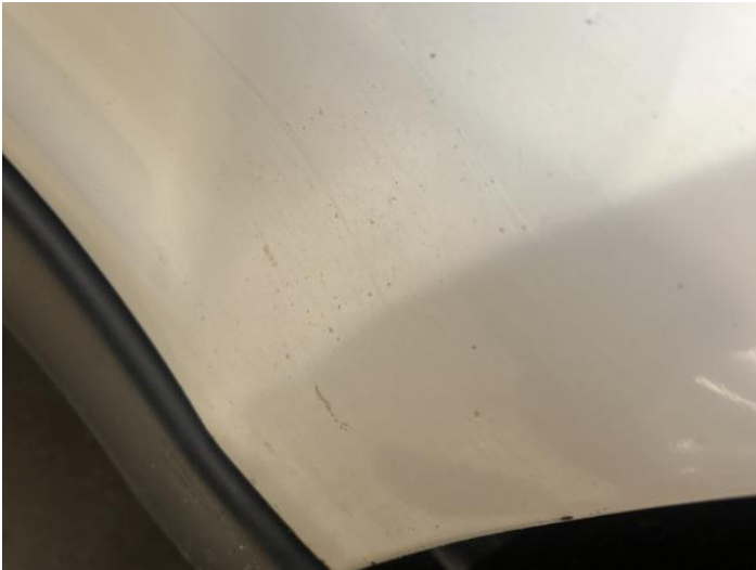
9: Door nsr Chipped Multiple Chips