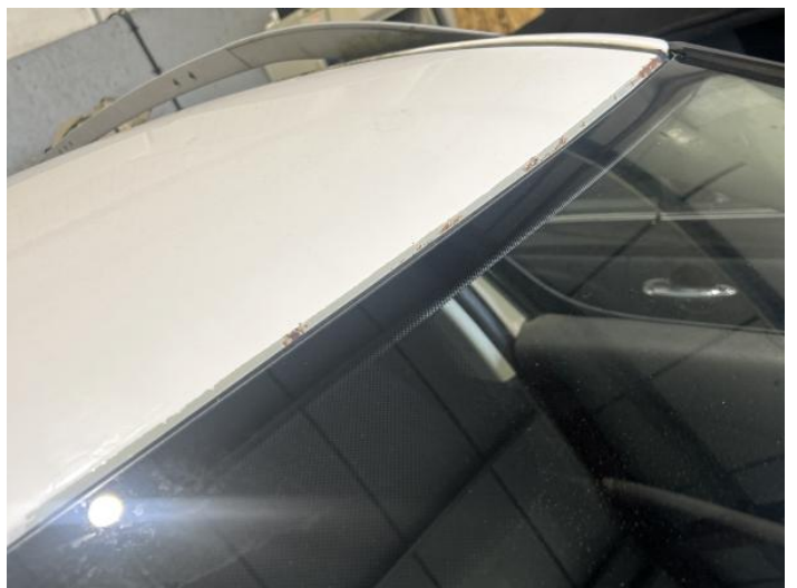
14: Roof Poor Previous Repair Paint Flake