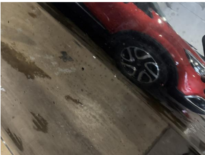
7: Door nsr Chipped 1 To 5