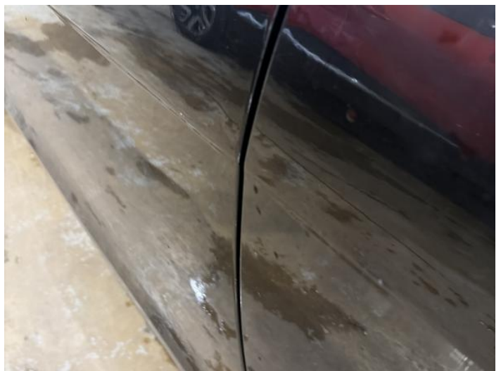
8: Door nsf Chipped Edge Chip