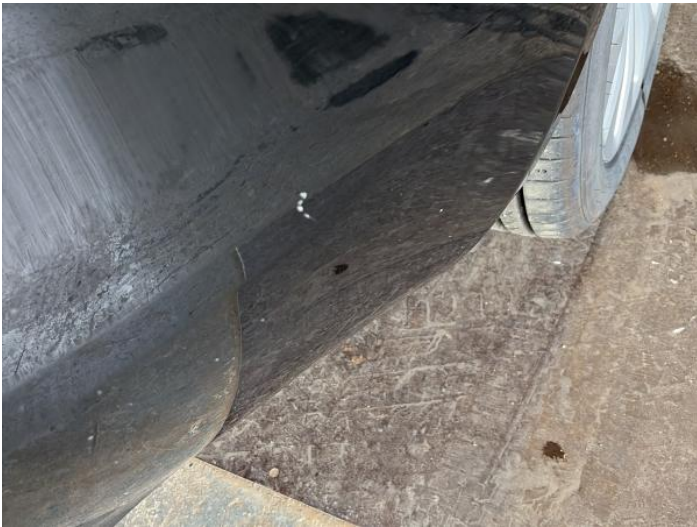
5: Bumper Rear Chipped Multiple Chips