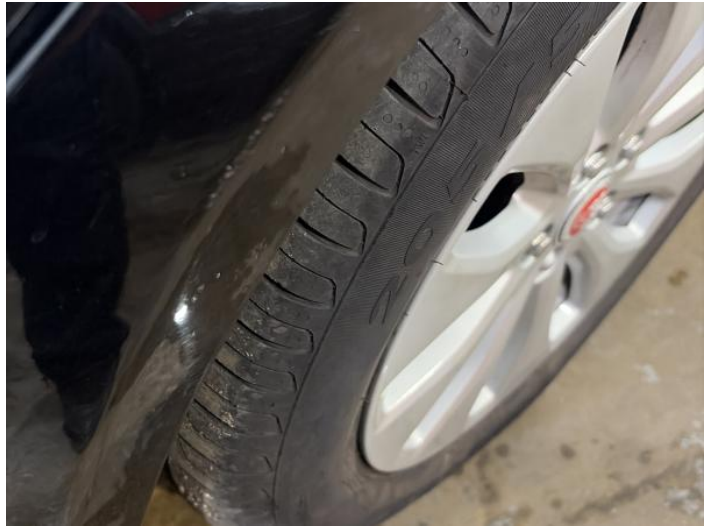
10: Bumper Front Scratched UpTo 25mm Thru Paint