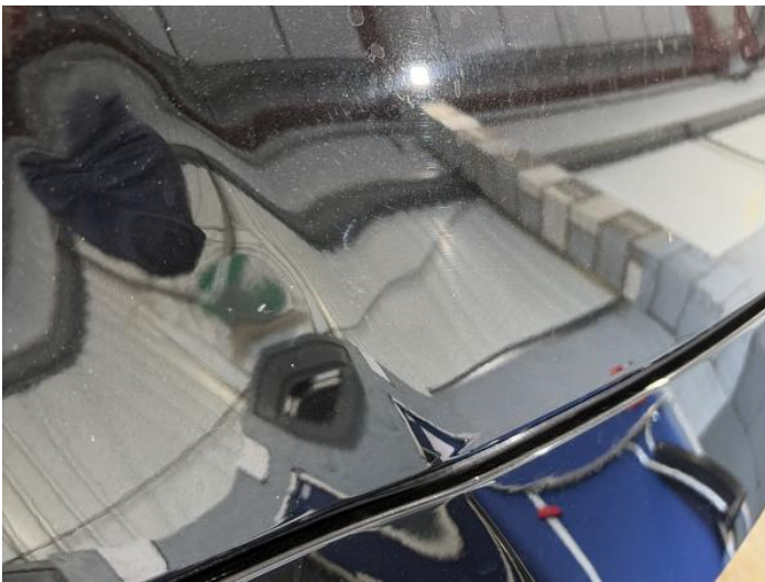
11: Bonnet Chipped 1 To 5