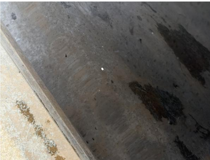
1: Door osf Chipped 1 To 5