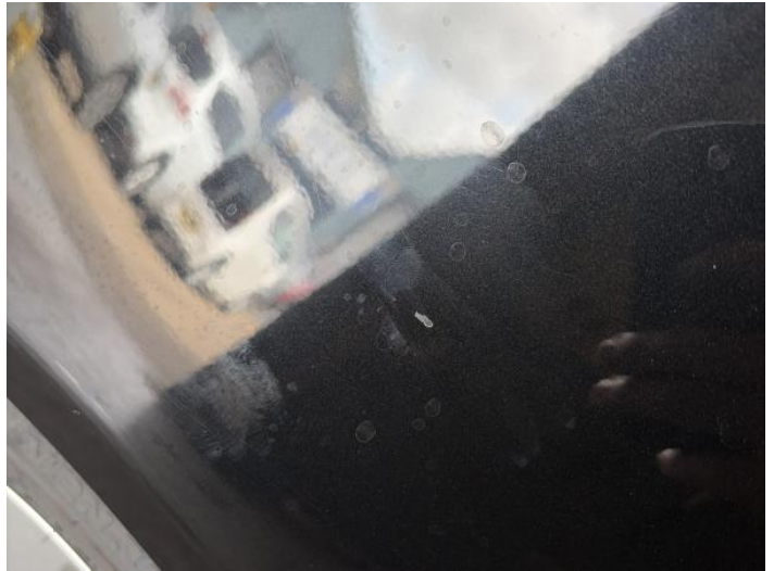
4: Qtr Panel osr Chipped 1 To 5