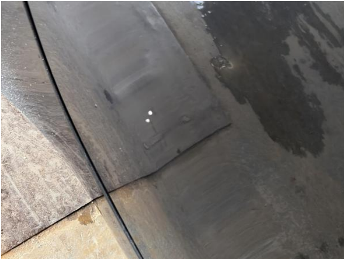
3: Door osr Chipped 1 To 5