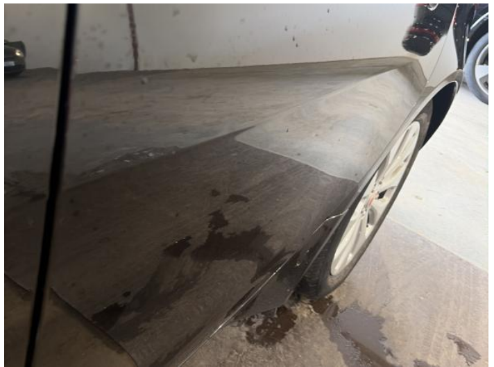
12: Door nsr Dented Over 2 UpTo 10mm