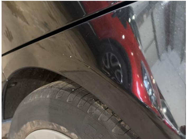
6: Qtr Panel nsr Chipped 1 To 5