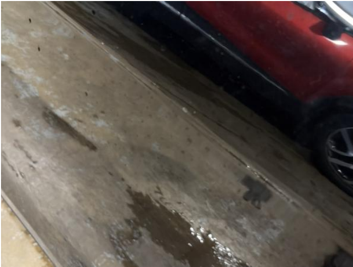
9: Door nsf Chipped 1 To 5