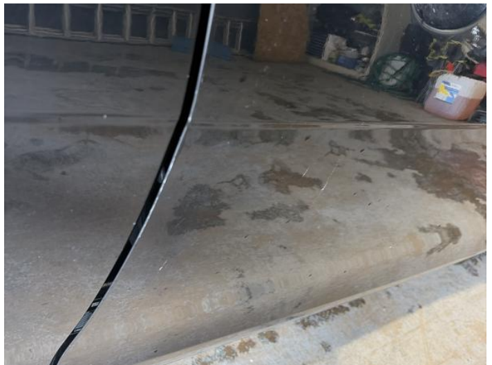
2: Door osf Chipped Edge Chip