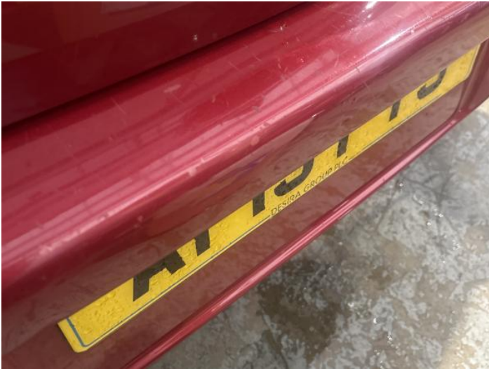
9: Bumper Rear Chipped Multiple Chips