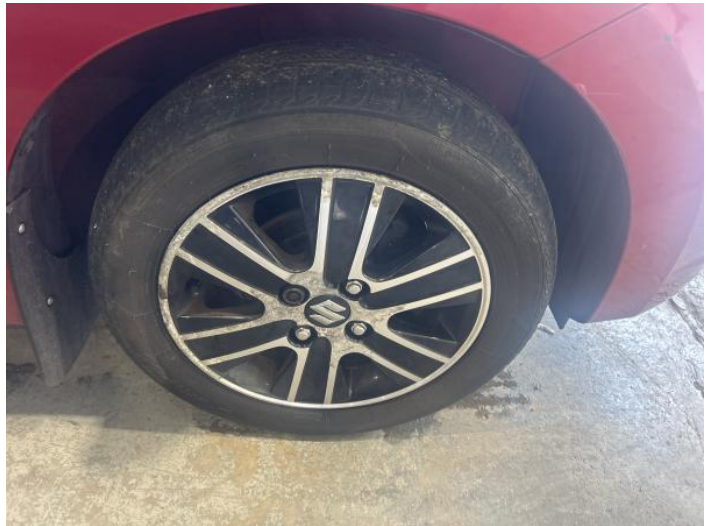
2: Wheel of Corroded Light