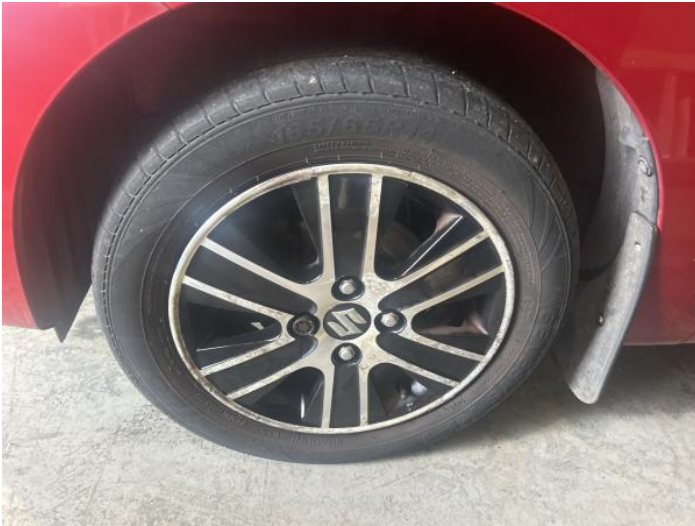
15: Wheel nsf Corroded Light