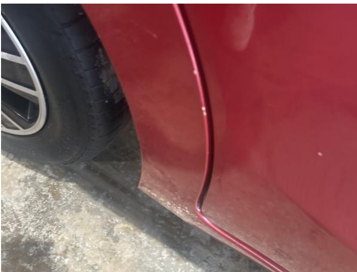
7: Qtr Panel osr Chipped Edge Chip