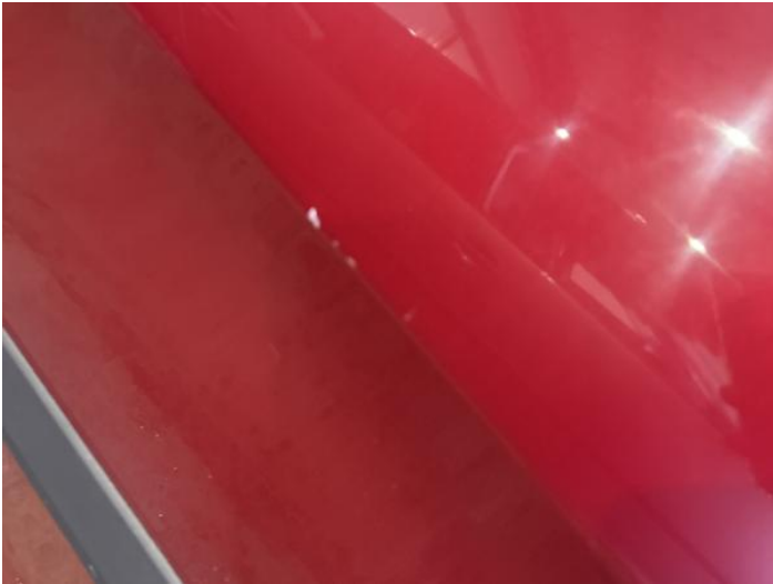
3: Door osf Chipped 1 To 5