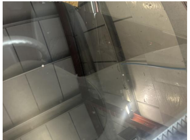
18: Screen Front Chipped UpTo 10mm