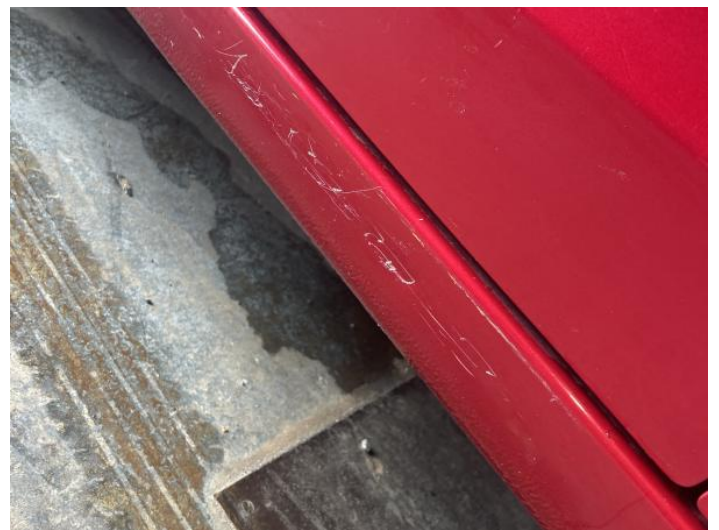
20: Sill ns Scratched Over 25mm Thru Paint