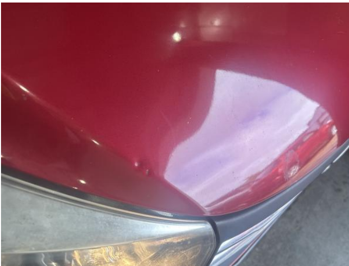
17: Bonnet Dented With Paint Damage