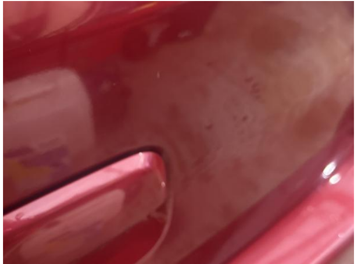
10: Tailgate Chipped 1 To 5