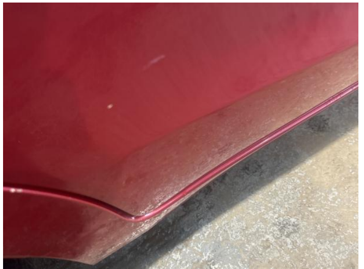
6: Door osr Chipped 1 To 5