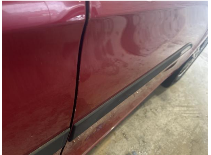
4: Door osf Chipped Edge Chip