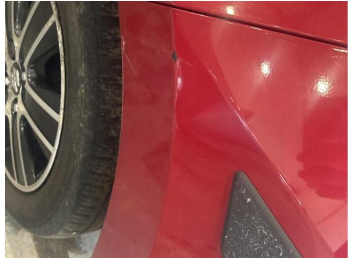
16: Bumper Front Scratched 25 to 100mm Thru Paint