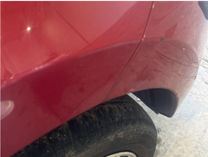
1: Wing of Scratched Over 25mm Thru Paint