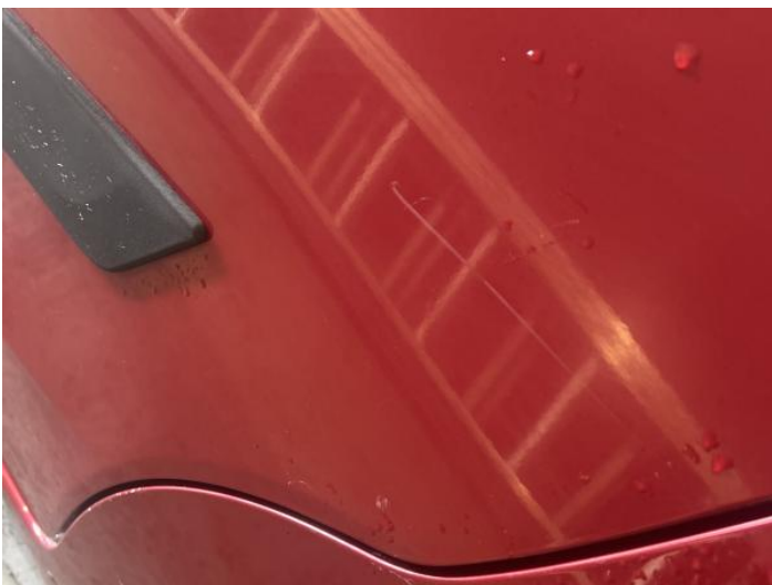
13: Door nsr Scratched Over 25mm Thru Paint