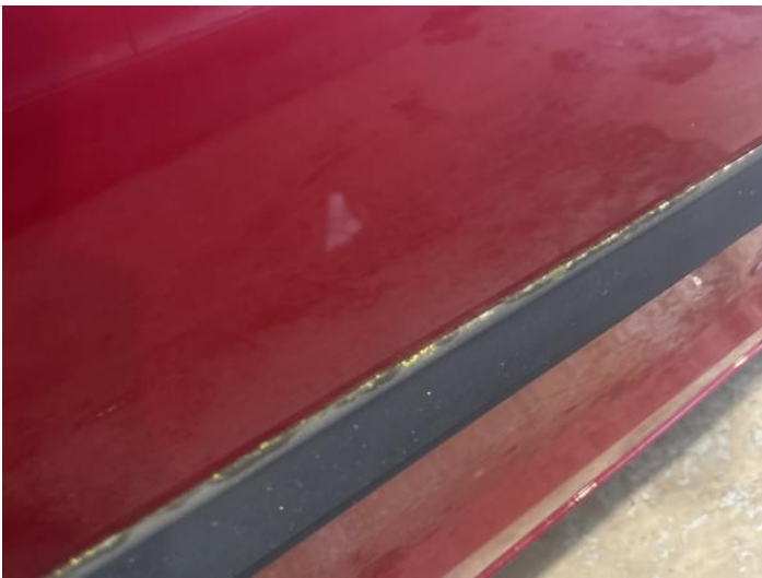
5: Door osr Scratched UpTo 25mm Thru Paint