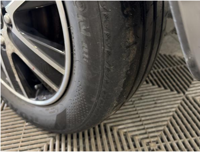
21: Tyre nsr Damaged Replace