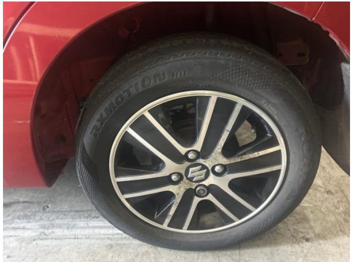
12: Wheel nsr Corroded Light