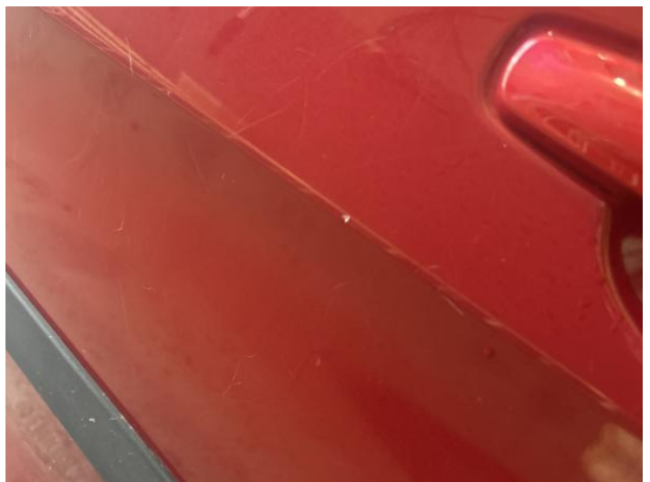
14: Door nsf Chipped 1 To 5