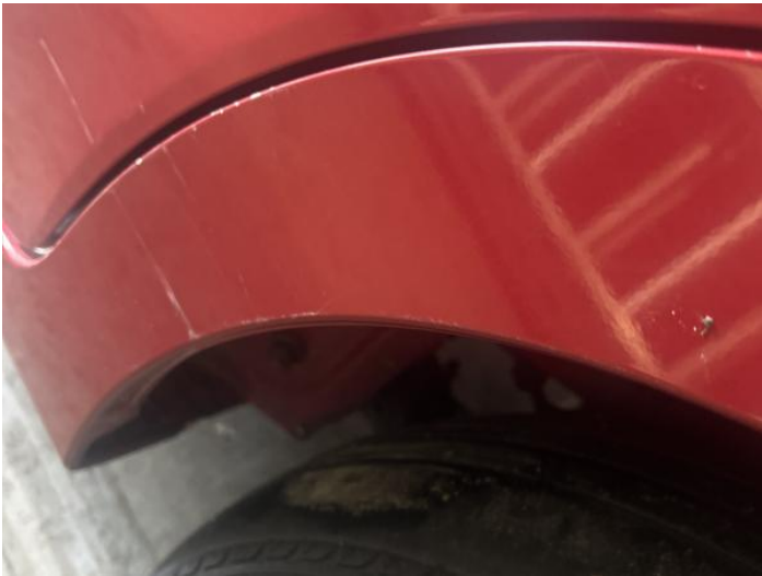
11: Qtr Panel nsr Scratched Over 25mm Thru Paint