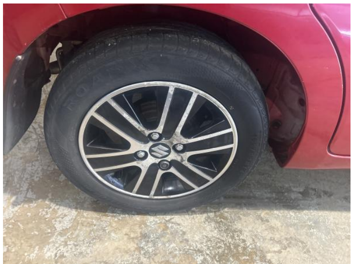
8: Wheel osr Corroded Light