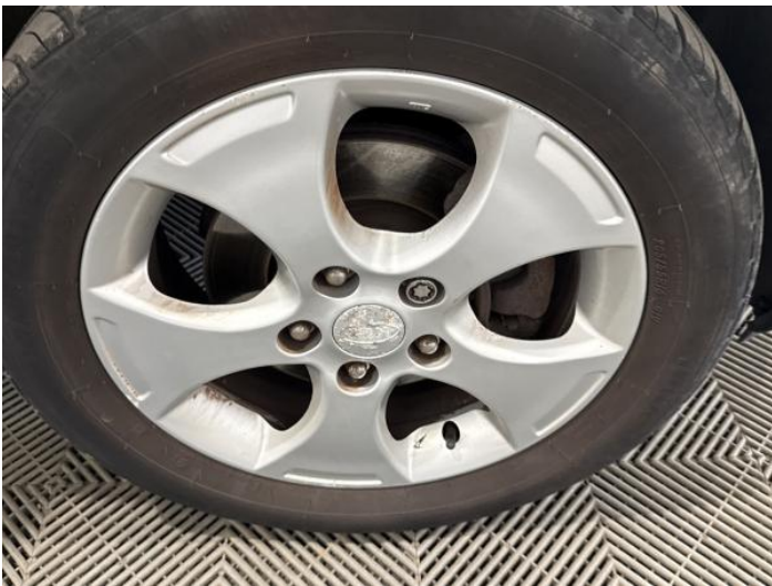
17: Wheel osf Scratched Over 50mm