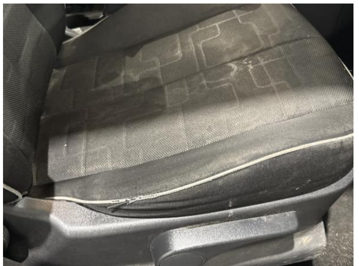
20: Seat Base Cover osf Scuffed Over 25mm