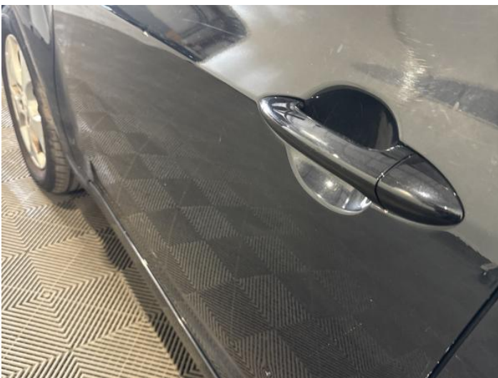
7: Door nsf Dented With Paint Damage