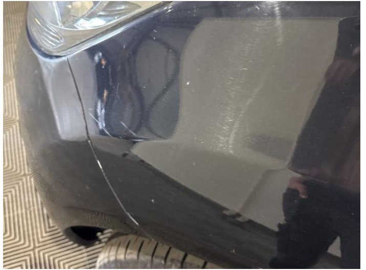
4: Wing nsf Scratched Over 25mm Thru Paint