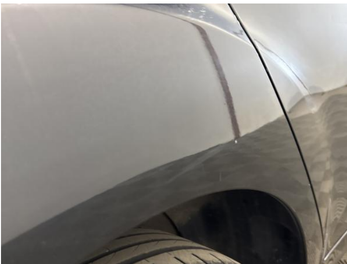
13: Qtr Panel osr Scratched Over 25mm Thru Paint