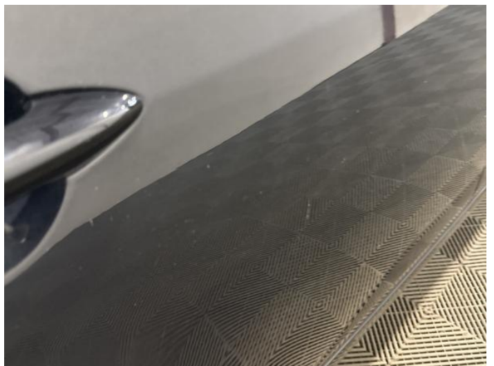
14: Door osr Dented Between 10mm + 30mm