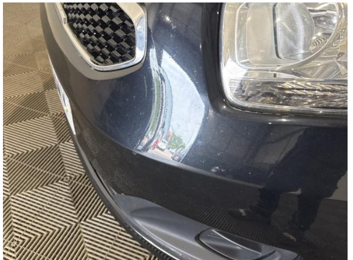
2: Bumper Front Poor Previous Repair Poor Paint