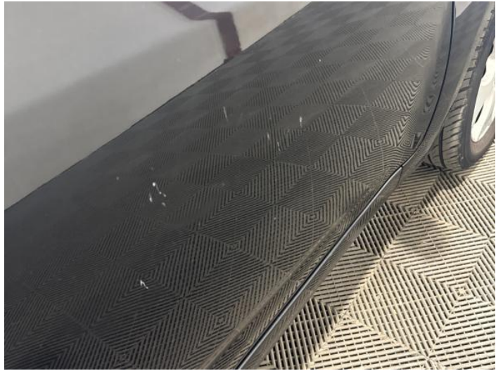
16: Door osf Scratched Over 25mm Thru Paint