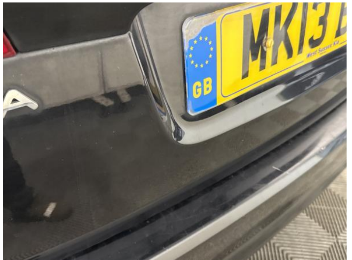
12: Tailgate Scratched UpTo 25mm Thru Paint