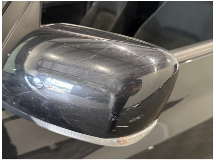
6: Door Mirror Assy nsf Scratched (Painted) UpTo 25mm Thru Paint