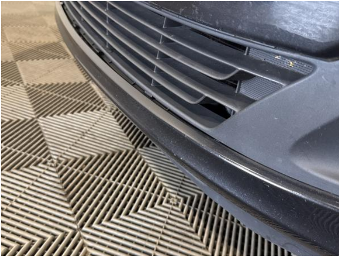
3: Bumper Front Grill Broken Replace