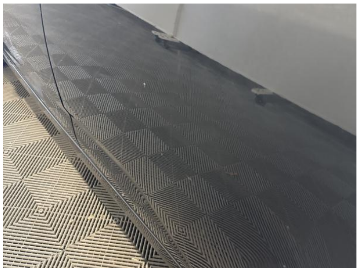
8: Door nsr Scratched Over 25mm Thru Paint