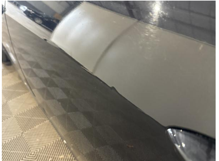
10: Door nsr Dented Between 10mm + 30mm