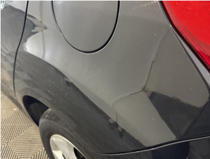
9: Qtr Panel nsr Scratched Over 25mm Thru Paint