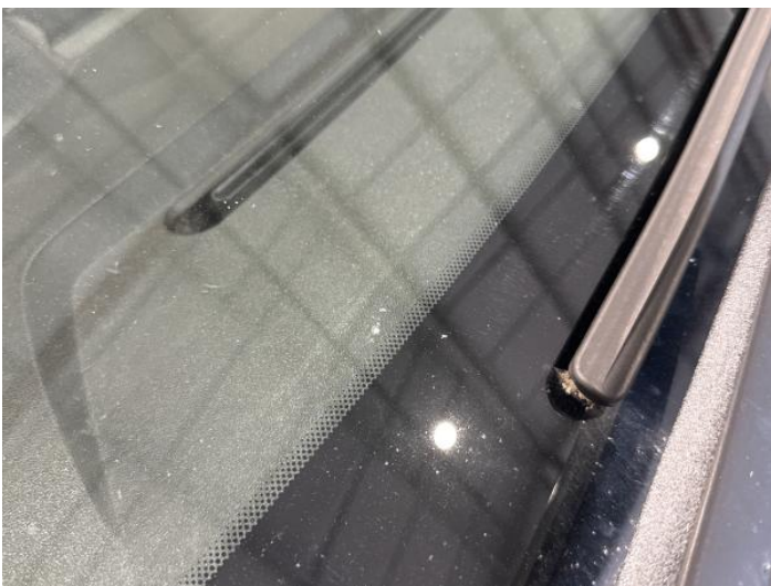
19: Screen Front Chipped UpTo 10mm