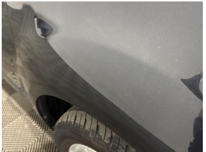
18: Wing osf Scratched Over 25mm Thru Paint