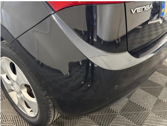
11: Bumper Rear Scratched 25 to 100mm Thru Paint