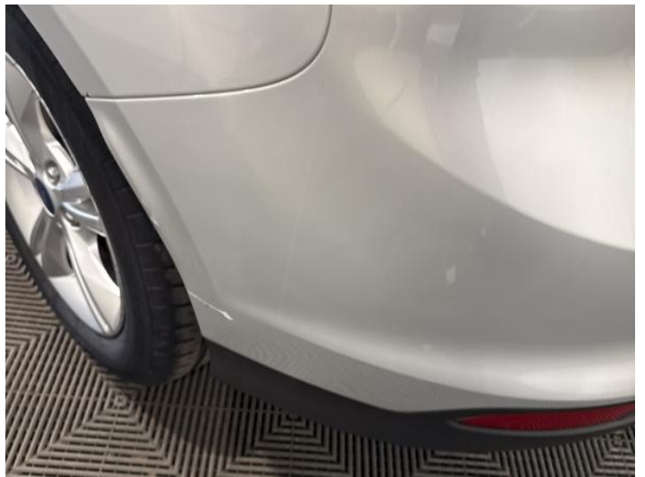
12: Bumper Rear Scratched 25 to 100mm Thru Paint