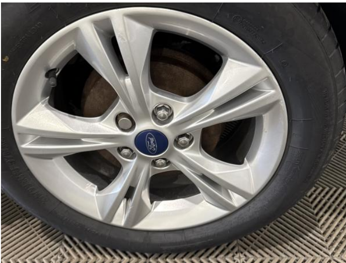
11: Wheel nsr Scratched Over 50mm