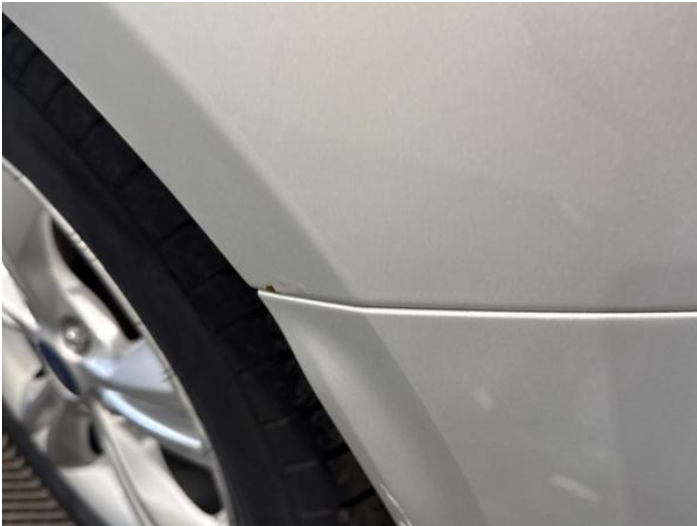
9: Qtr Panel nsr Scratched Rusted