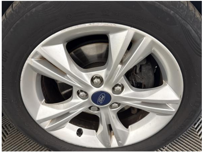
18: Wheel osf Scratched Over 50mm