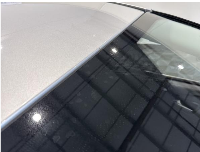
19: Roof Chipped Edge Chip