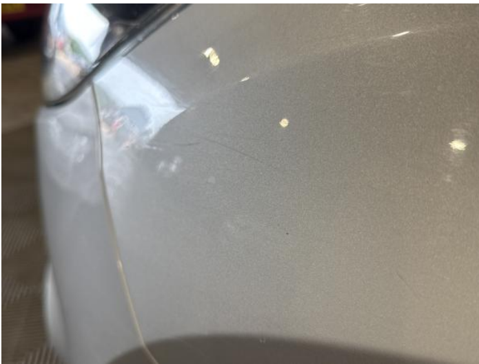
5: Wing nsf Chipped 1 To 5