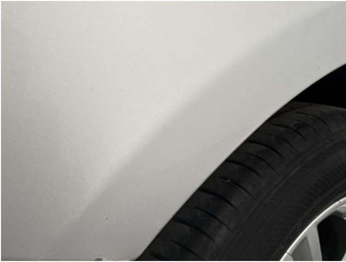
15: Qtr Panel osr Scratched Rusted