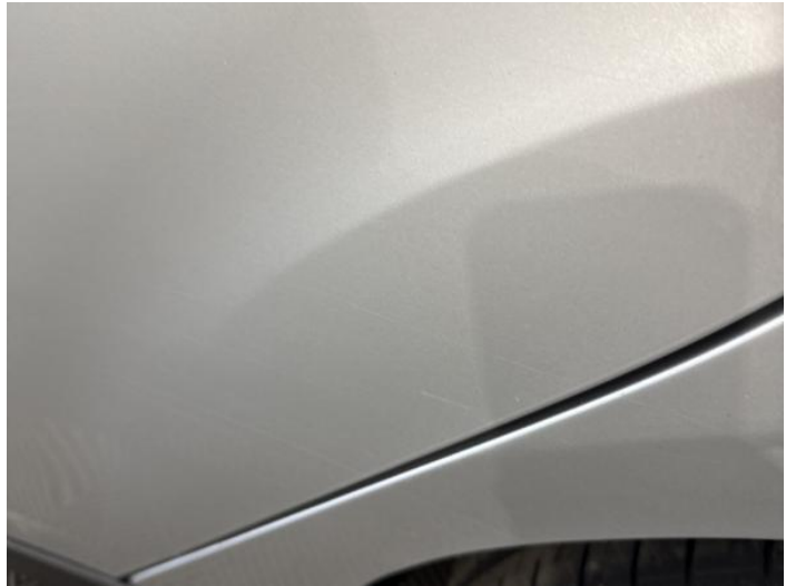
10: Door nsr Dented Over 30mm