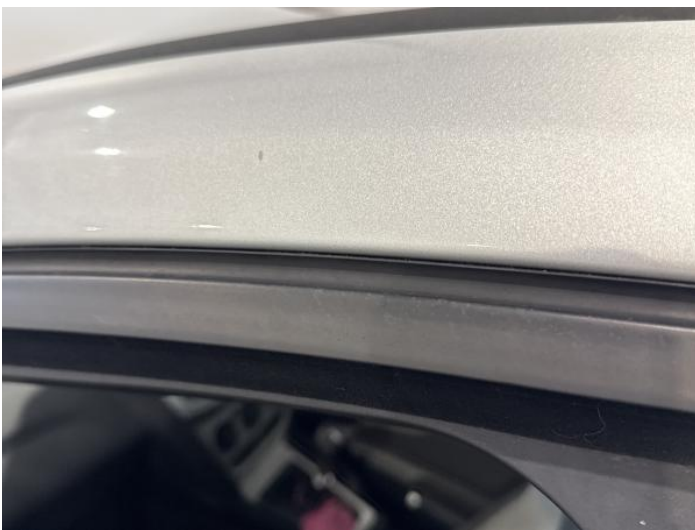
7: A Post ns Chipped 1 To 5