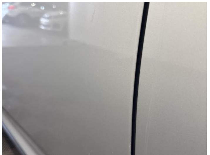
8: Door nsf Scratched Over 25mm Thru Paint