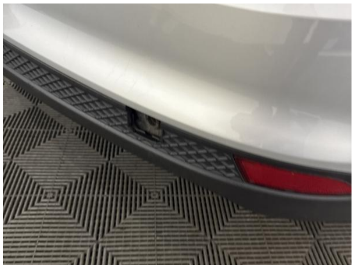
14: Rear TowEye Cvr Missing Replace