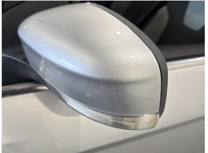
4: Door Mirror Assy nsf Scratched (Painted) UpTo 25mm Thru Paint