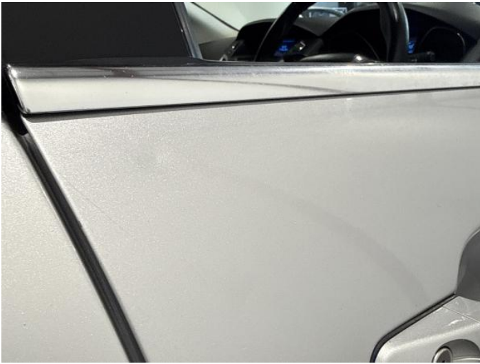
17: Door osf Dented Between 10mm + 30mm