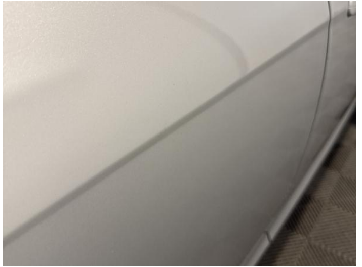
16: Door osr Dented Between 10mm + 30mm