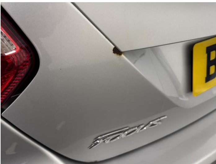
13: Tailgate Rusted Over 5mm