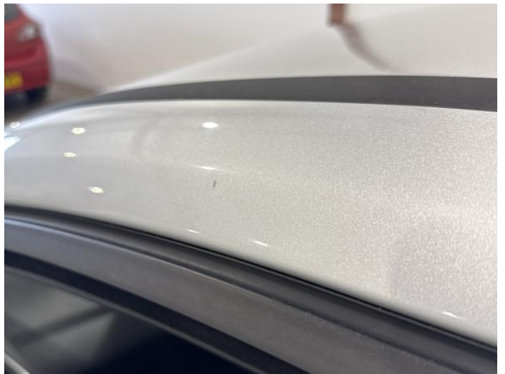
6: A Post ns Dented 2 Or Less UpTo 10mm