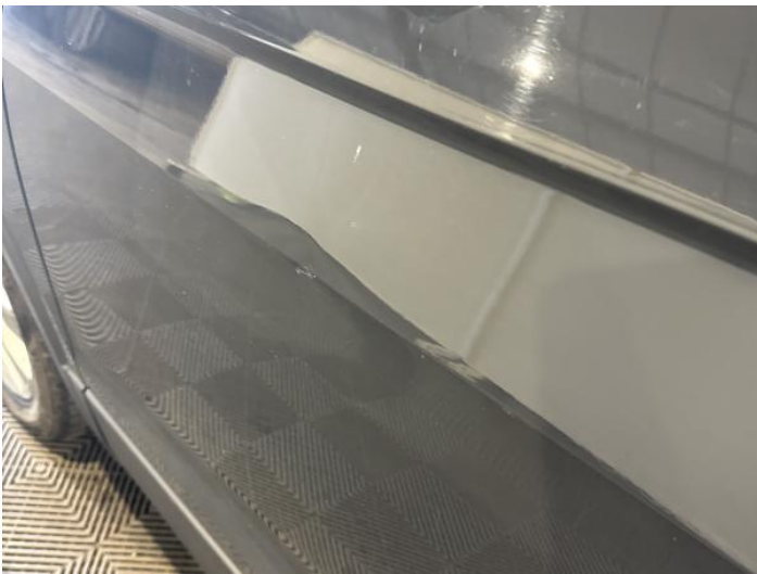
5: Door nsf Dented With Paint Damage