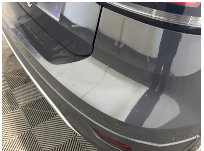
8: Bumper Rear Scratched 25 to 100mm Thru Paint