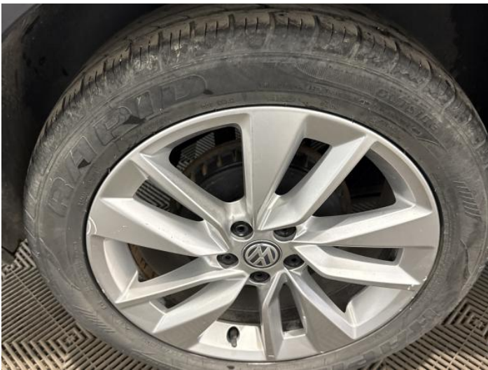
11: Wheel osr Scratched Over 50mm