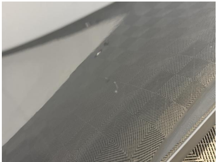
12: Door osr Scratched Over 25mm Thru Paint