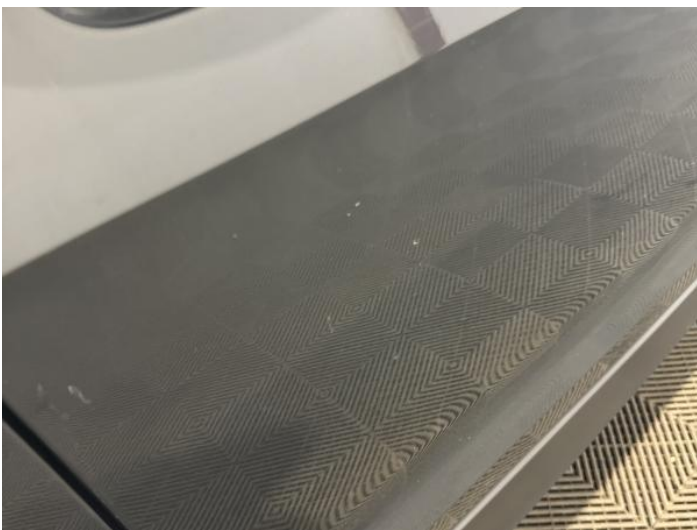
13: Door osf Chipped Multiple Chips