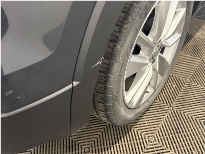
9: Qtr Panel Moulding os Scuffed (Unpainted) UpTo 100mm