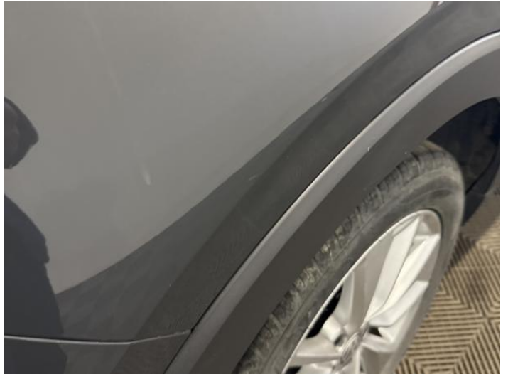
10: Qtr Panel osr Scratched UpTo 25mm Thru Paint