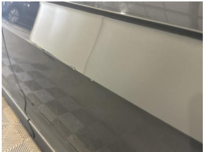
6: Door nsr Chipped 1 To 5