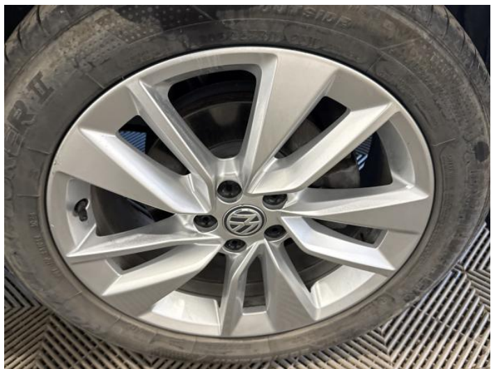
14: Wheel osf Scratched Up To 50mm