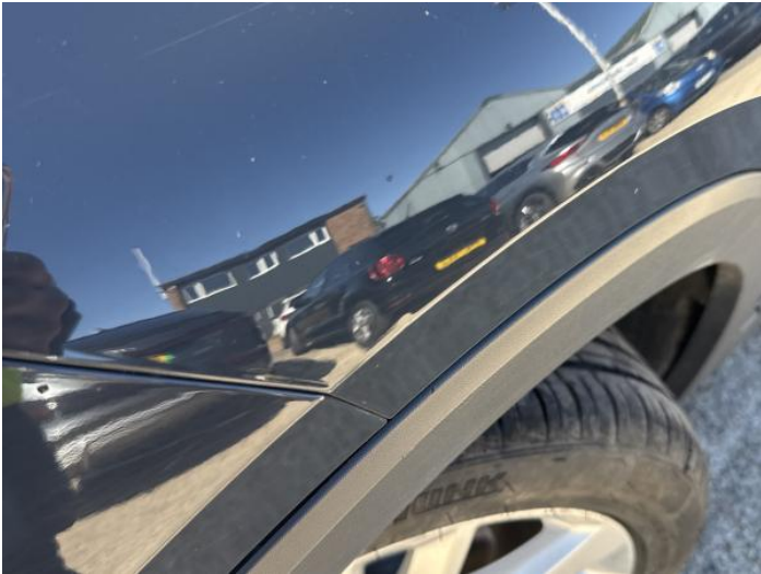
3: Wing nsf Dented Between 10mm + 30mm