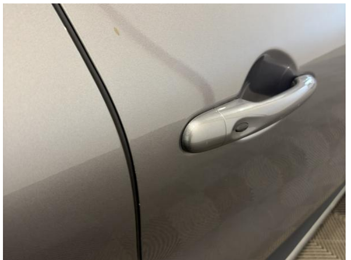
8: Door osf Chipped Edge Chip