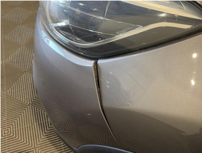
3: Bumper Front Insecure Action Required