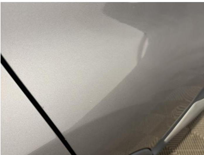
7: Door osr Chipped Edge Chip