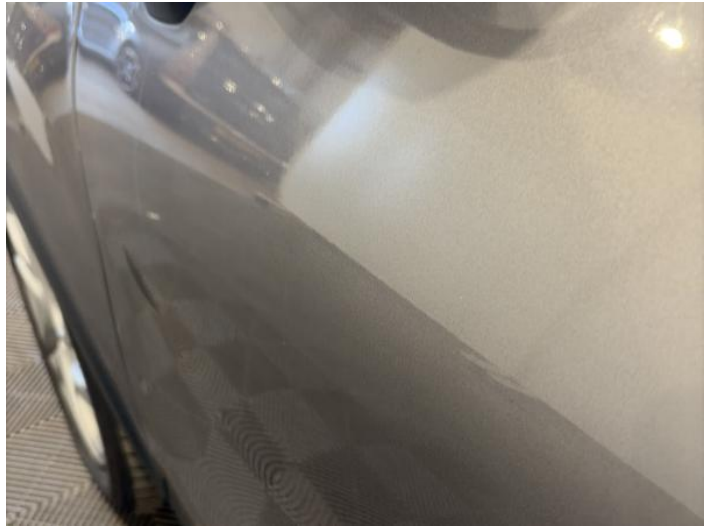
4: Door nsf Dented Over 30mm