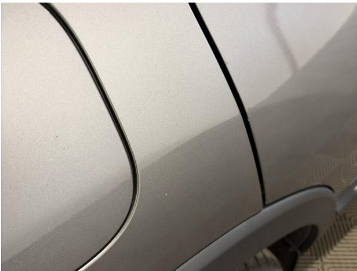
5: Qtr Panel osr Chipped 1 To 5