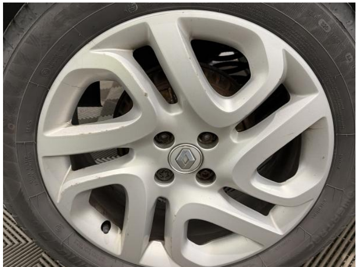
6: Wheel osr Scratched Over 50mm