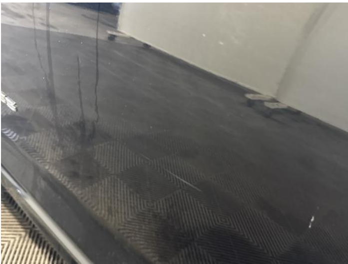
5: Door nsf Dented With Paint Damage