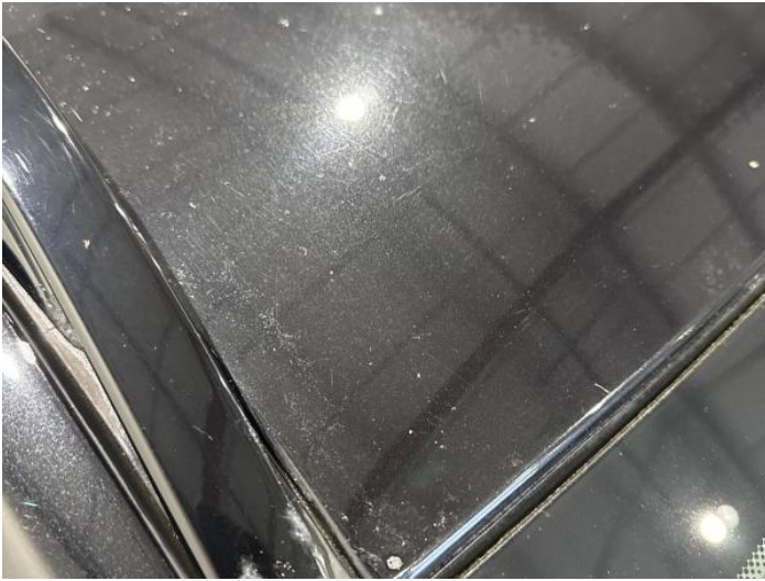
21: Roof Scratched UpTo 25mm Thru Paint