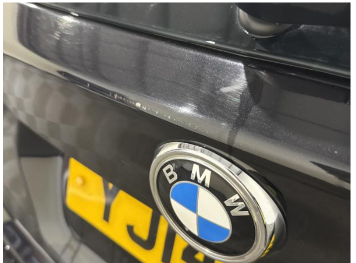
12: Tailgate Scratched Over 25mm Thru Paint