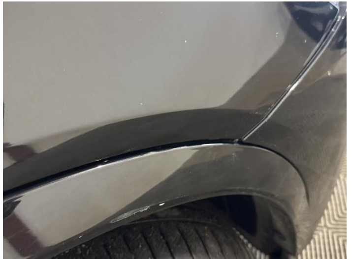
18: Wing osf Scratched Over 25mm Thru Paint