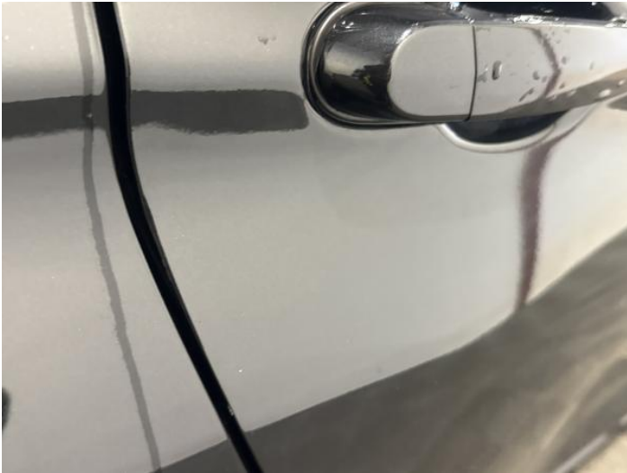
15: Door osr Chipped Edge Chip