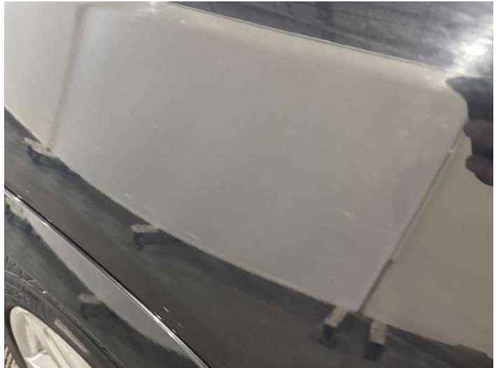
10: Qtr Panel nsr Scratched Over 25mm Thru Paint