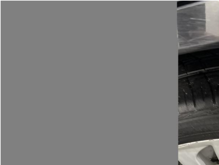
9: Qtr Panel Arch Extension ns Scratched (Painted) Over 25mm Thru Paint