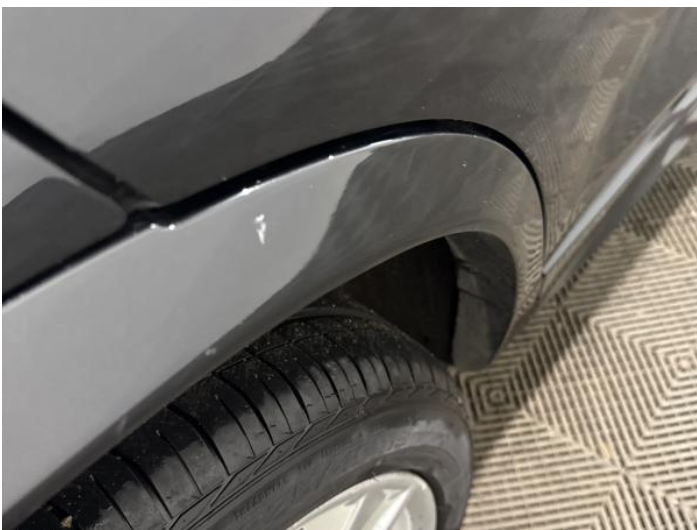
13: Qtr Panel Arch Extension os Scratched (Painted) UpTo 25mm Thru Paint