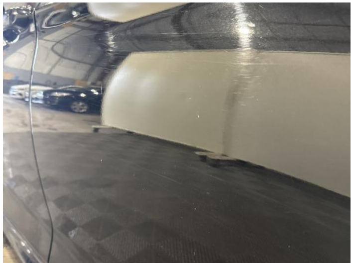
6: Door nsr Dented Between 10mm + 30mm