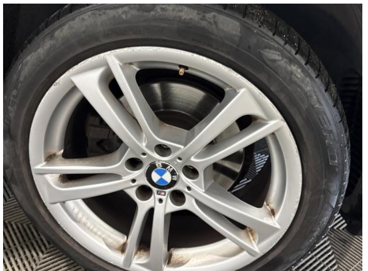
20: Wheel osf Scratched Over 50mm