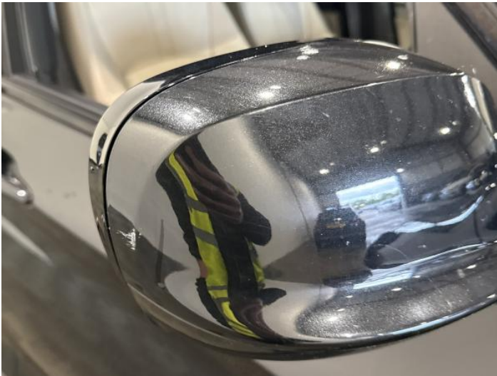
17: Door Mirror Assy osf Scratched (Painted) UpTo 25mm Thru Paint