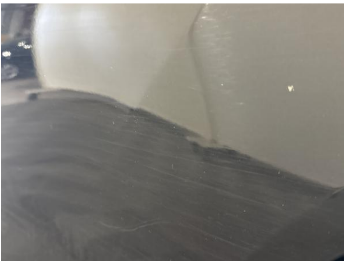
7: Door nsr Scratched Over 25mm Thru Paint