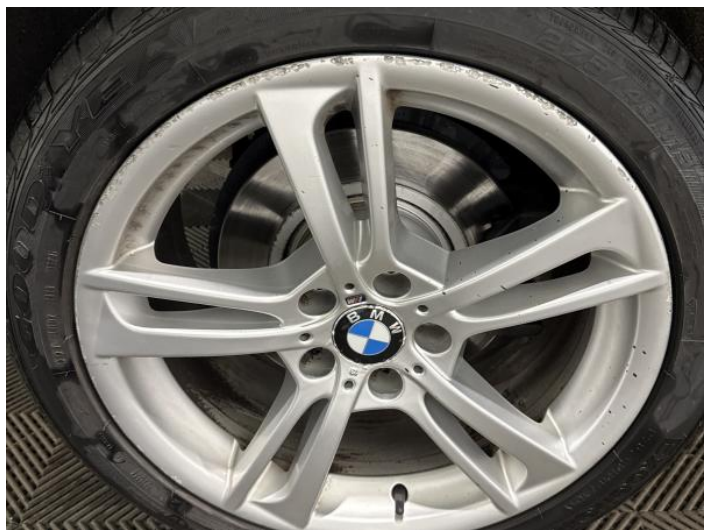
14: Wheel osr Scratched Over 50mm