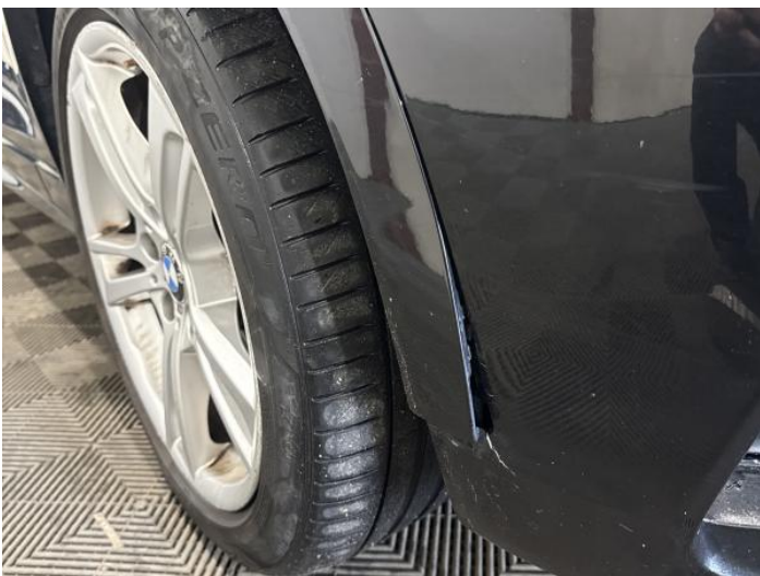
19: Wing Front Arch Extension os Broken Replace