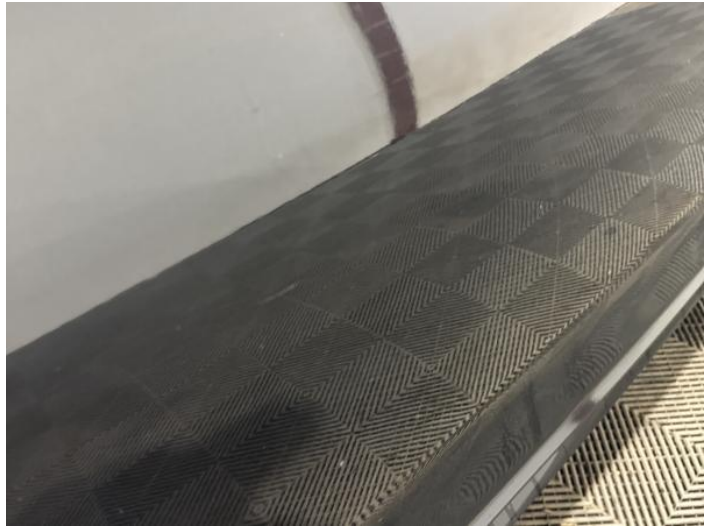
16: Door osf Scratched UpTo 25mm Thru Paint