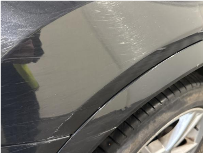
3: Wing nsf Scratched Over 25mm Thru Paint