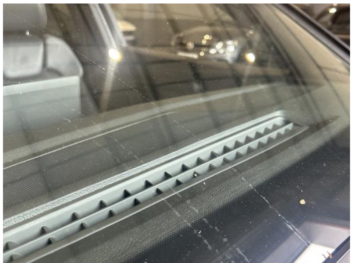
8: Screen Front Chipped UpTo 10mm