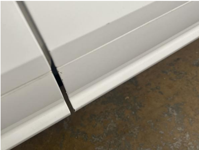
1: Door osf Chipped 1 To 5