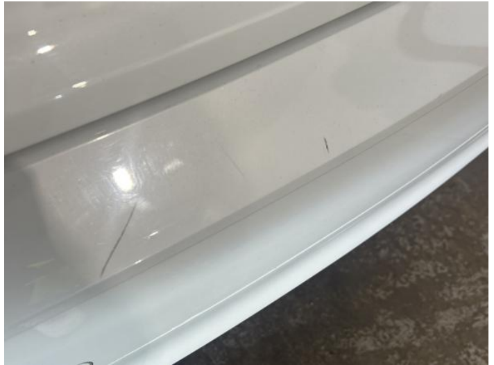
4: Bumper Rear Scratched 25 to 100mm Thru Paint