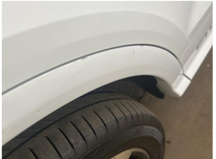
2: Qtr Panel Moulding os Scratched (Painted) UpTo 25mm Thru Paint