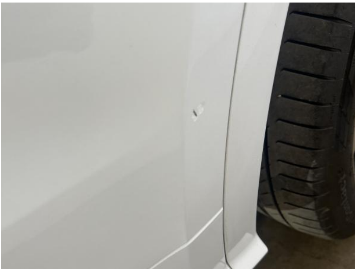
5: Bumper Rear Chipped 1 To 5