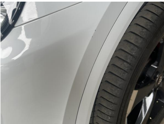
7: Bumper Front Chipped 1 To 5