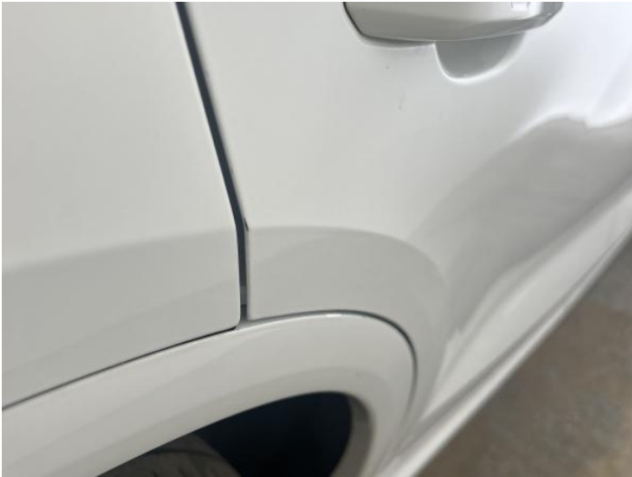
3: Door osr Chipped Edge Chip