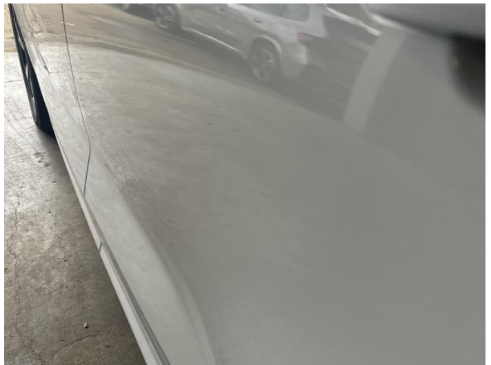
6: Door nsr Dented Between 10mm + 30mm