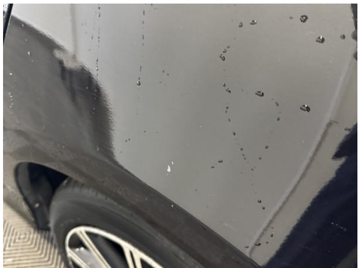
8: Qtr Panel nsr Chipped 1 To 5