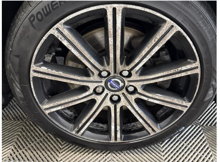
16: Wheel of Scratched Over 50mm