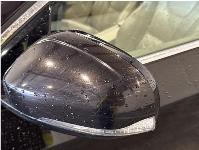
5: Door Mirror Assy nsf Scratched (Painted) Over 25mm Thru Paint