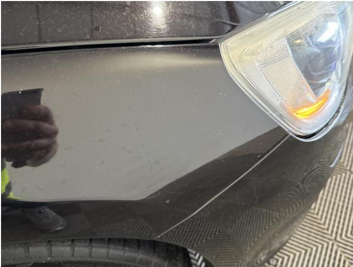
15: Wing of Chipped 1 To 5