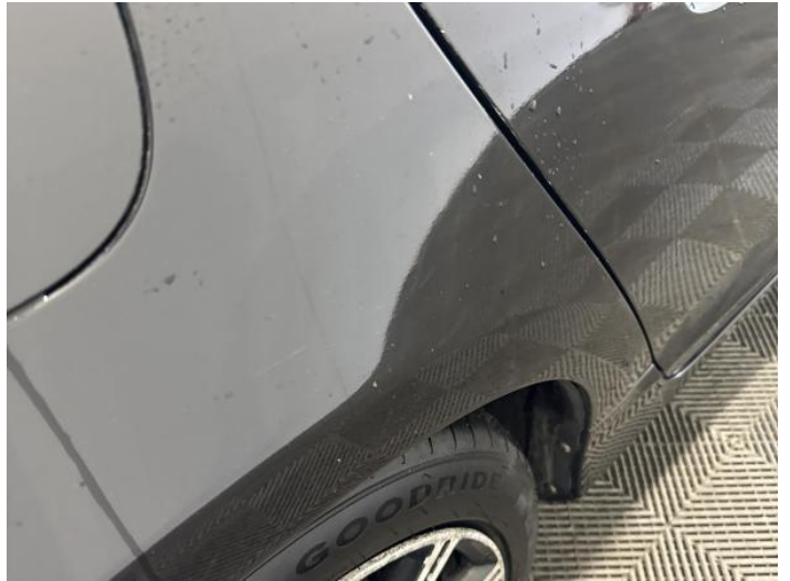
10: Qtr Panel osr Chipped 1 To 5