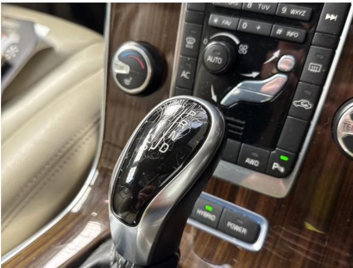
17: Switches And Controls Broken Replace