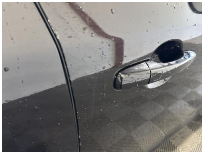
14: Door osf Chipped Edge Chip