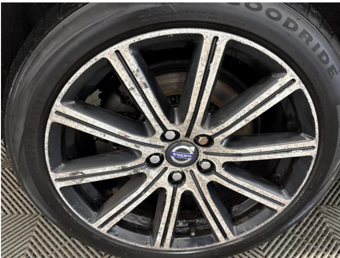
11: Wheel osr Scratched Over 50mm