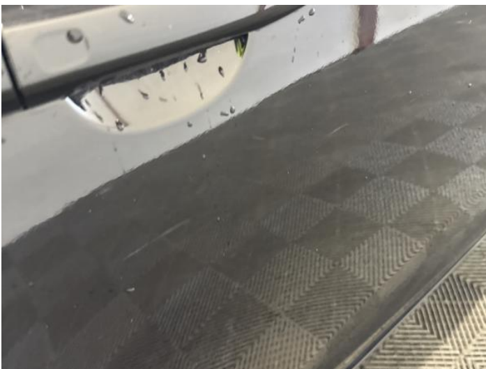
13: Door osr Scratched Over 25mm Thru Paint