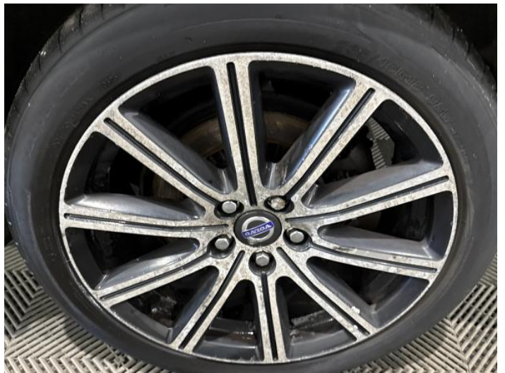
12: Wheel nsr Scratched Over 50mm