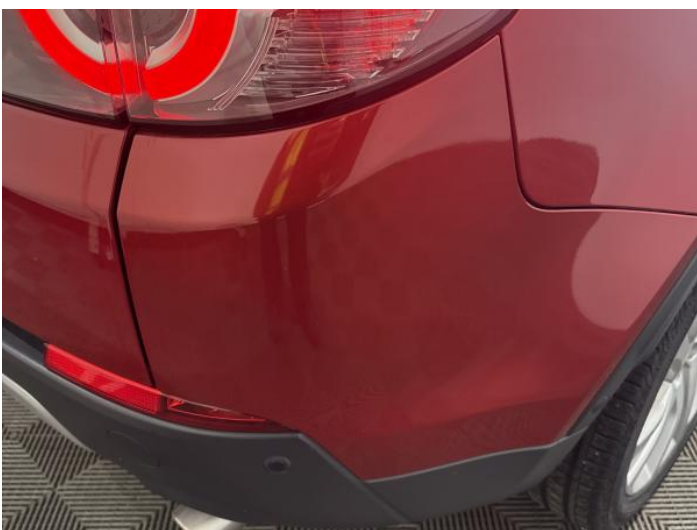
7: Bumper Rear Scratched 25 to 100mm Thru Paint