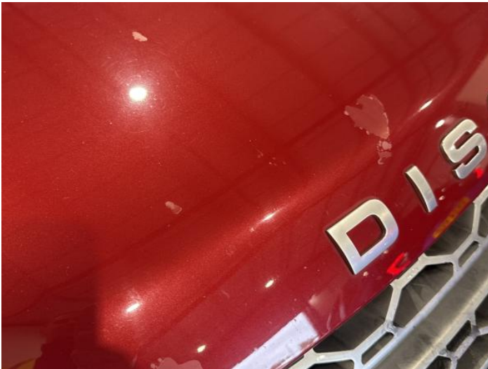
1: Bonnet Poor Previous Repair Paint Flake