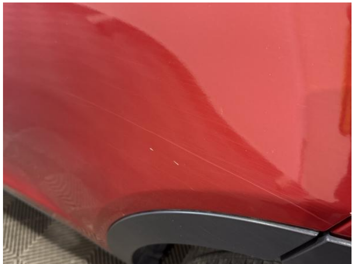
6: Door nsr Chipped 1 To 5