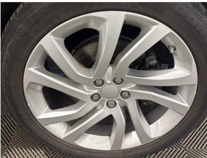
13: Wheel osf Scratched Over 50mm