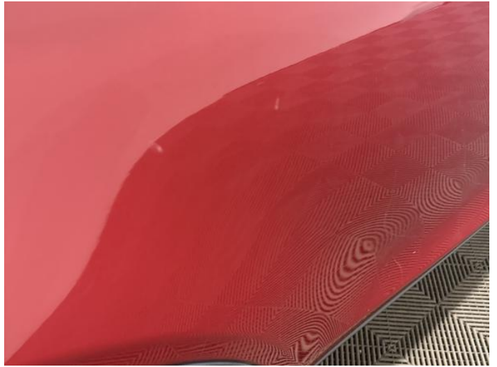
10: Door osr Scratched Over 25mm Thru Paint