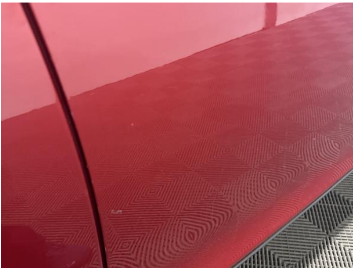
11: Door osf Scratched Over 25mm Thru Paint