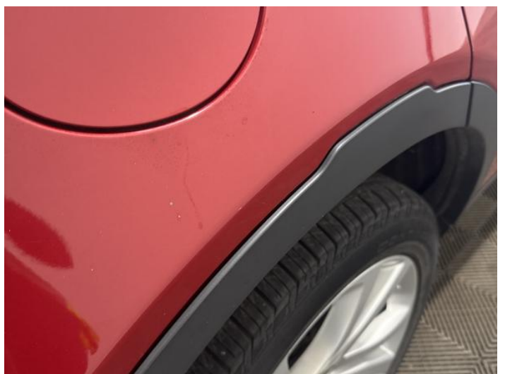
8: Qtr Panel osr Chipped 1 To 5