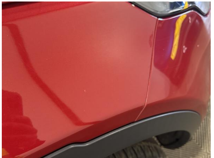
12: Wing osf Chipped 1 To 5