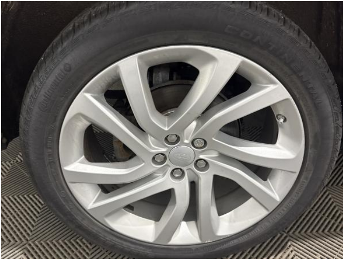
9: Wheel osr Scratched Up To 50mm