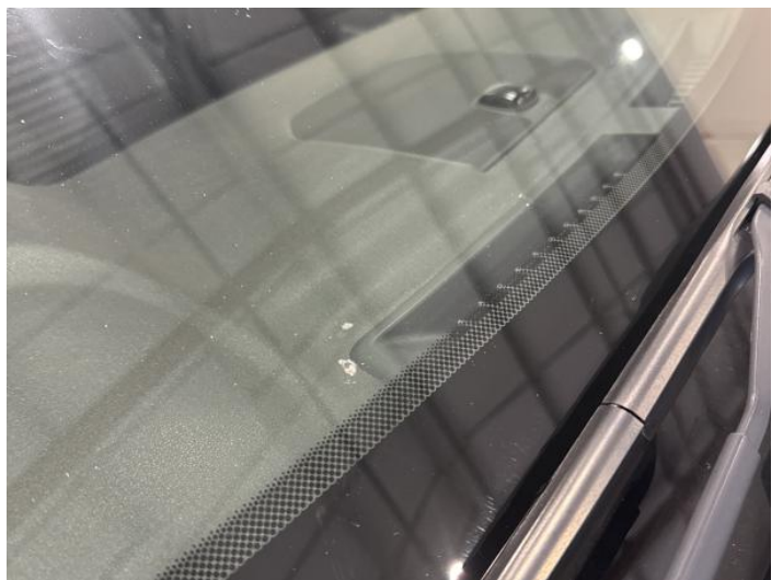
14: Screen Front Chipped UpTo 10mm