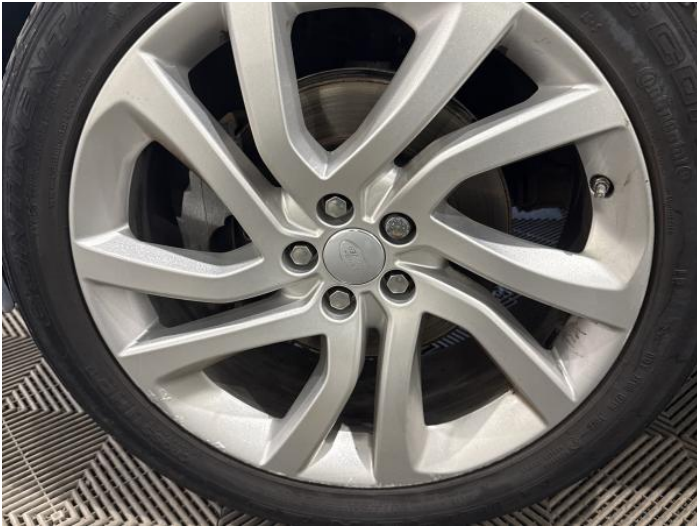
3: Wheel nsf Scratched Up To 50mm