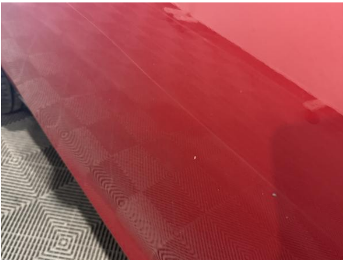
5: Door nsf Chipped 1 To 5