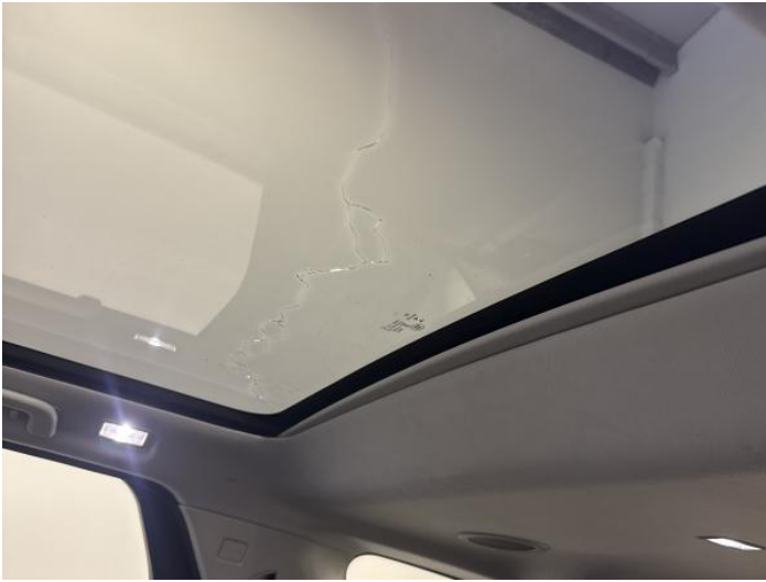
15: Glass Roof Cracked Replace