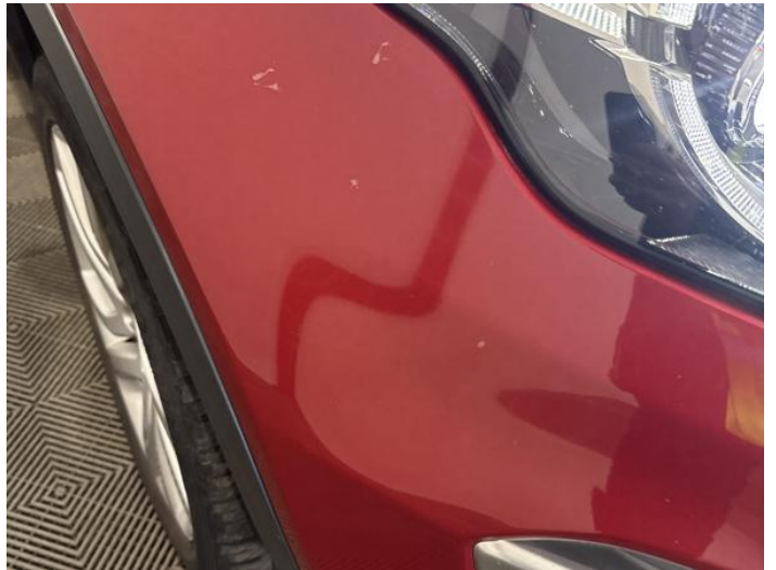
2: Bumper Front Poor Previous Repair Paint Flake