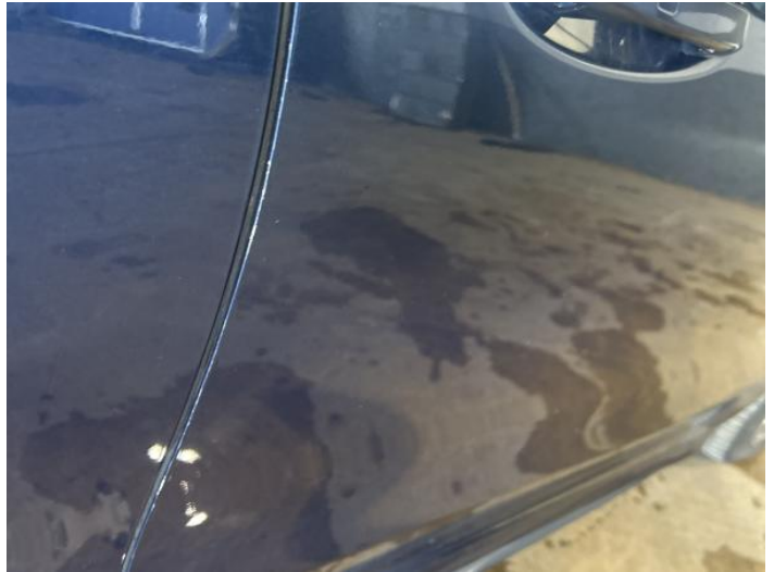
4: Door osf Chipped Edge Chip