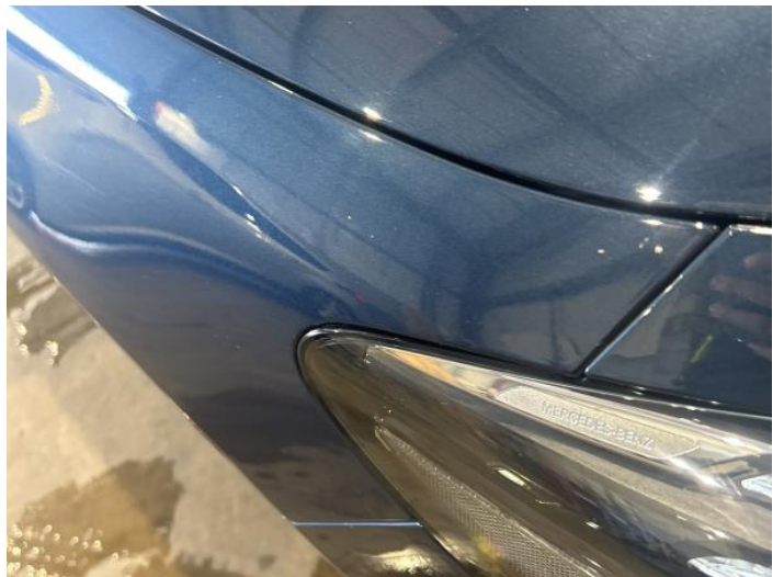
2: Wing osf Chipped 1 To 5