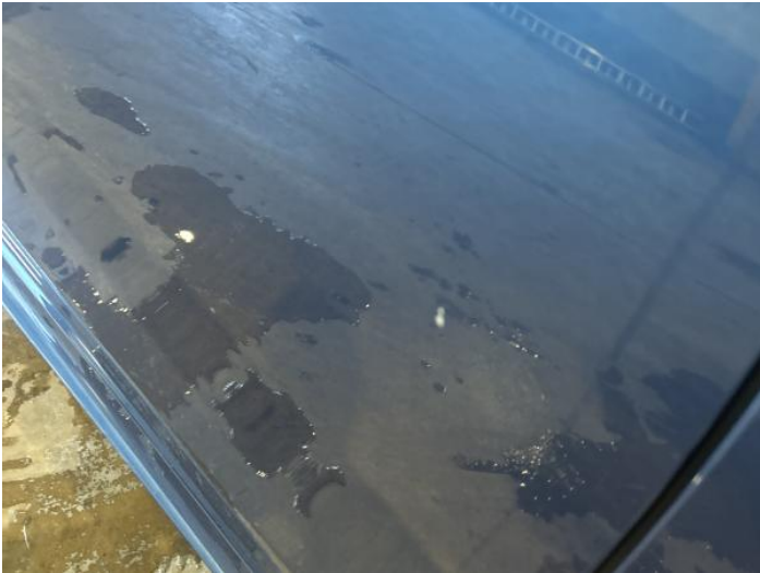
3: Door osf Chipped 1 To 5