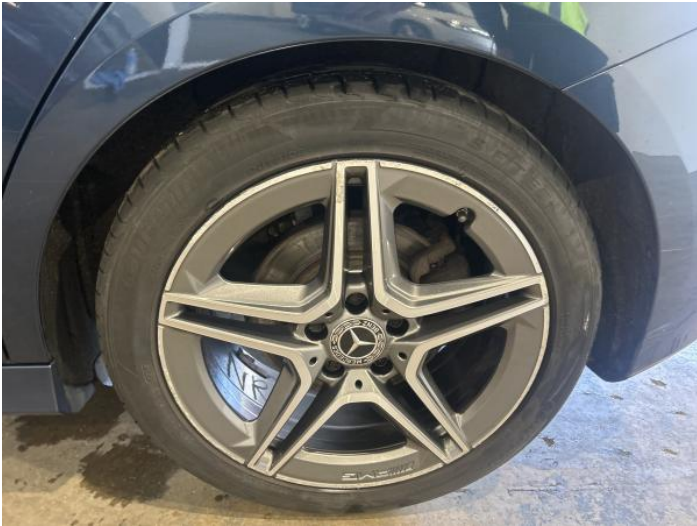
9: Wheel nsr Corroded Light