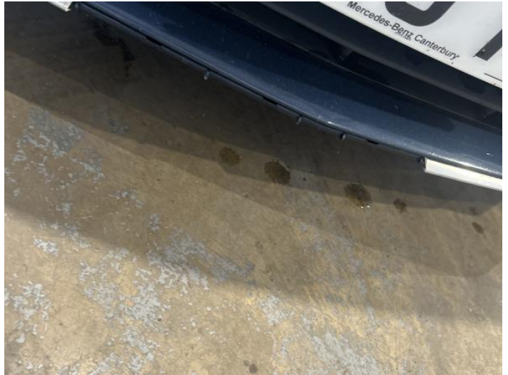
16: Bumper Front Moulding Broken Replace