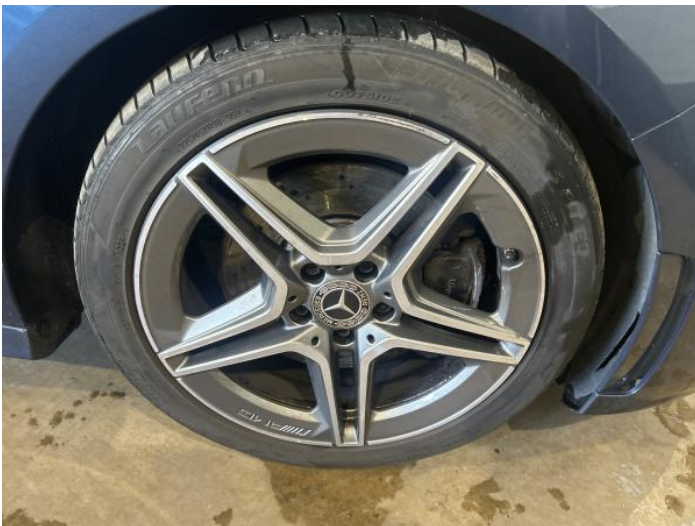
1: Wheel osf Corroded Light