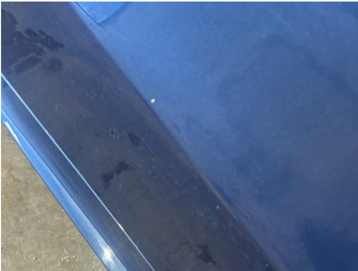
5: Door osr Chipped 1 To 5