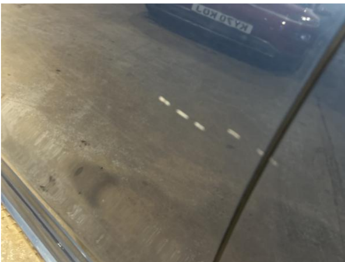
13: Door nsf Scratched Over 25mm Thru Paint