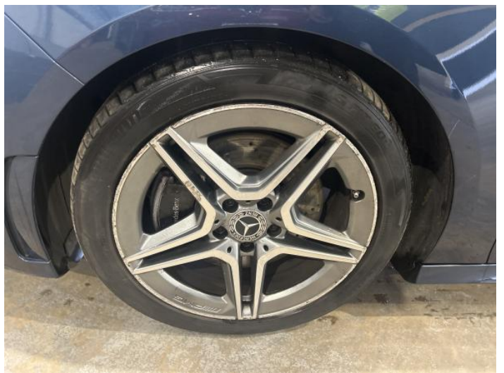
14: Wheel nsf Scratched Over 50mm