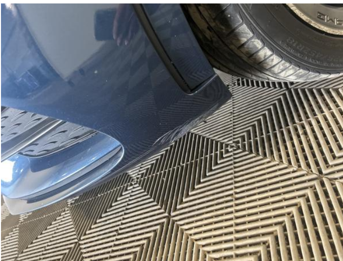
19: Bumper Front Scratched 25 to 100mm Thru Paint