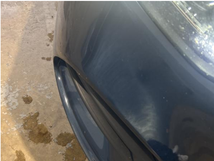
17: Bumper Front Chipped Multiple Chips