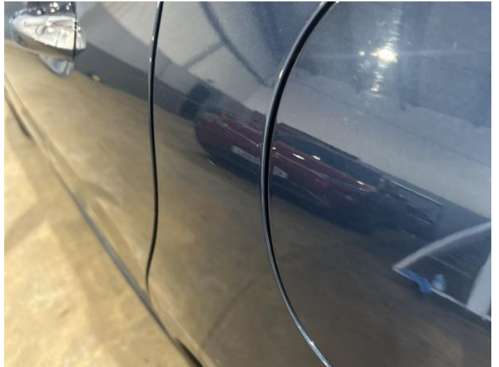
10: Qtr Panel nsr Dented Between 10mm + 30mm