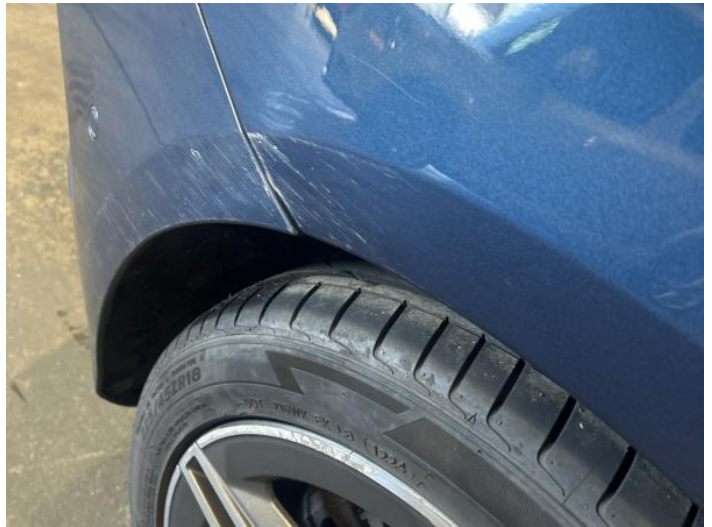
6: Qtr Panel osr Scratched Over 25mm Thru Paint