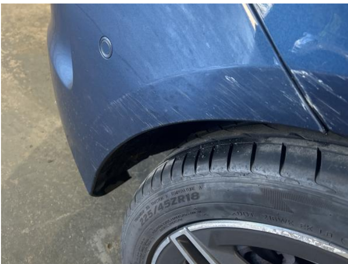
7: Bumper Rear Scratched Over 100mm Thru Paint