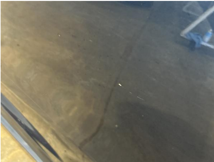
11: Door nsr Chipped 1 To 5