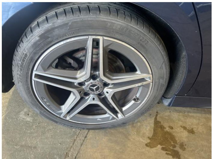
8: Wheel osr Corroded Light