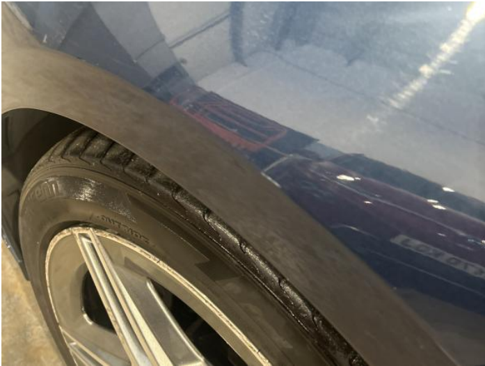
15: Wing nsf Scratched UpTo 25mm Thru Paint