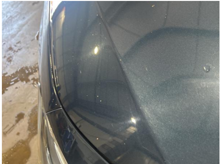
18: Bonnet Chipped Multiple Chips