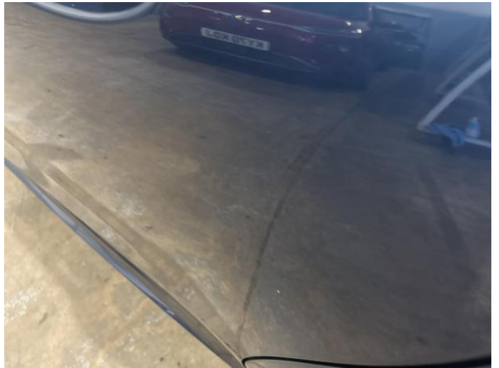
12: Door nsr Dented 2 Or Less UpTo 10mm