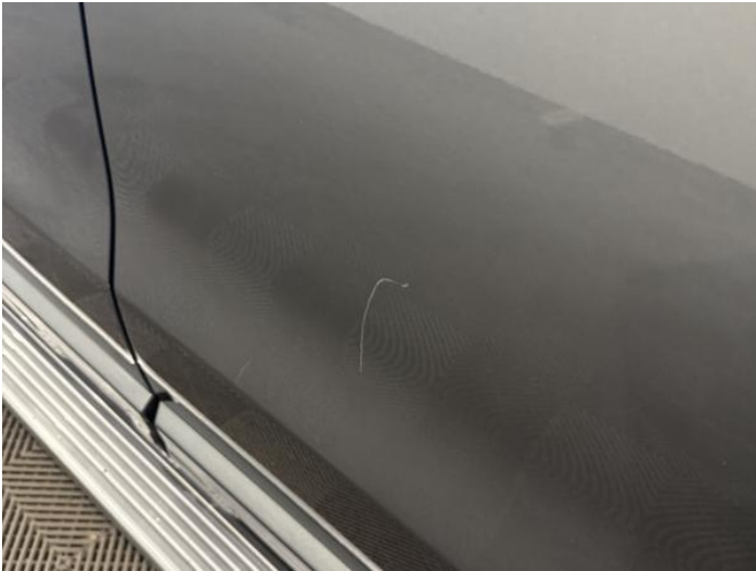
9: Door nsr Scratched Over 25mm Thru Paint