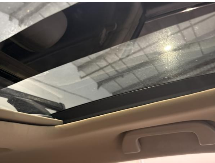
19: Glass Roof Cracked Replace