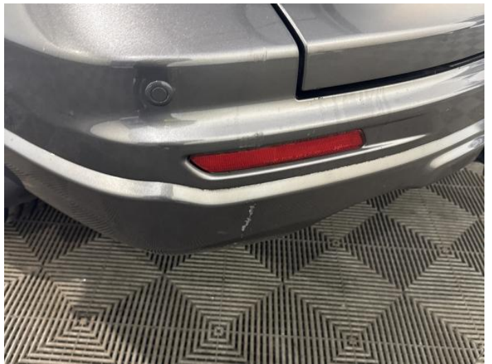
12: Bumper Rear Scratched 25 to 100mm Thru Paint