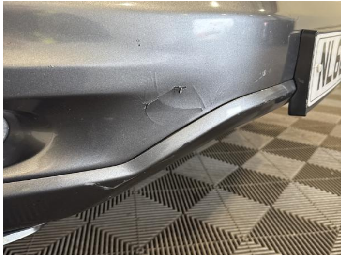
4: Bumper Front Dented With Paint Damage