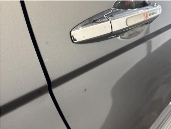
15: Door osr Scratched UpTo 25mm Thru Paint