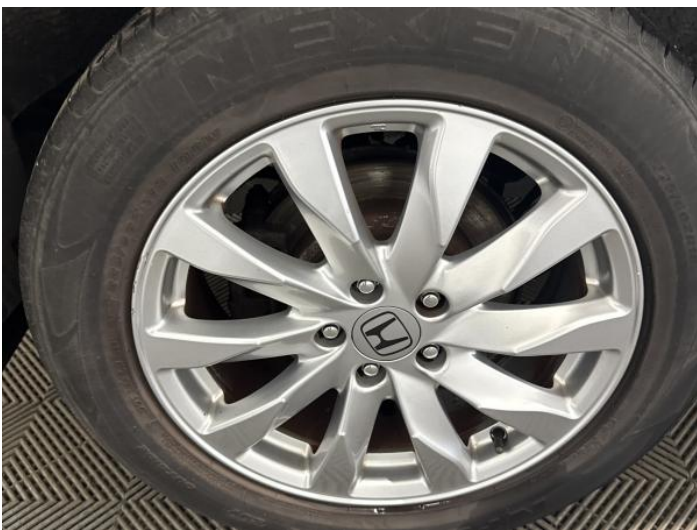
13: Wheel osr Scratched Over 50mm