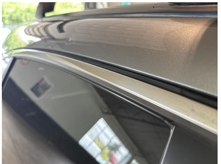
20: B Post os Dented Between 10mm + 30mm