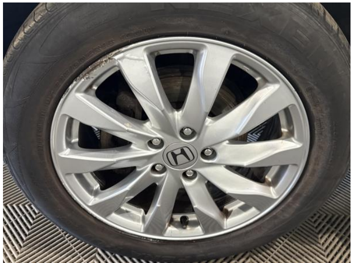
6: Wheel nsf Scratched Over 50mm