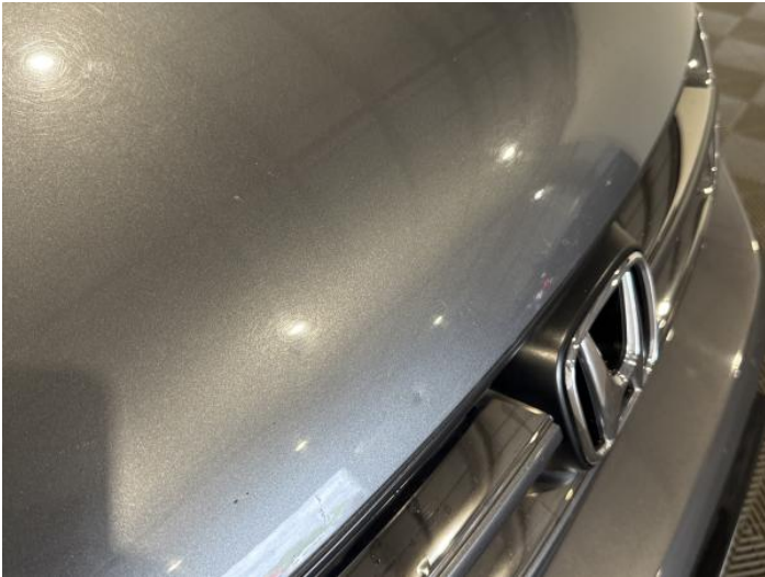
3: Bonnet Chipped 1 To 5