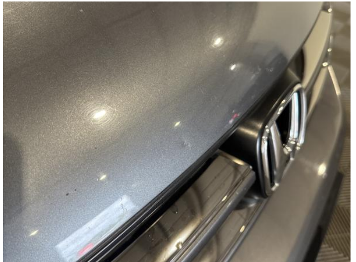
2: Bonnet Dented Between 10mm + 30mm