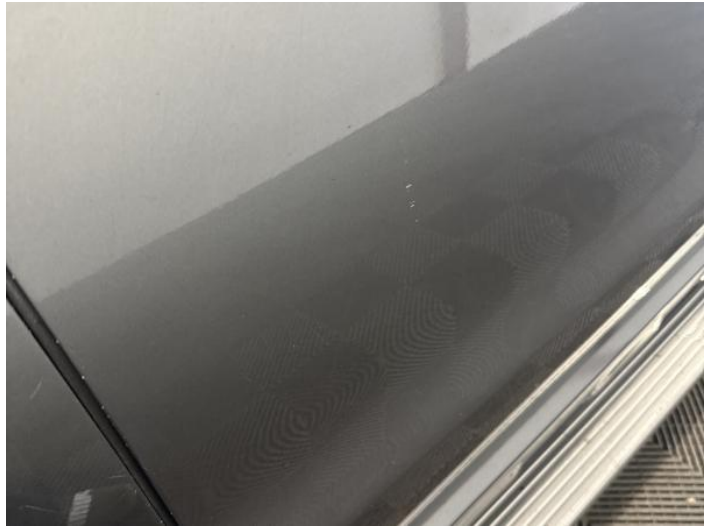
16: Door osf Chipped 1 To 5