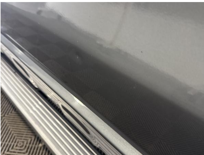
7: Door nsf Dented Between 10mm + 30mm