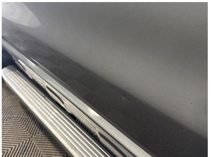
8: Door nsr Chipped 1 To 5