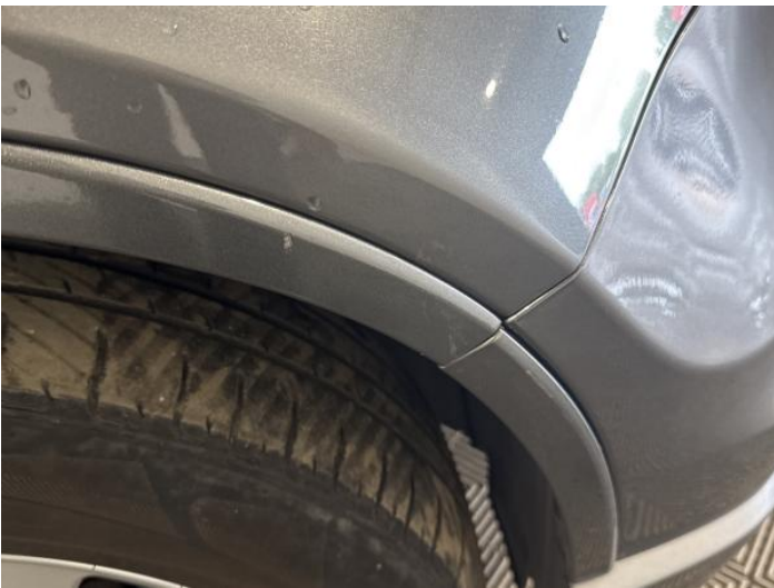
17: Wing osf Scratched UpTo 25mm Thru Paint