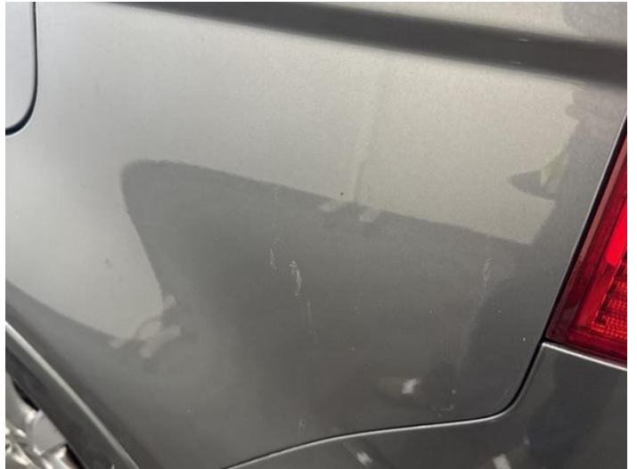
10: Qtr Panel nsr Scratched Over 25mm Thru Paint