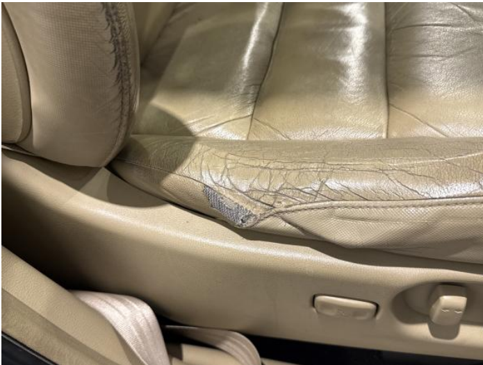
1: Seat Base Cover osf Scuffed Over 25mm