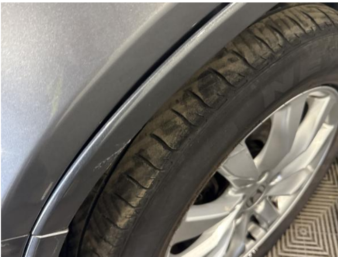
5: Wing Front Arch Extension ns Scratched (Painted) Over 25mm Thru Paint