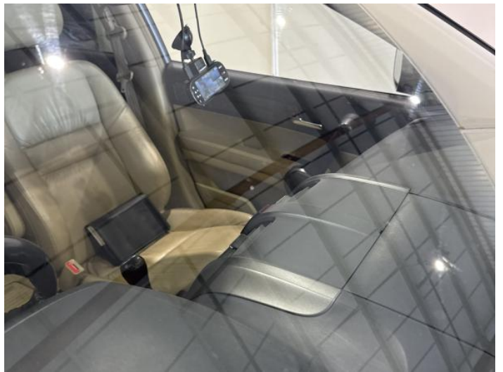
18: Screen Front Chipped UpTo 10mm