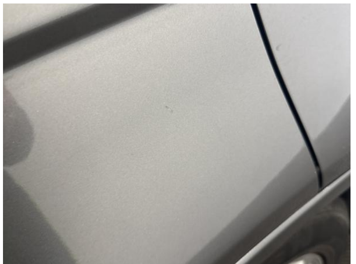
14: Qtr Panel osr Scratched UpTo 25mm Thru Paint