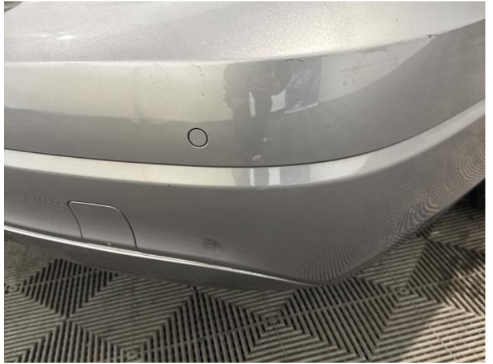
10: Bumper Rear Dented With Paint Damage