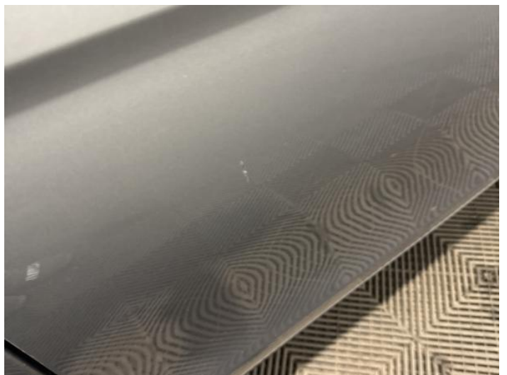
14: Door osf Scratched UpTo 25mm Thru Paint