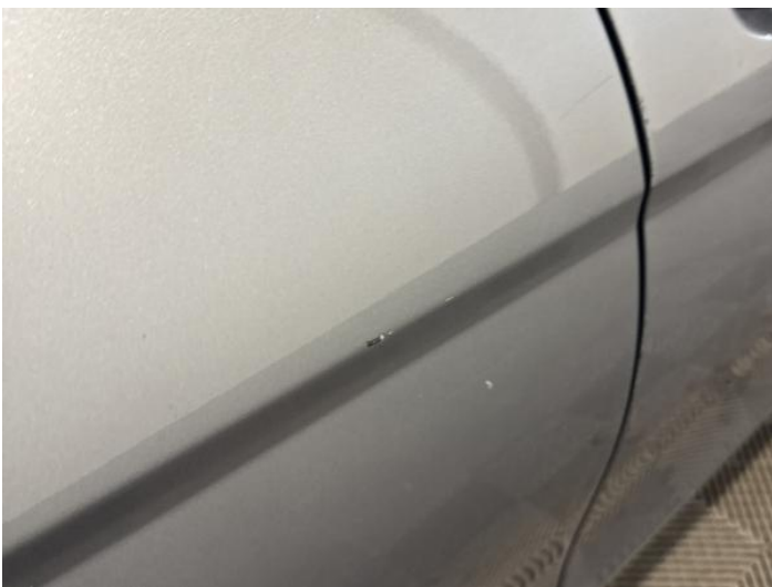
13: Door osr Scratched UpTo 25mm Thru Paint