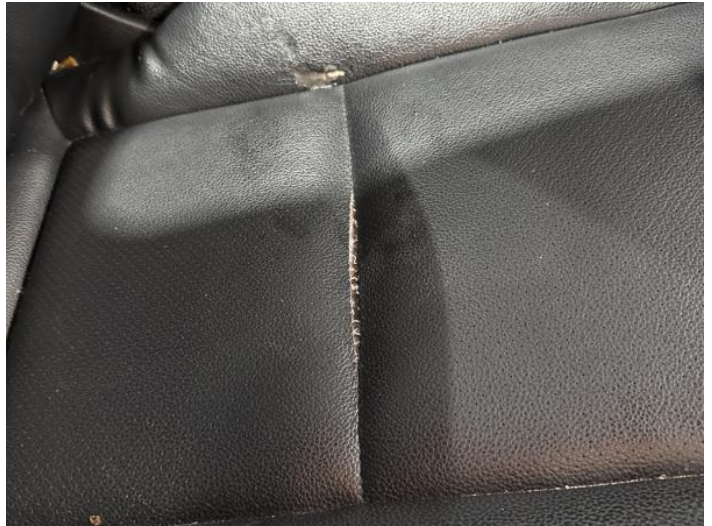
16: Seat Base Cover nsf Torn Over 3mm