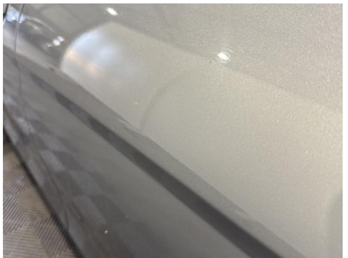
8: Door nsr Dented Between 10mm + 30mm