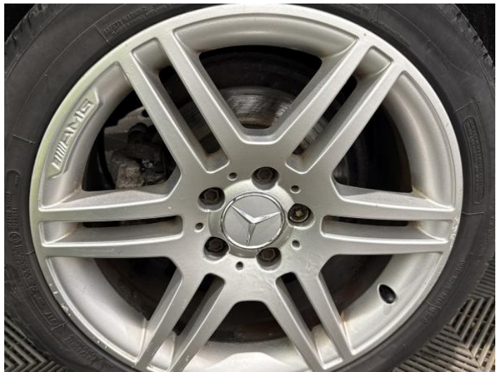
12: Wheel osr Scratched Up To 50mm