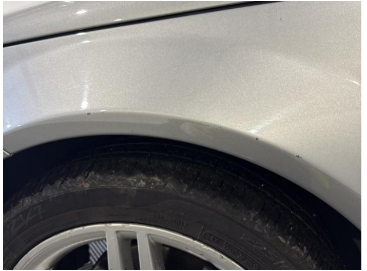
4: Wing nsf Chipped Multiple Chips