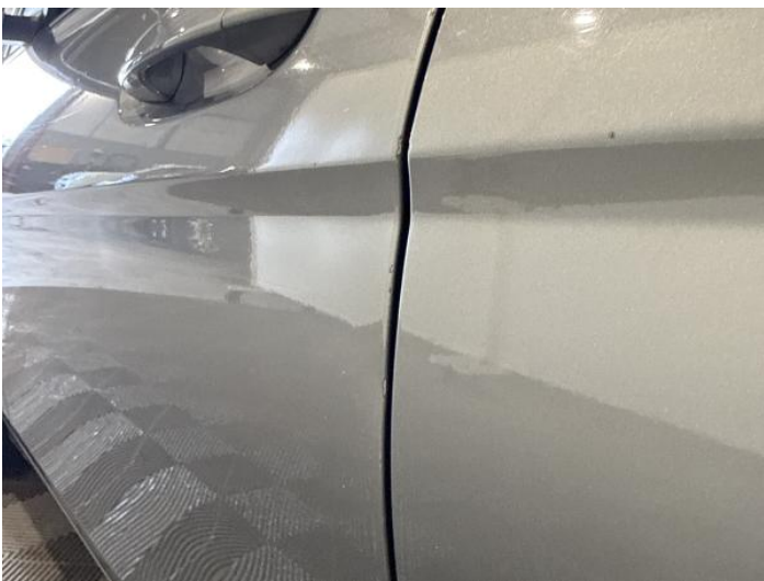
7: Door nsf Chipped Edge Chip