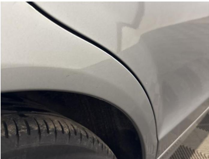
11: Qtr Panel osr Scratched UpTo 25mm Thru Paint