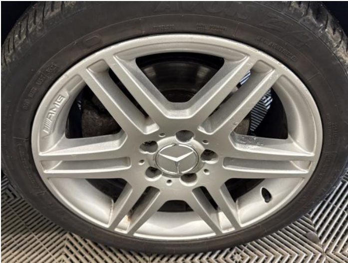
15: Wheel osf Scratched Over 50mm