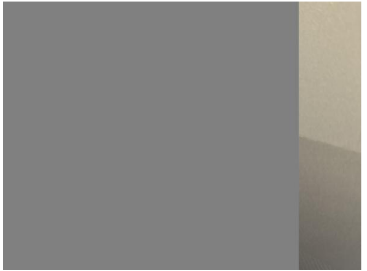
6: Door nsf Dented Over 30mm