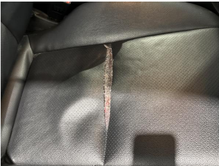
17: Seat Base Cover osf Torn Over 3mm