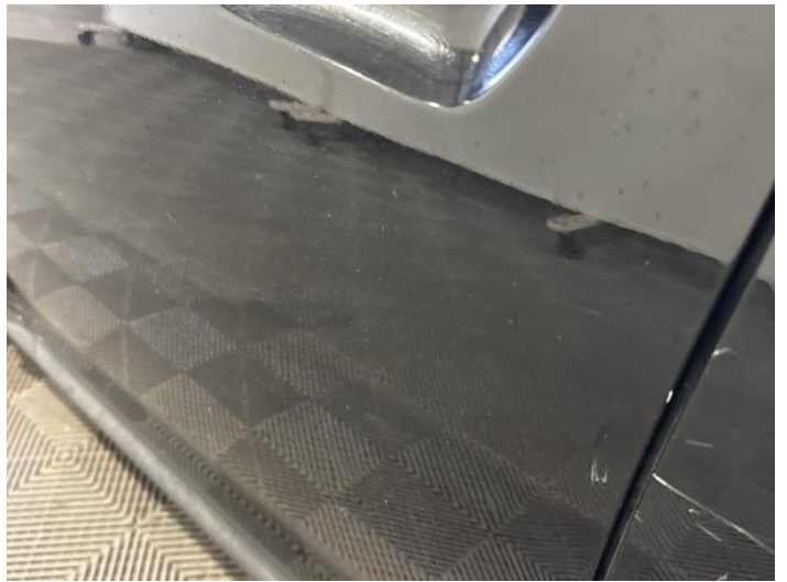
8: Door nsf Scratched UpTo 25mm Thru Paint