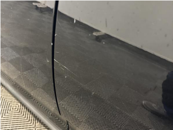
9: Door nsr Scratched Over 25mm Thru Paint