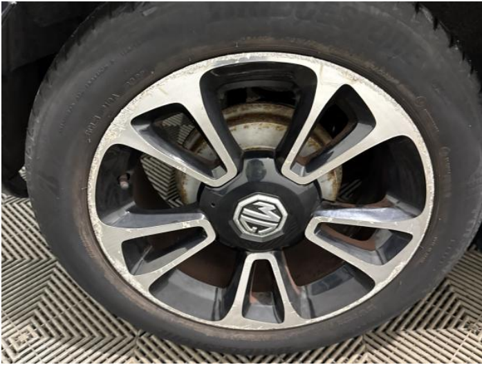
15: Wheel osr Scratched Over 50mm