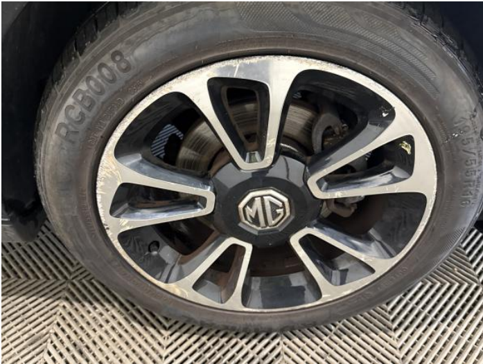
21: Wheel of Scratched Over 50mm