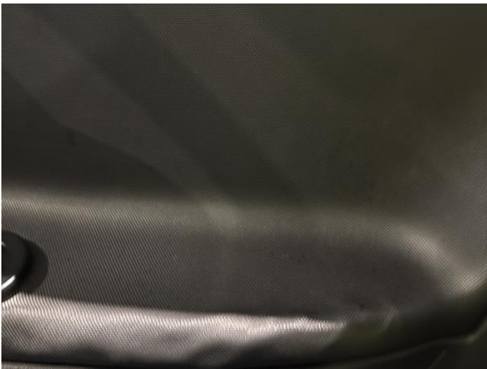
23: Door Pad of Scuffed Over 25mm