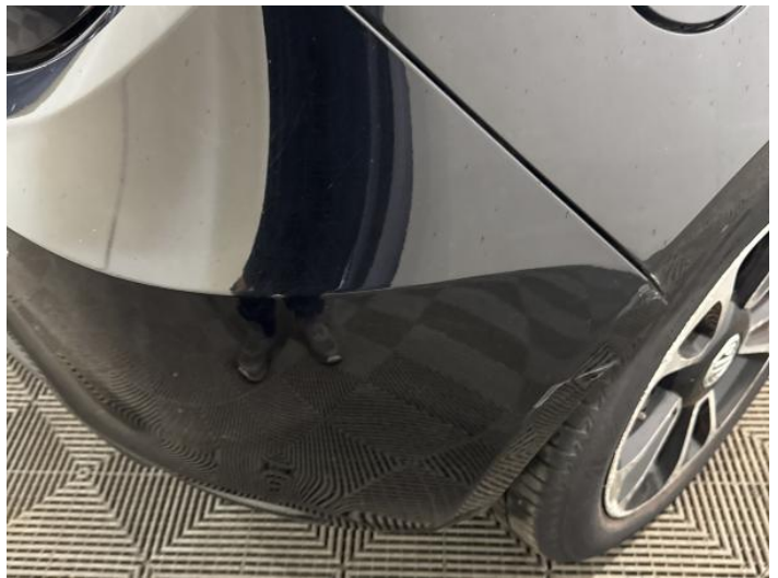
12: Bumper Rear Scratched 25 to 100mm Thru Paint