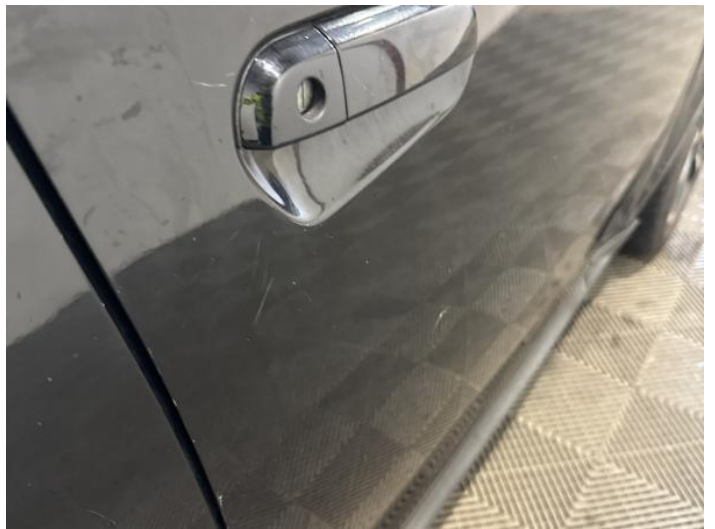
18: Door osf Scratched Over 25mm Thru Paint