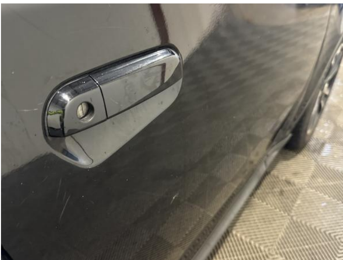
19: Door osf Dented 2 Or Less UpTo 10mm