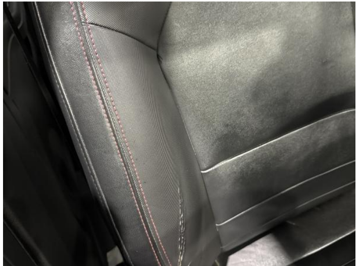
2: Seat Back Cover osf Scuffed Over 25mm