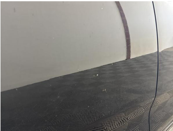
17: Door osr Chipped 1 To 5