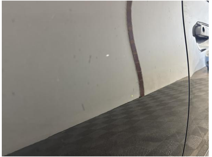
16: Door osr Dented 2 Or Less UpTo 10mm