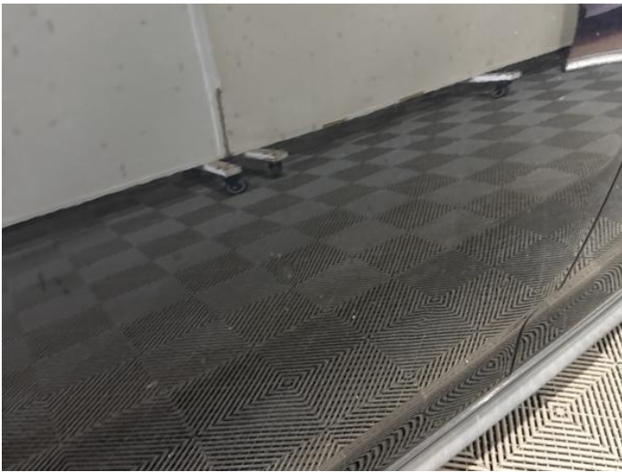
7: Door nsf Dented Between 10mm + 30mm