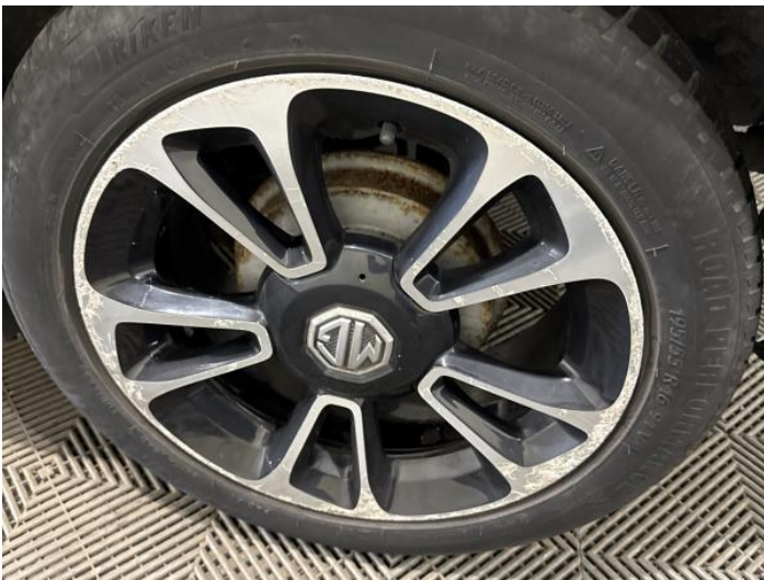
11: Wheel nsr Scratched Over 50mm