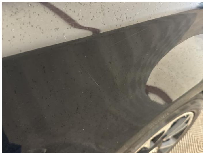
20: Wing osf Scratched Over 25mm Thru Paint