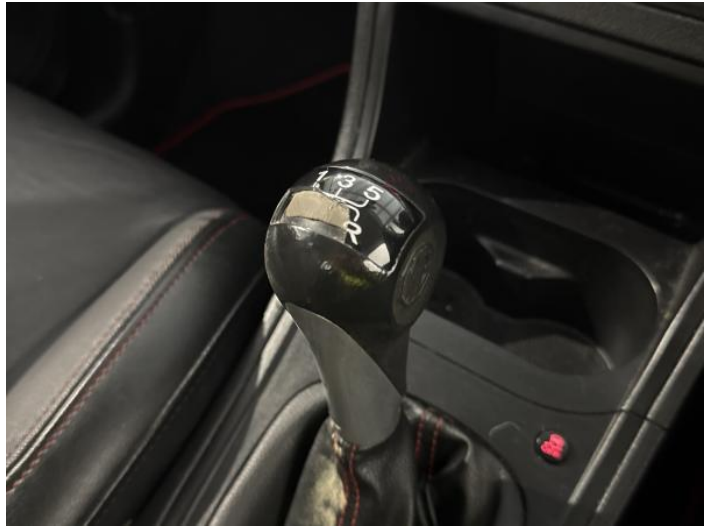
22: Switches And Controls Broken Replace