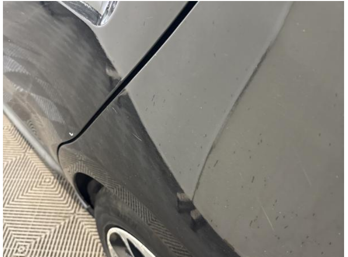
10: Qtr Panel nsr Scratched Over 25mm Thru Paint