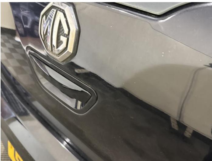
13: Tailgate Scratched Over 25mm Thru Paint