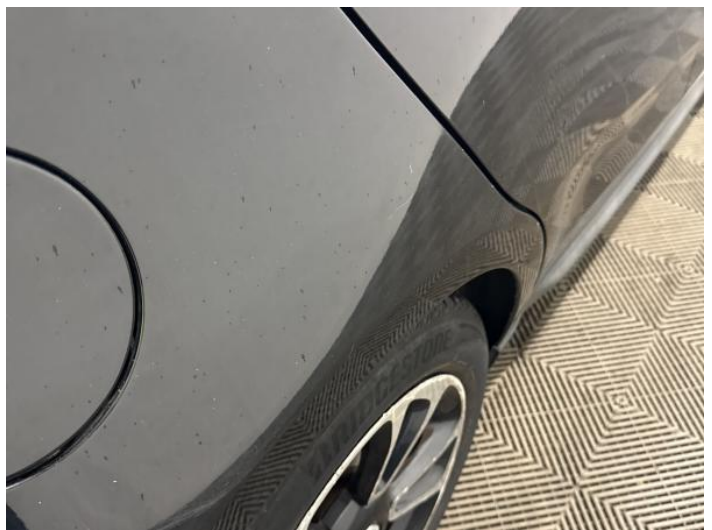
14: Qtr Panel osr Scratched Over 25mm Thru Paint