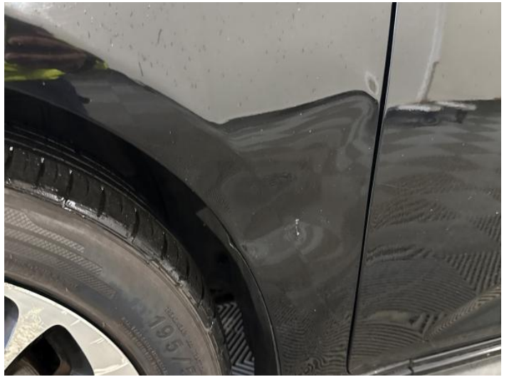
6: Wing nsf Dented With Paint Damage