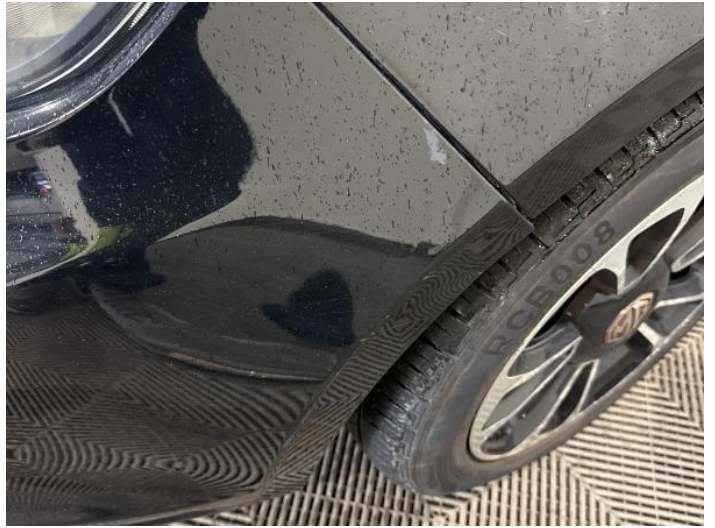
4: Bumper Front Poor Previous Repair Paint Flake