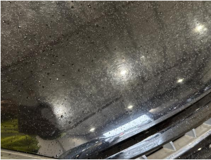
3: Bonnet Chipped 1 To 5