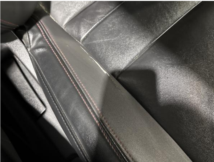
1: Seat Base Cover osf Torn Over 3mm