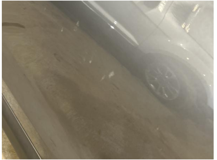
10: Door nsf Chipped Multiple Chips