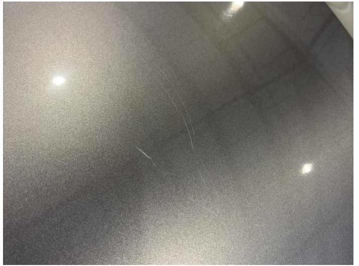
12: Bonnet Scratched Over 25mm Thru Paint