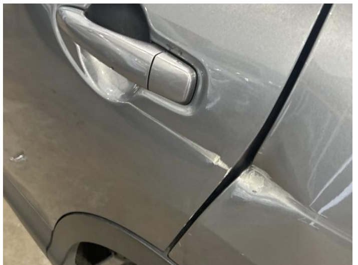
8: Door nsr Dented With Paint Damage