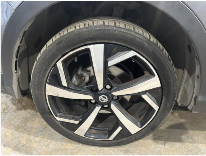
11: Wheel nsf Scratched Over 50mm