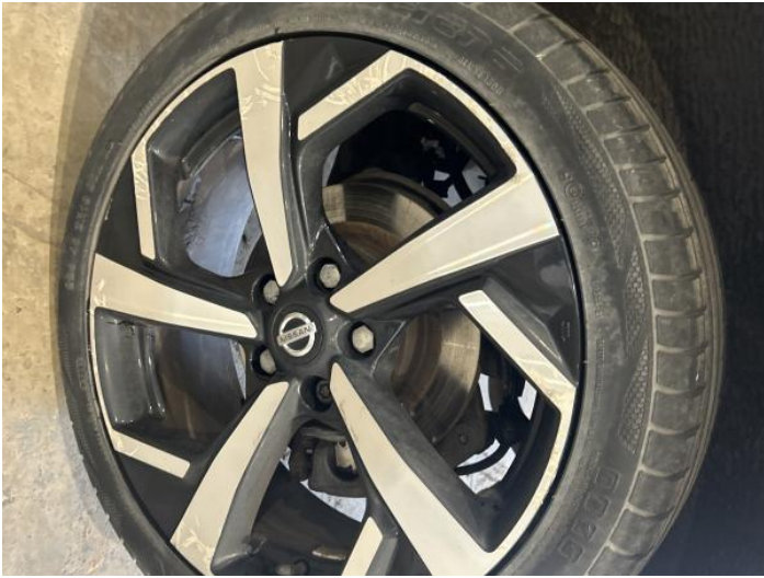
9: Wheel nsf Scratched Over 50mm