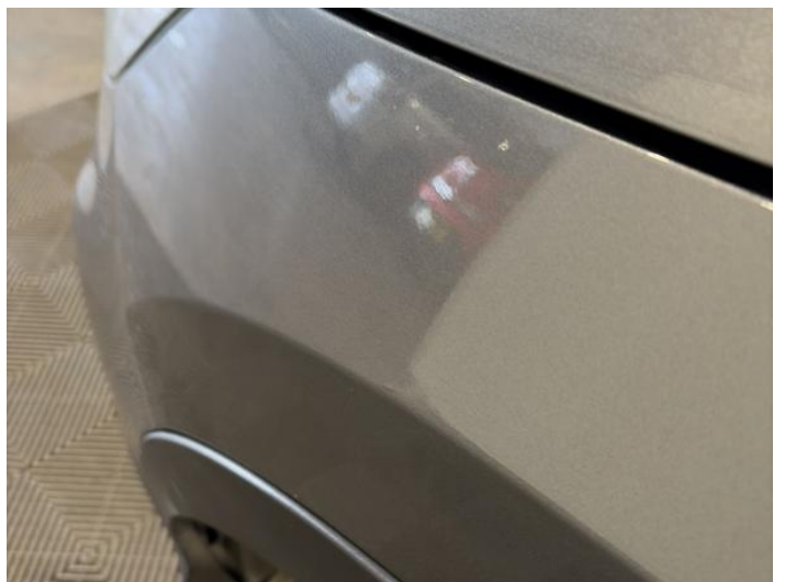
14: Wing nsf Dented 2 Or Less UpTo 10mm