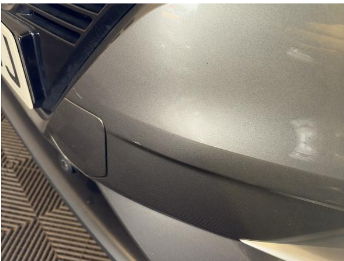
13: Bumper Front Scratched UpTo 25mm Thru Paint