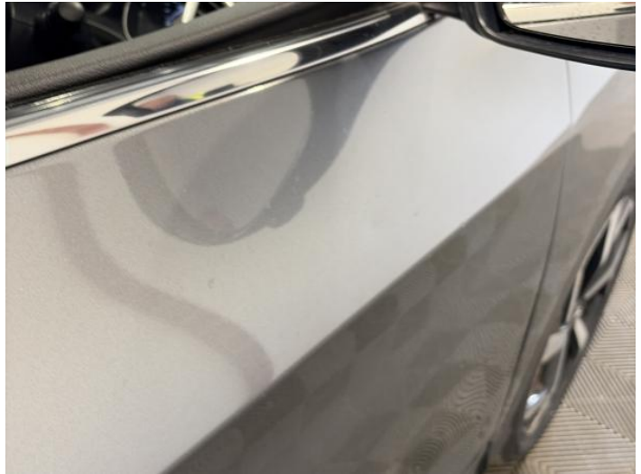
15: Door osr Dented Between 10mm + 30mm