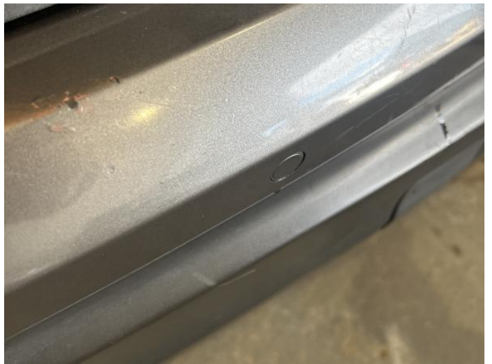
6: Bumper Rear Poor Previous Repair Paint Flake