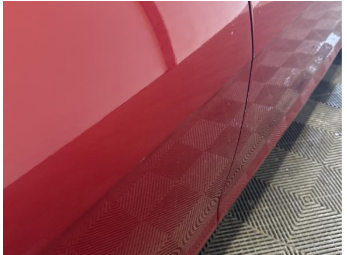
10: Door osr Dented Between 10mm + 30mm