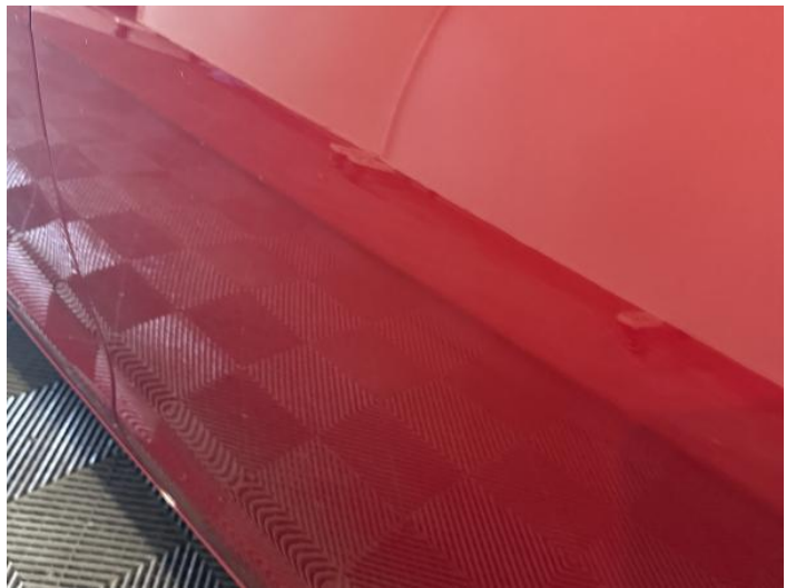
6: Door nsr Dented With Paint Damage