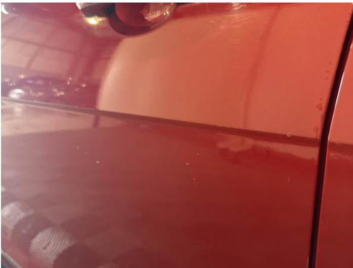
5: Door nsf Dented With Paint Damage