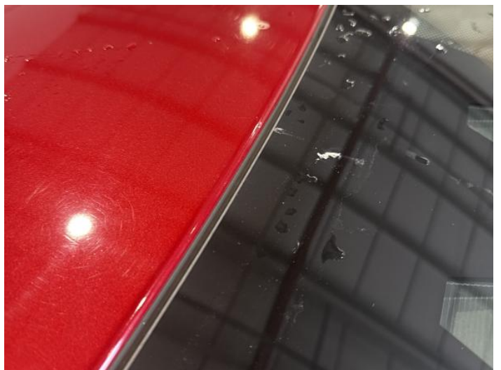
14: Roof Chipped Edge Chip