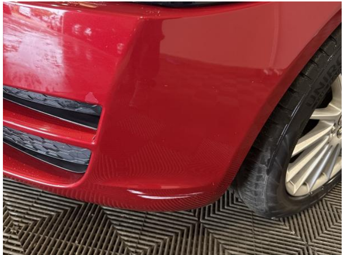
2: Bumper Front Poor Previous Repair Paint Flake