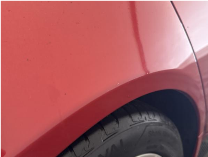
9: Qtr Panel osr Chipped 1 To 5