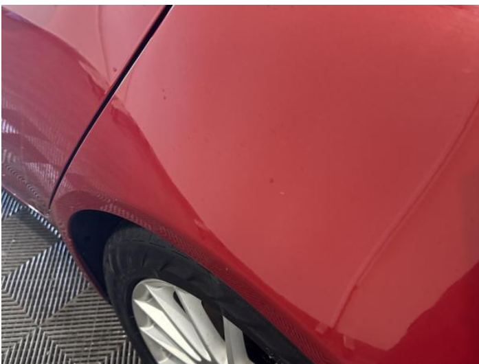
7: Qtr Panel nsr Chipped 1 To 5