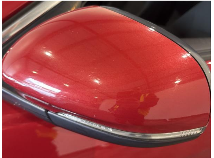
4: Door Mirror Assy nsf Scratched (Painted) UpTo 25mm Thru Paint