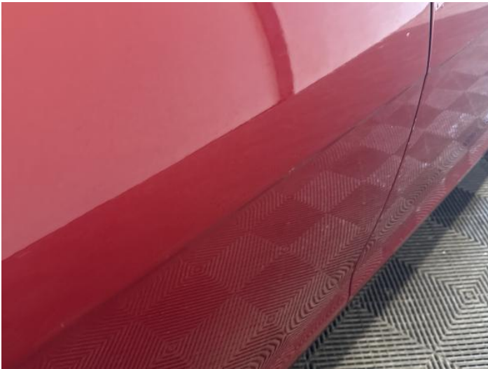
11: Door osr Chipped 1 To 5