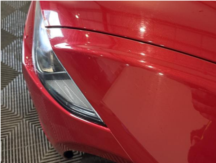
3: Wing nsf Chipped 1 To 5