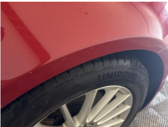
13: Wing osf Scratched Up To 25mm Thru Paint