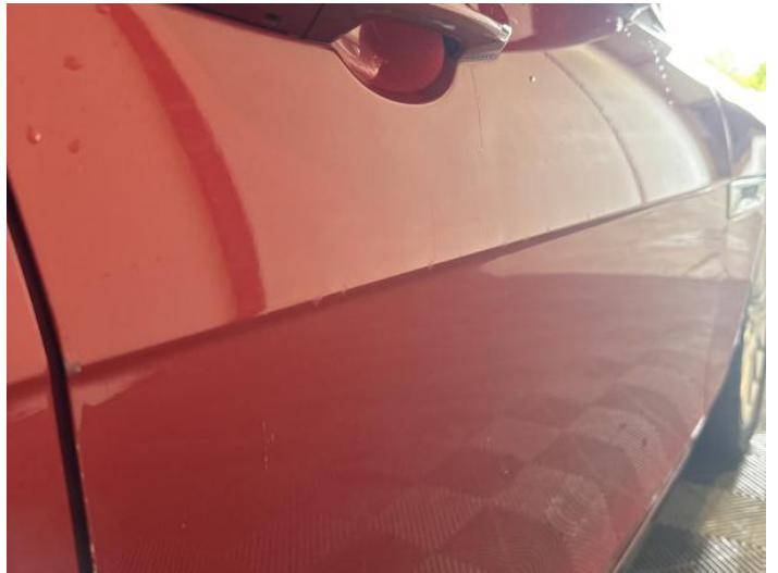
12: Door osf Dented With Paint Damage