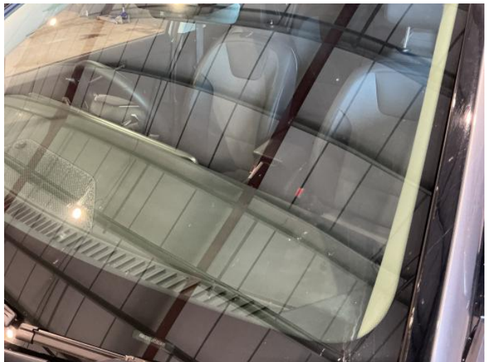
2: Screen Front Chipped Over 10mm