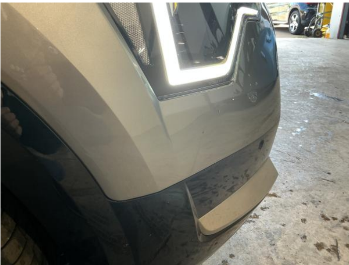
1: Bumper Front Chipped 1 To 5