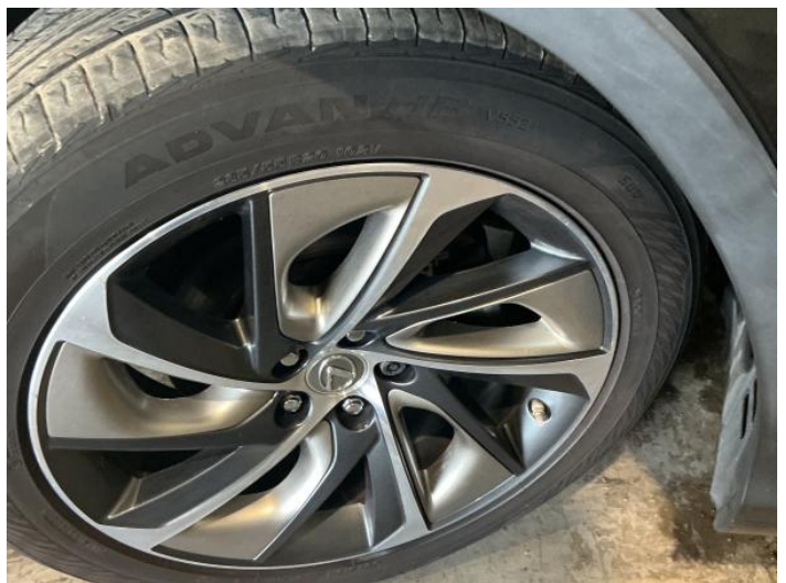
8: Wheel osf Scratched Up To 50mm