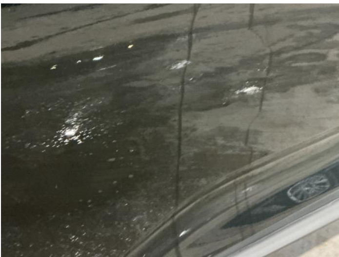
13: Door nsf Chipped 1 To 5