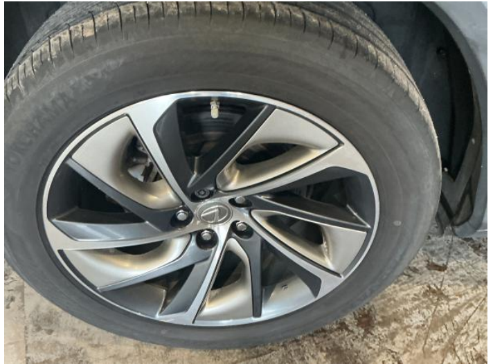
4: Wheel osr Scratched Up To 50mm