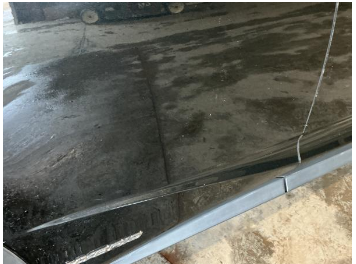
6: Door osr Chipped Multiple Chips