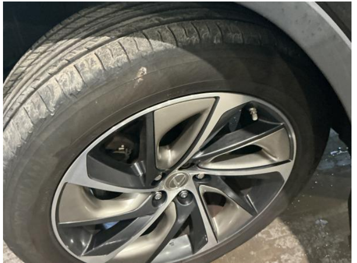
12: Wheel nsf Scratched Up To 50mm