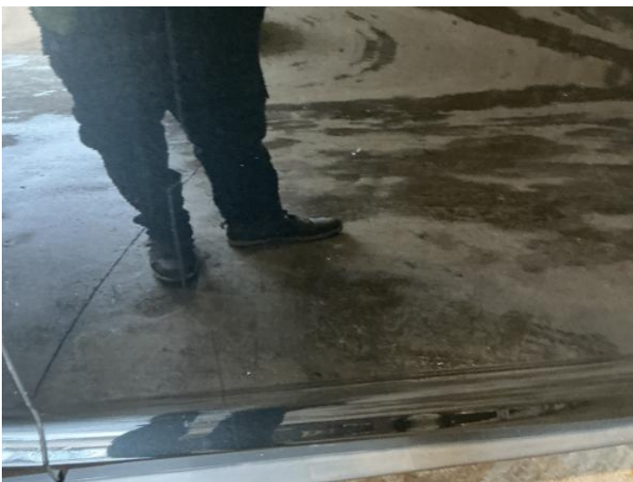
7: Door osf Chipped Multiple Chips