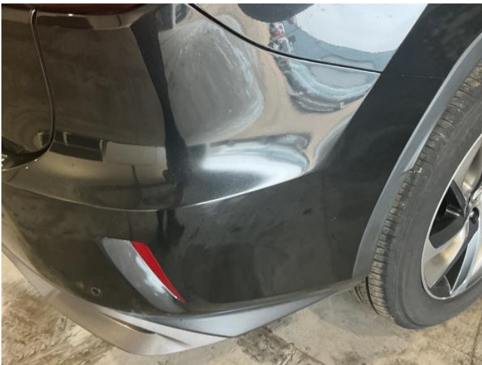
1: Bumper Rear Scratched 25 to 100mm Thru Paint