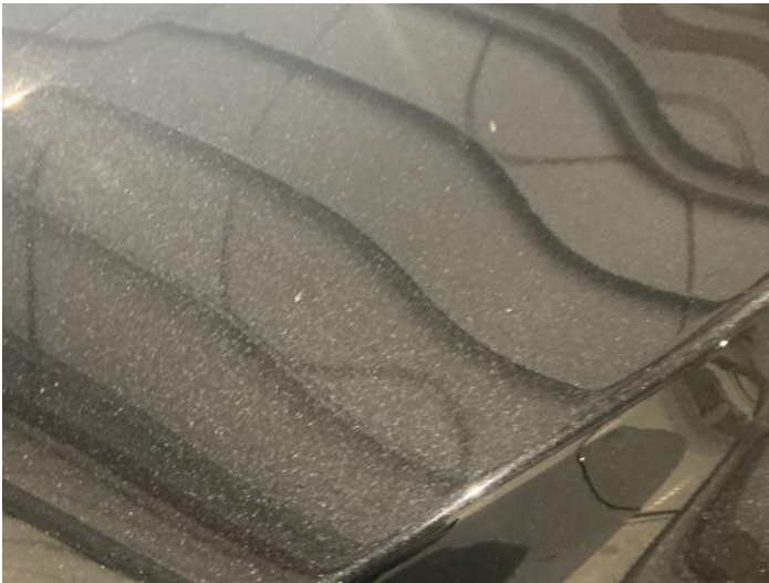
11: Bonnet Chipped 1 To 5