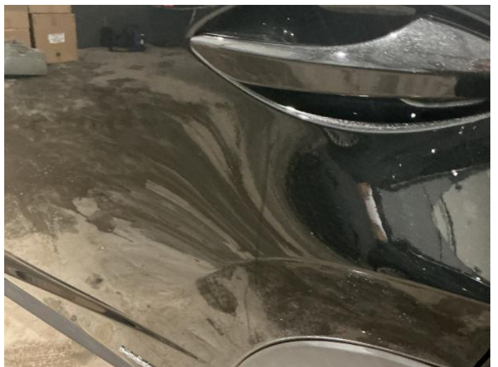
14: Door nsr Chipped 1 To 5