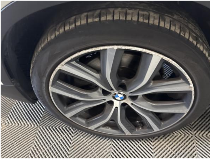
3: Wheel nsf Scratched Over 50mm