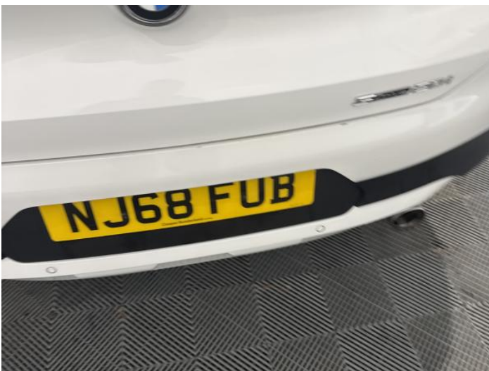
7: Bumper Rear Scratched 25 to 100mm Thru Paint