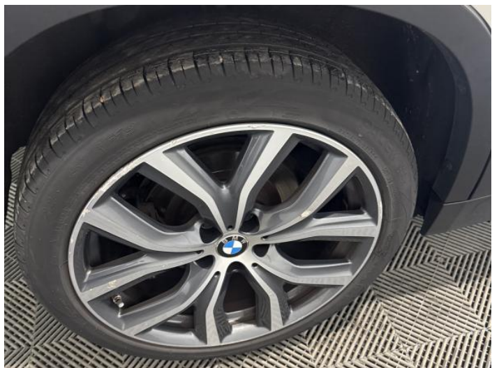
8: Wheel osr Scratched Over 50mm