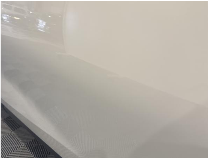
5: Door nsr Dented 2 Or Less UpTo 10mm