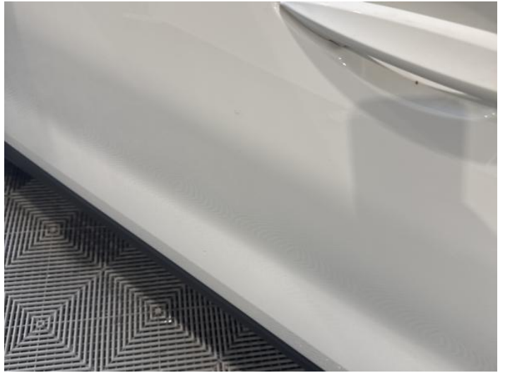
4: Door nsf Chipped 1 To 5