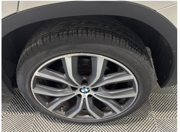
6: Wheel nsr Scratched Over 50mm