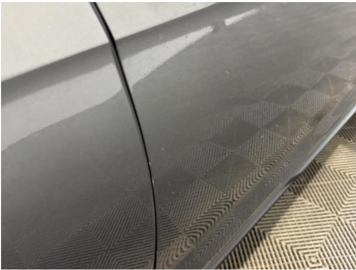
13: Door osf Chipped Edge Chip