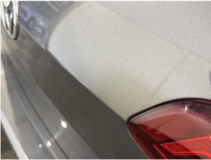
11: Tailgate Dented Between 10mm + 30mm