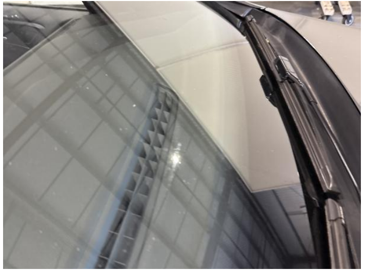
16: Screen Front Chipped UpTo 10mm