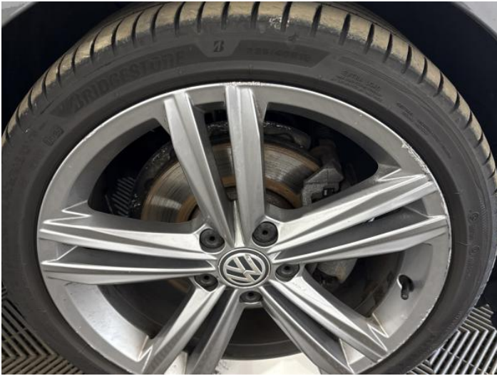
15: Wheel osf Scratched Over 50mm