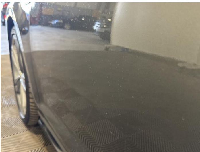
7: Door nsf Dented Between 10mm + 30mm