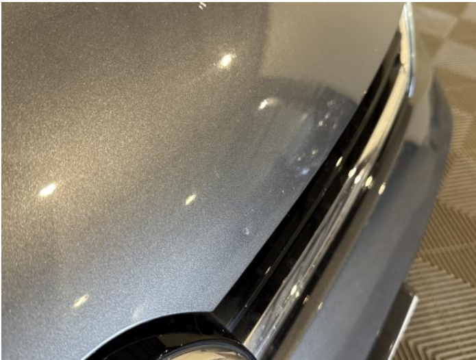
1: Bonnet Dented Between 10mm + 30mm