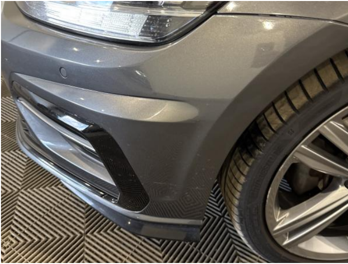
3: Bumper Front Scratched 25 to 100mm Thru Paint