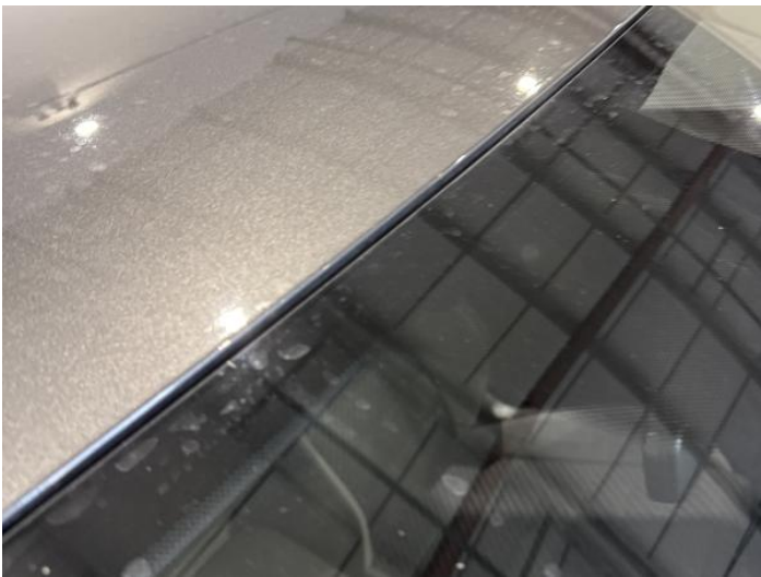
17: Roof Chipped Edge Chip