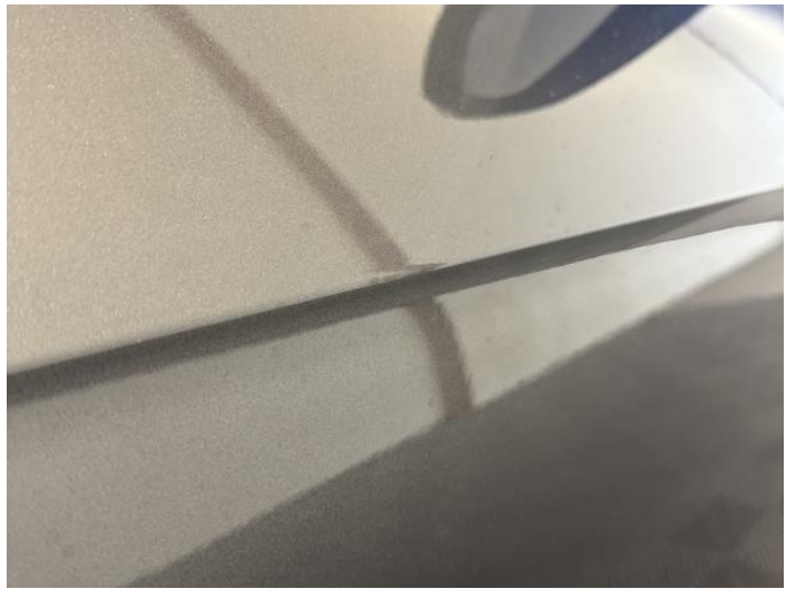
14: Door osf Scratched Up To 25mm Thru Paint