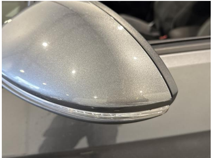
6: Door Mirror Assy nsf Scratched (Painted) Over 25mm Thru Paint