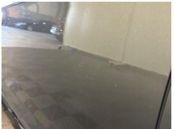
8: Door nsf Chipped 1 To 5