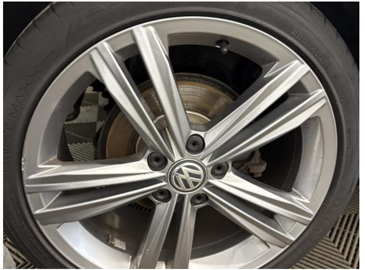
12: Wheel osr Scratched Up To 50mm