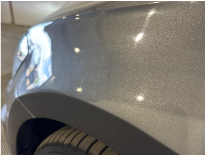
5: Wing nsf Poor Previous Repair Poor Paint