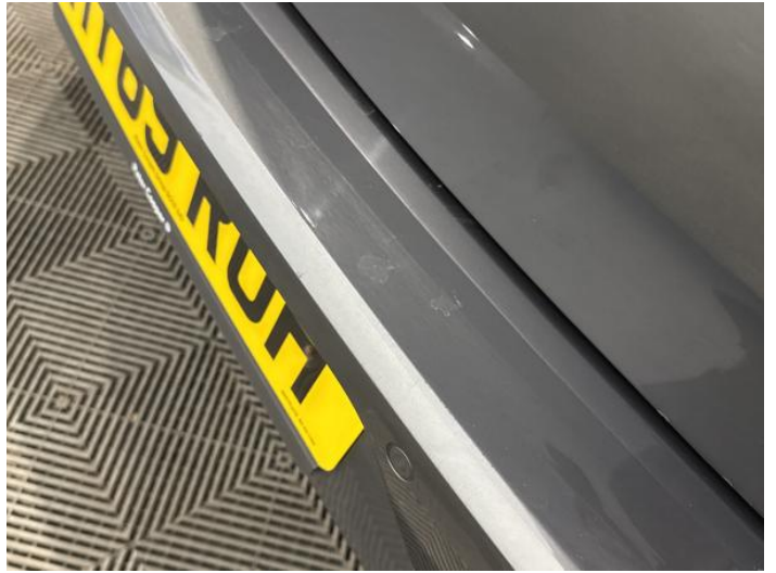
10: Bumper Rear Chipped 1 To 5