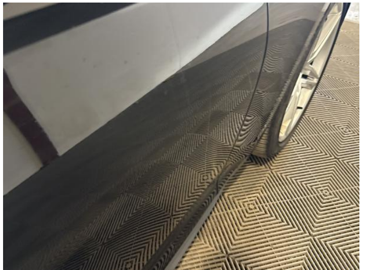
12: Door osf Dented Over 30mm