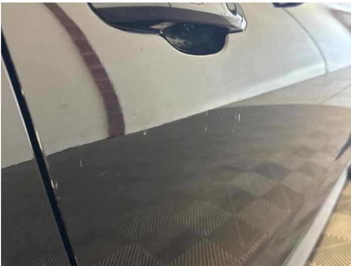
11: Door osf Scratched Over 25mm Thru Paint