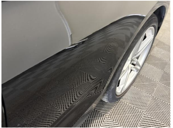
6: Qtr Panel nsr Dented Over 30mm