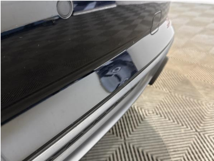
9: Bumper Rear Dented Between 10mm + 30mm