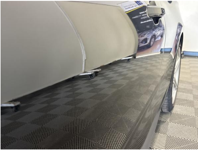
5: Door nsf Dented Over 30mm