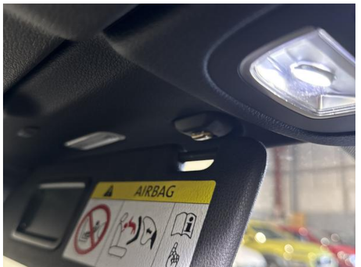
14: Sunvisor ns Broken Replace