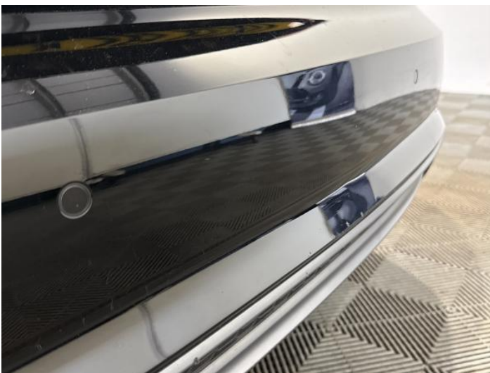
7: Bumper Rear Scratched 25 to 100mm Thru Paint