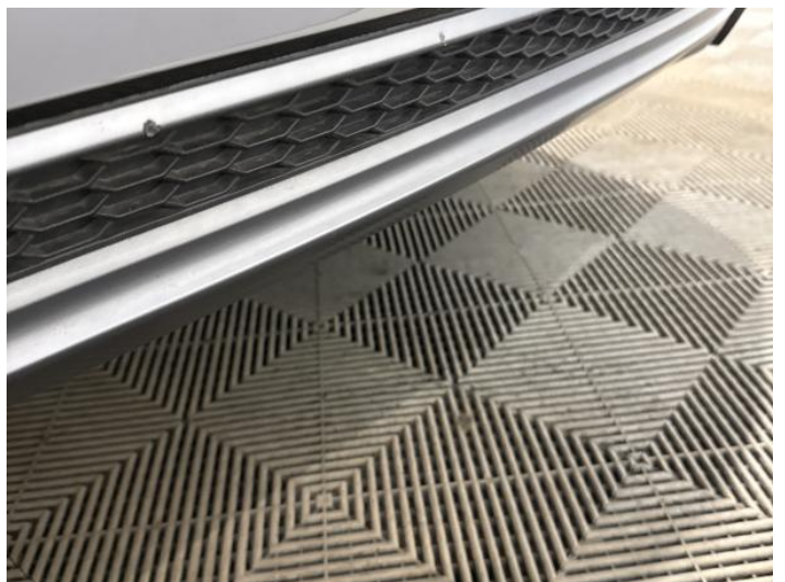
8: Bumper Rear Moulding Scratched (Painted) Over 25mm Thru Paint