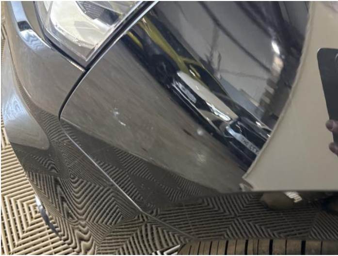
3: Wing nsf Scratched Up To 25mm Thru Paint