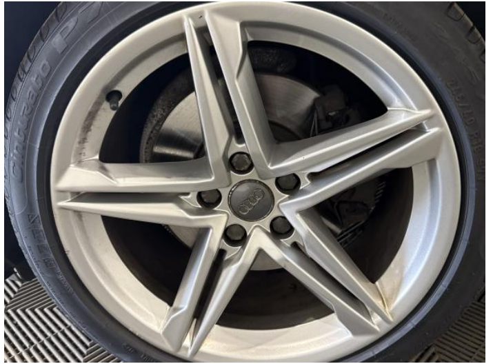
4: Wheel nsf Scratched Up To 50mm