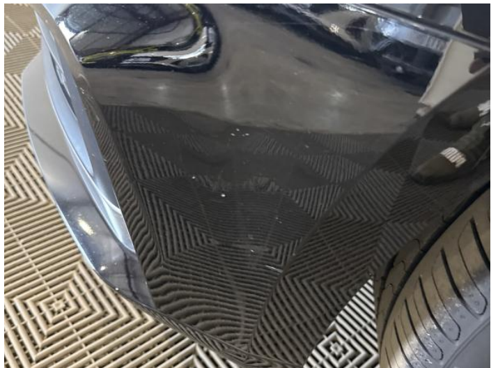
2: Bumper Front Scratched UpTo 25mm Thru Paint