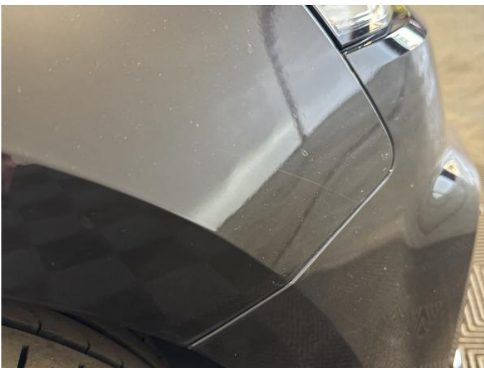
13: Wing osf Chipped 1 To 5