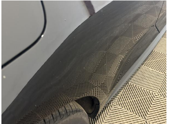
10: Qtr Panel osr Scratched Over 25mm Thru Paint