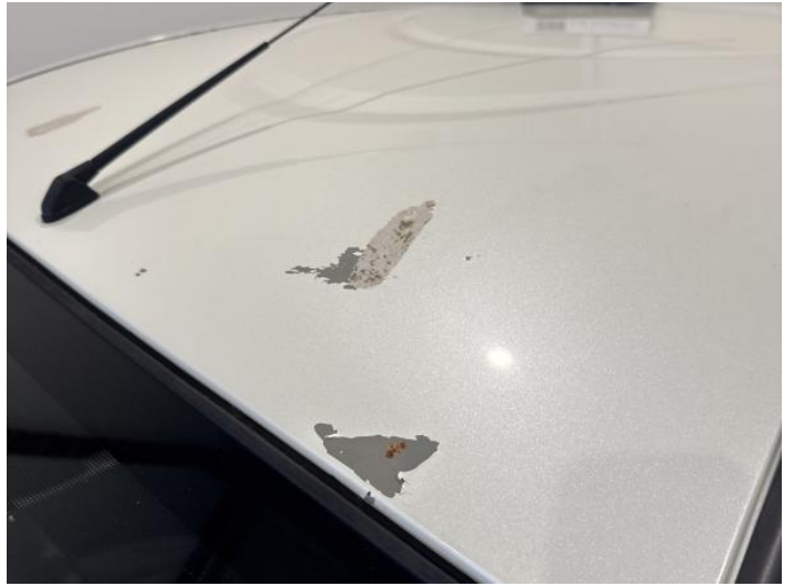
4: Roof Poor Previous Repair Paint Flake