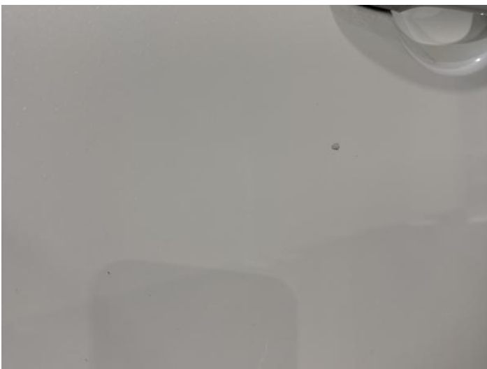
7: Door nsf Chipped 1 To 5