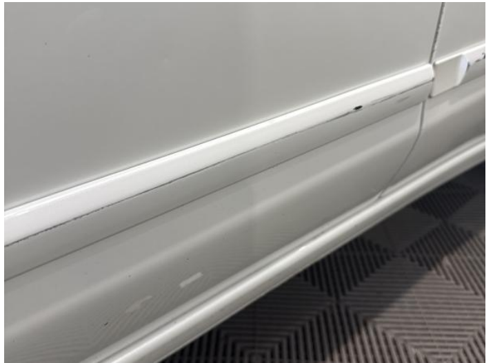
6: Door Moulding nsf Scratched (Painted) Over 25mm Thru Paint