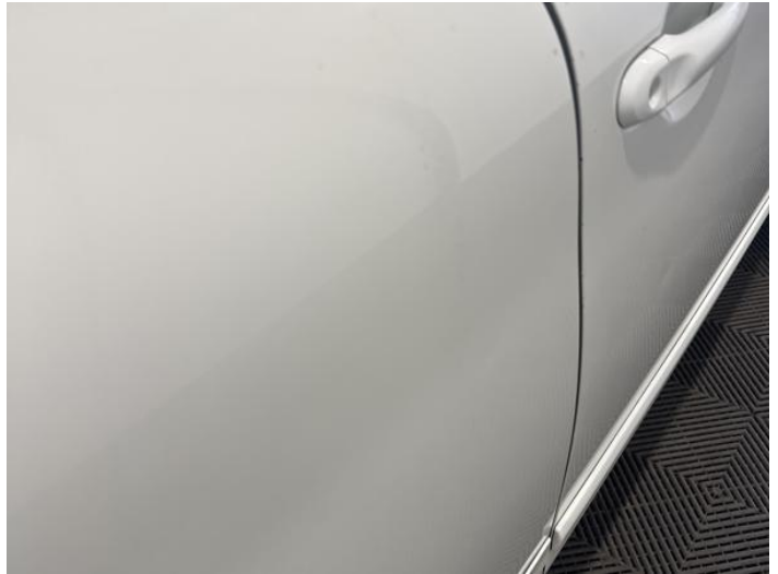
16: Door osr Dented Over 30mm