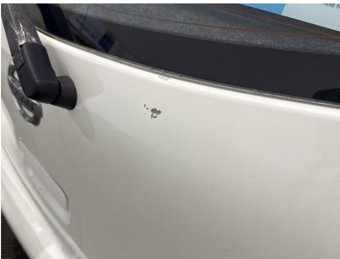
13: Tailgate Scratched Over 25mm Thru Paint