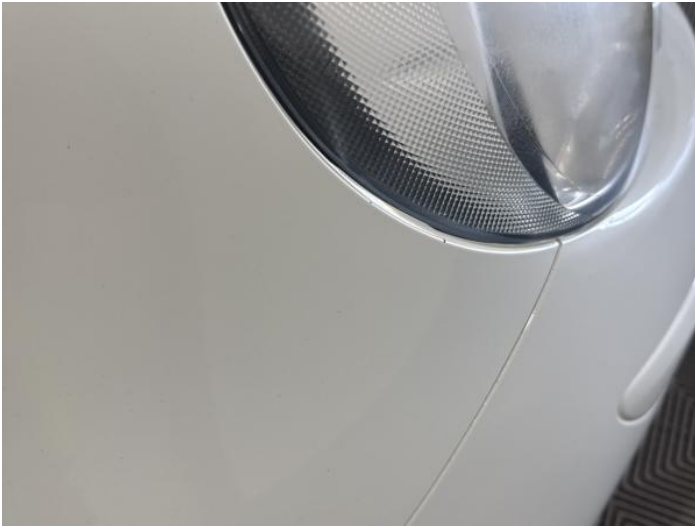
21: Wing osf Chipped 1 To 5