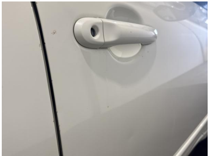
18: Door osf Dented Over 30mm