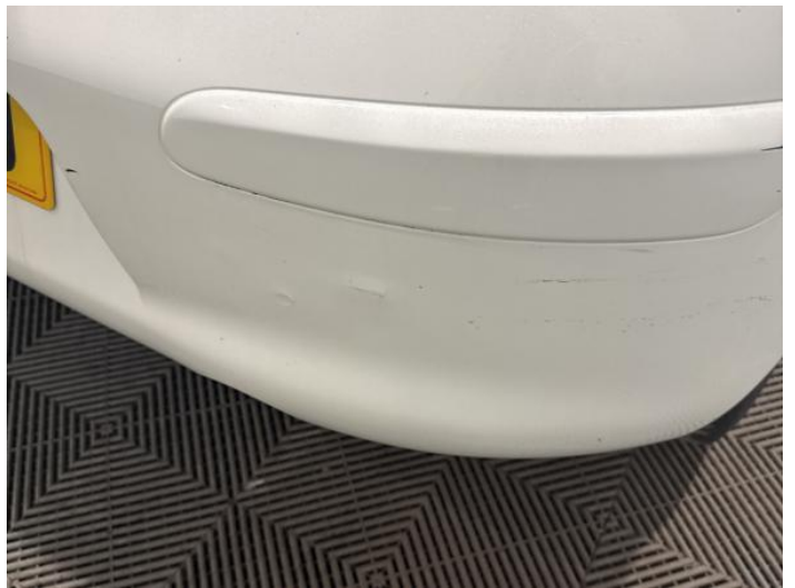
12: Bumper Rear Dented With Paint Damage