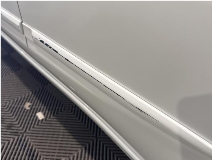
9: Door Moulding nsr Scratched (Painted) Over 25mm Thru Paint