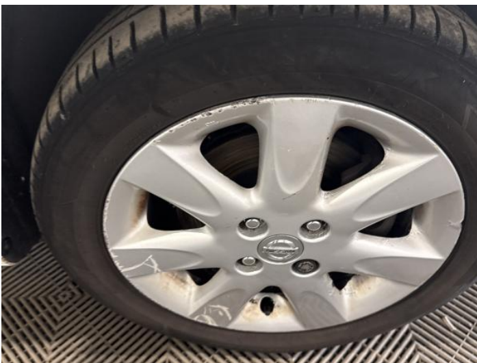
19: Wheel osf Scratched Over 50mm