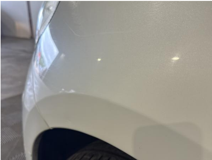
5: Wing nsf Dented Between 10mm + 30mm