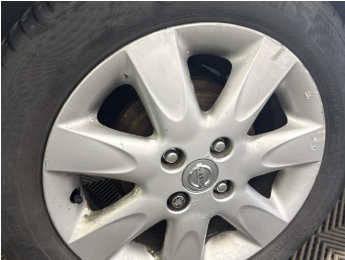
15: Wheel osr Scratched Over 50mm