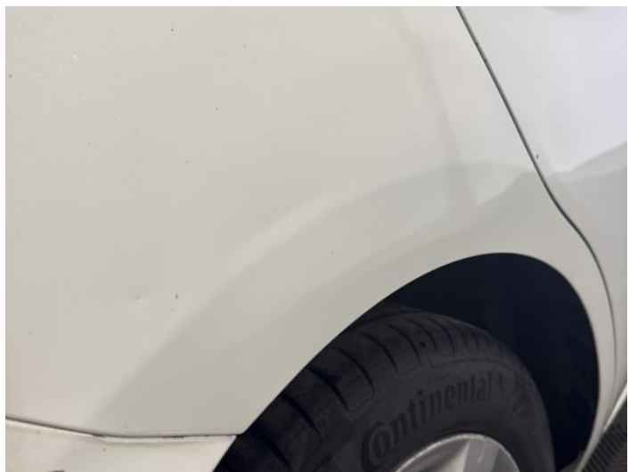
14: Qtr Panel osr Dented Over 30mm