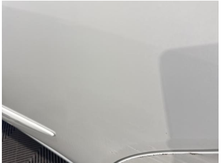
10: Door nsr Scratched Over 25mm Thru Paint