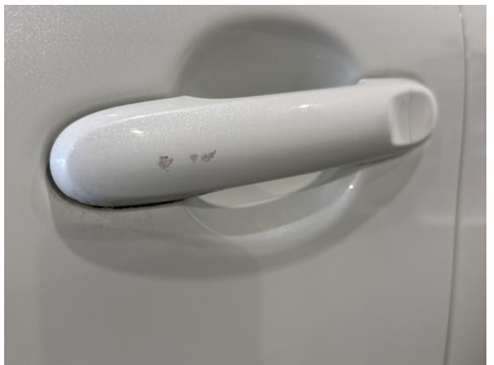
8: Handle Outer nsf Scratched (Painted) Over 25mm Thru Paint