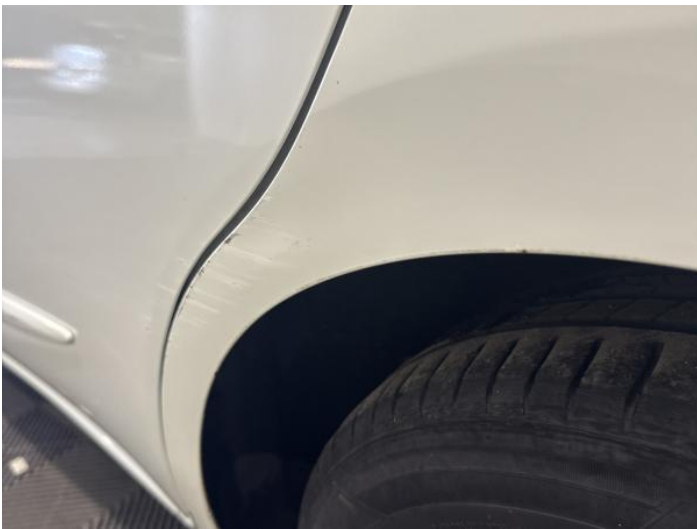
11: Qtr Panel nsr Dented With Paint Damage