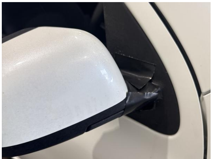
20: Door Mirror Assy osf Broken Replace