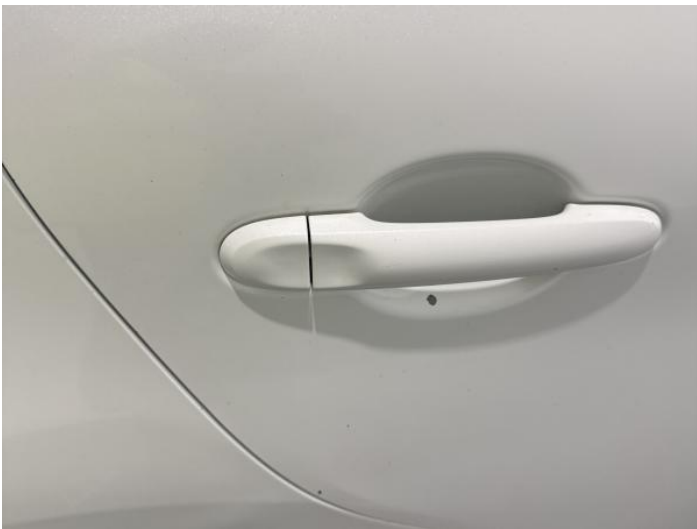
17: Door osr Scratched Over 25mm Thru Paint