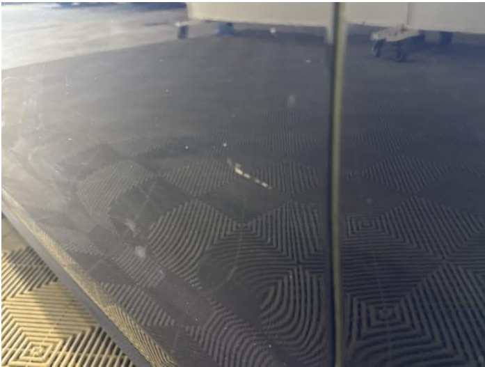
5: Door nsf Scratched Up To 25mm Thru Paint