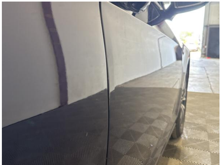
12: Door osf Dented Over 30mm