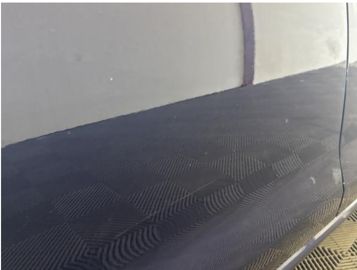
11: Door osr Scratched Over 25mm Thru Paint