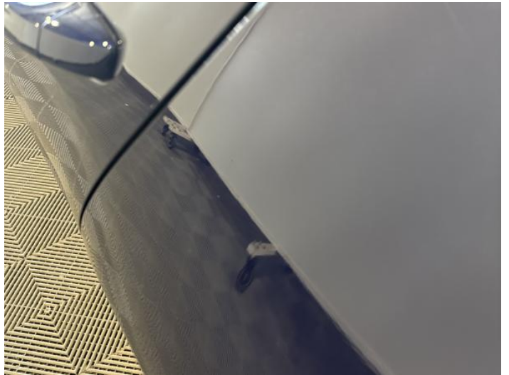
6: Qtr Panel nsr Dented Between 10mm + 30mm