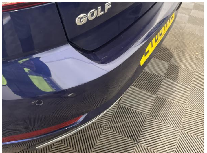
8: Bumper Rear Scratched 25 to 100mm Thru Paint