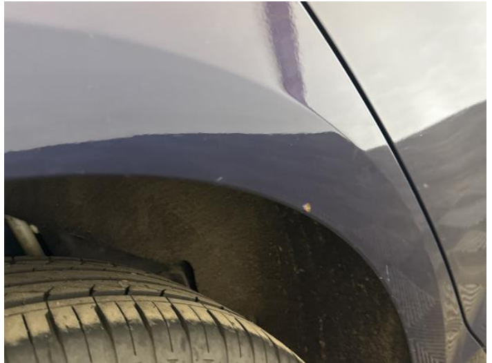
10: Qtr Panel osr Rusted Over 5mm