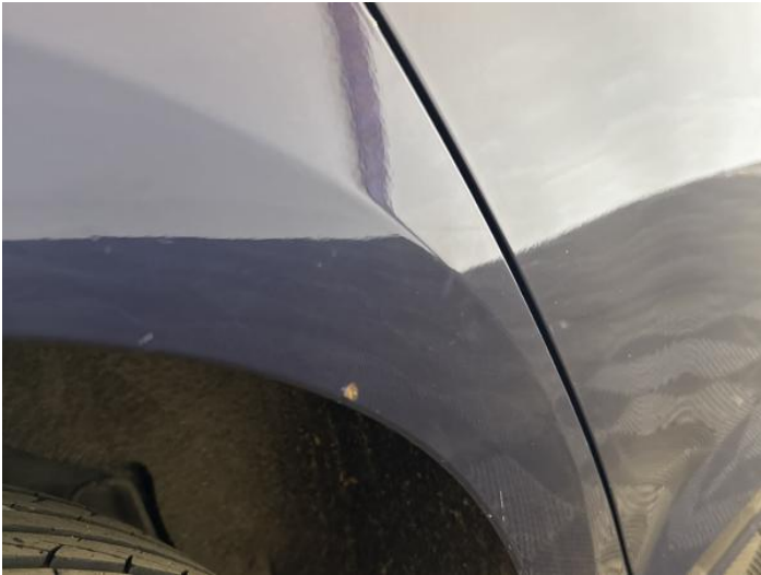
9: Qtr Panel osr Dented Between 10mm + 30mm