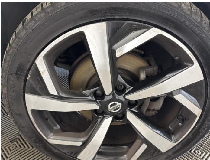
11: Wheel osf Scratched Over 50mm