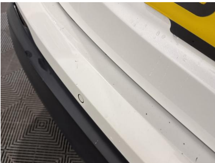
7: Bumper Rear Scratched Up To 25mm Thru Paint