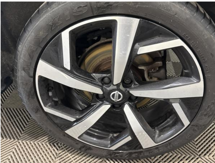
5: Wheel nsr Scratched Over 50mm