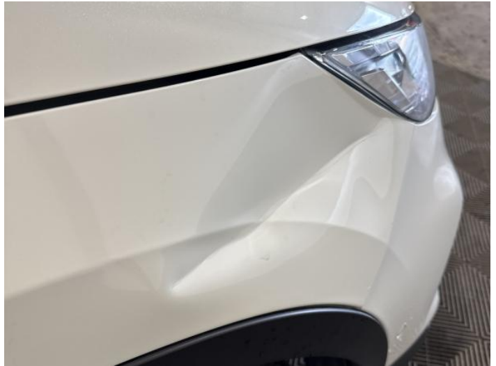
10: Wing osf Dented Over 30mm