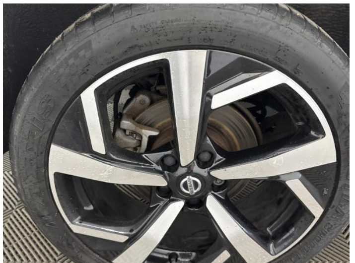
8: Wheel osr Scratched Up To 50mm