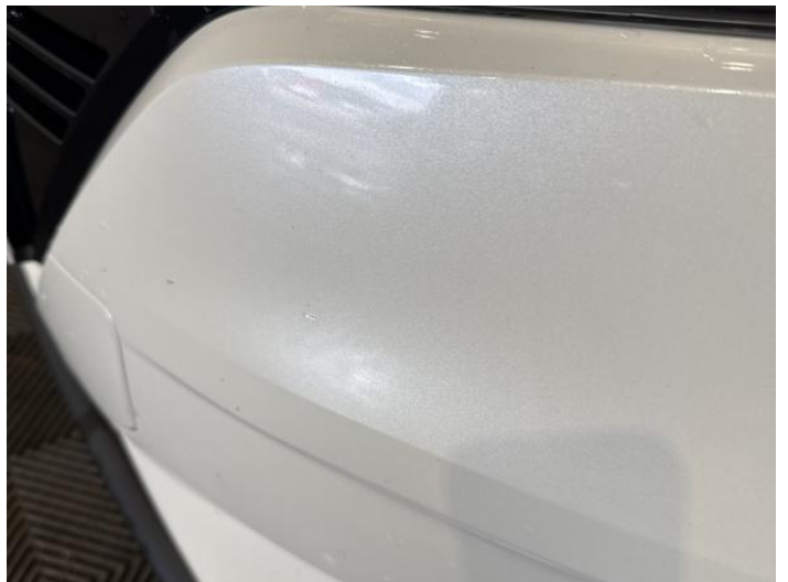
2: Bumper Front Poor Previous Repair Poor Paint