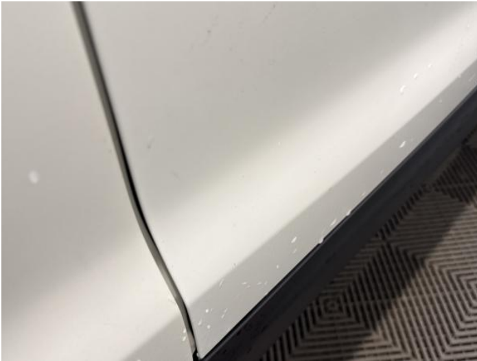
9: Door osf Chipped 1 To 5