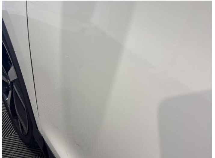
4: Door nsf Dented Between 10mm + 30mm