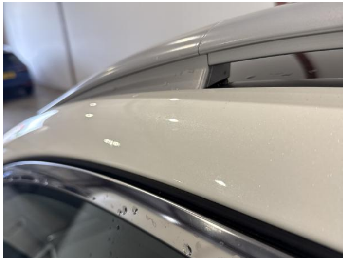
6: A Post ns Dented Over 30mm