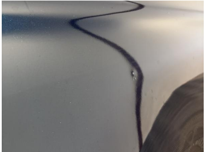
10: Qtr Panel osr Scratched Over 25mm Thru Paint