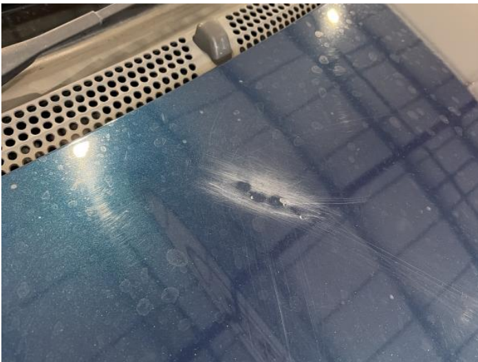
1: Bonnet Scratched Over 25mm Thru Paint