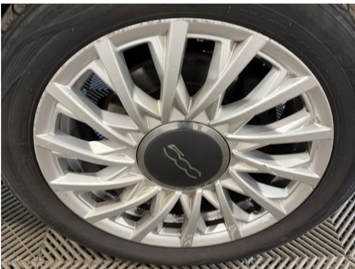
13: Wheel osf Scratched Over 50mm