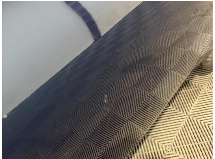
12: Door osf Scratched UpTo 25mm Thru Paint