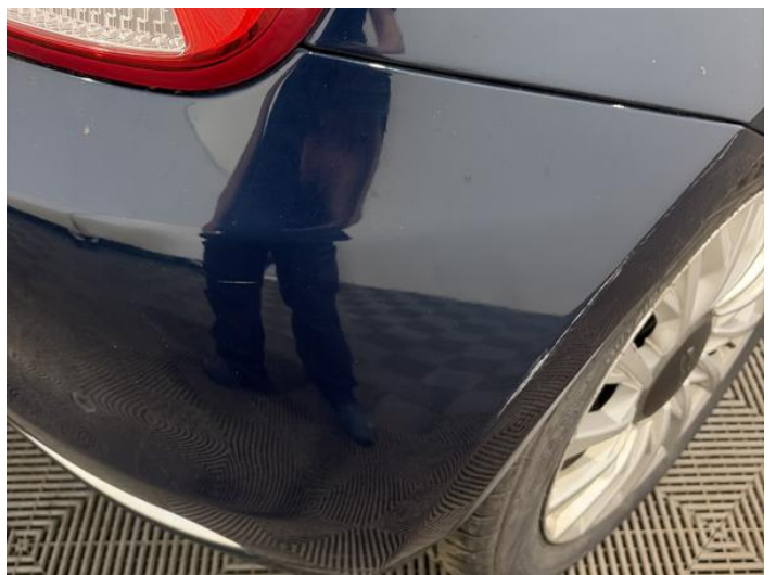
8: Bumper Rear Scratched 25 to 100mm Thru Paint