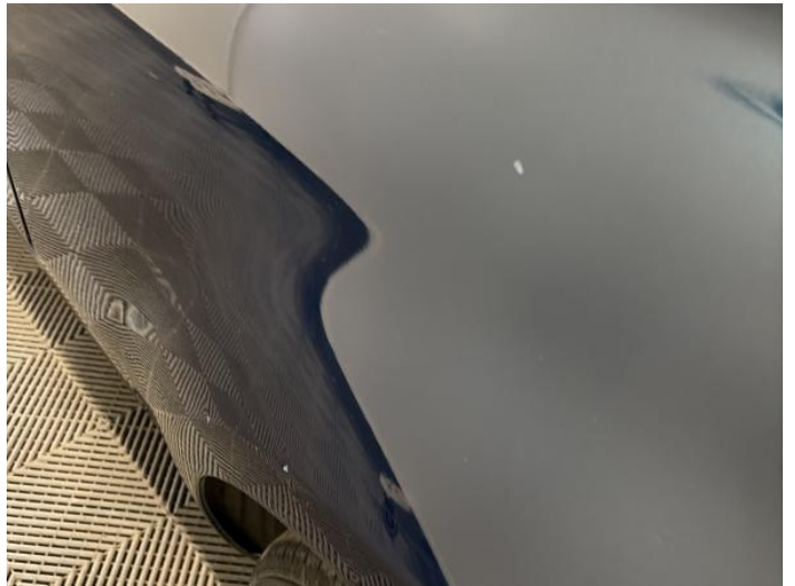
6: Qtr Panel nsr Scratched UpTo 25mm Thru Paint