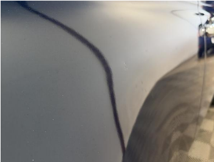
9: Qtr Panel osr Dented Over 30mm