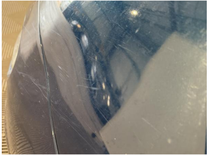
4: Wing nsf Scratched UpTo 25mm Thru Paint