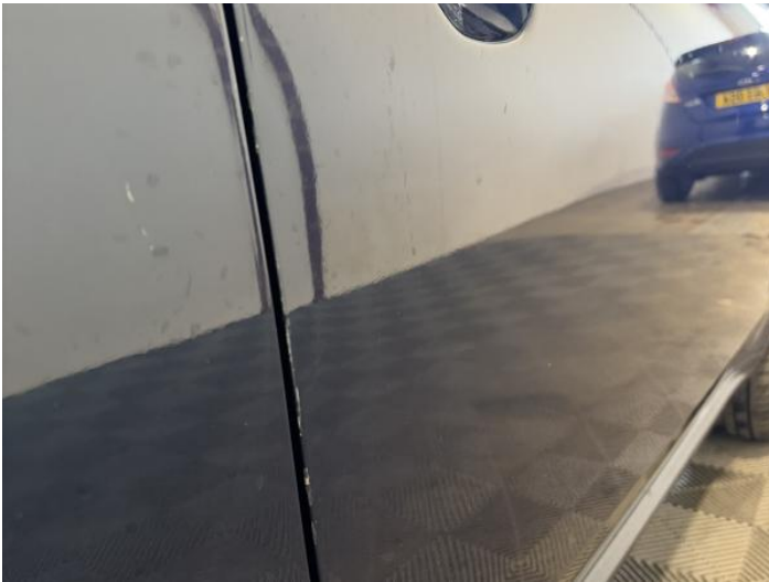
11: Door osf Chipped Edge Chip