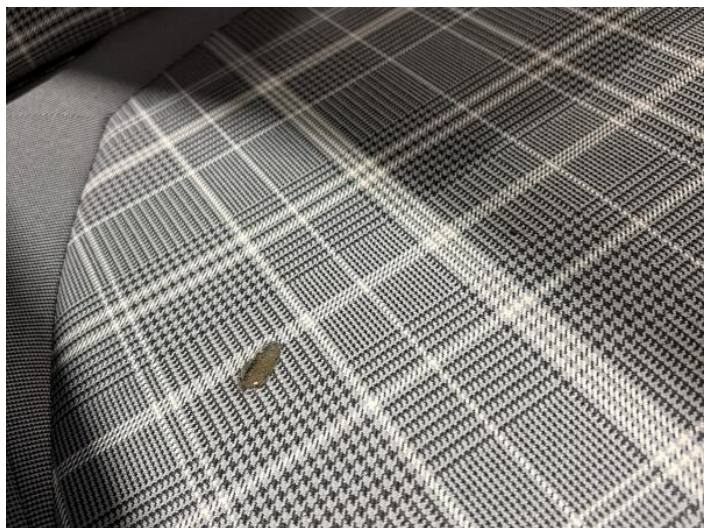
14: Seat Back Cover osr Burn Over 3mm